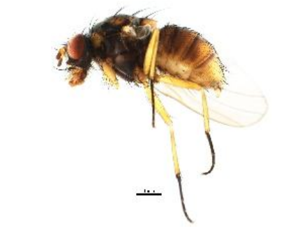
[Lateral] Muscidae BIN URI: BOLD:AAG1717