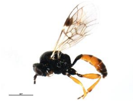
[Lateral] Ichneumonidae BIN URI: BOLD:AAH1932