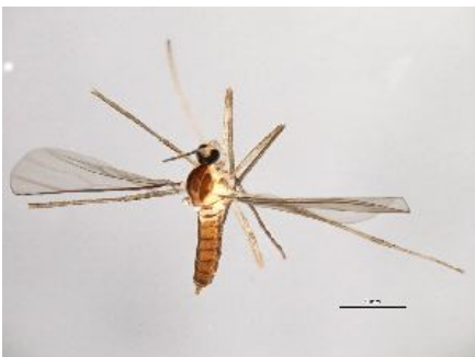
[Dorsal] Cecidomyiidae BIN URI: BOLD:AAH3671