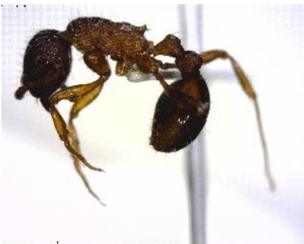
[Lateral] Myrmica americana BIN URI: BOLD:AAA1839