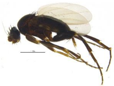
[Lateral] Diplonevra nitidula BIN URI: BOLD:AAG3236