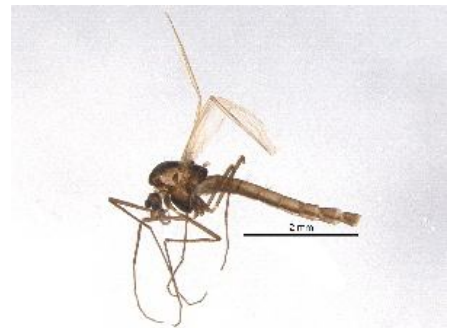
[Lateral] Chironomidae BIN URI: BOLD:ACC4669