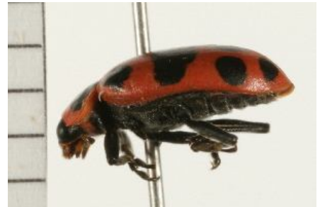
[Lateral] Coleomegilla maculata BIN URI: BOLD:AAD7604