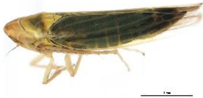
[Lateral] Dikraneura BIN URI: BOLD:AAZ2090