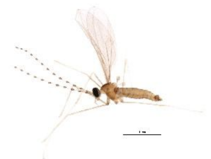
[Lateral] Cecidomyiidae BIN URI: BOLD:AA5205