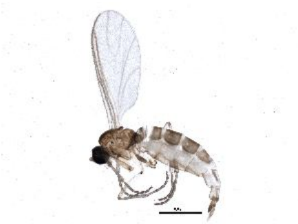
[Lateral] Sciariidae BIN URI: BOLD: ABU5521