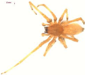
[Dorsal] Cheiracanthium mildei BIN URI: BOLD:AAB7601