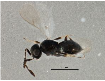
[Lateral] Hymenoptera BIN URI: BOLD:ACC8019