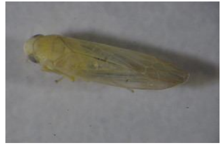
[Dorsal] Hemiptera BIN URI: BOLD:ABA5828