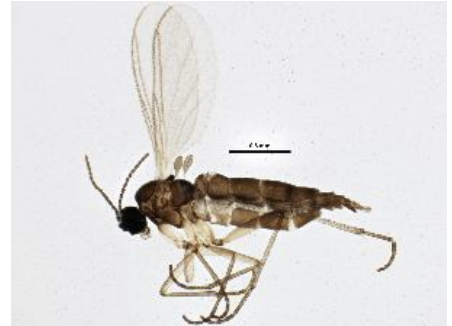
[Lateral] Sciariidae BIN URI: BOLD: ABU5520