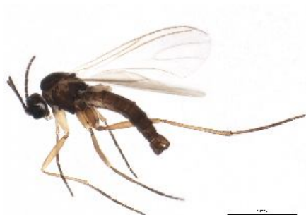
[Lateral] Sciaridae BIN URI: BOLD:AAM9252