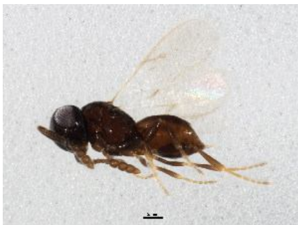
[Lateral] Platygastridae BIN URI: BOLD:AAU8578