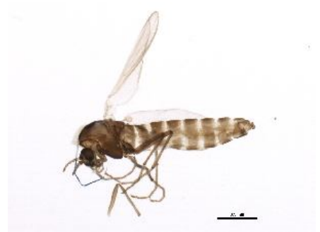
[Lateral] Chironomidae BIN URI: BOLD:AA5356