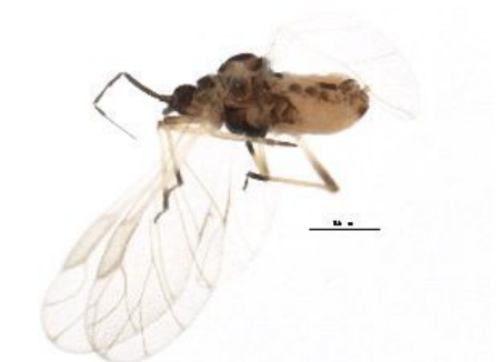
[Lateral] Nearctaphis crataegifoliae BIN URI: BOLD: ACF1270