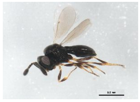
[Lateral] Trimorus BIN URI: BOLD:AAU9229