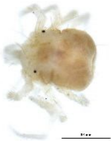
[Dorsal] Anystidae BIN URI: BOLD:AAM7964