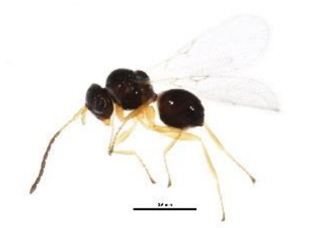
[Lateral] Hymenoptera BIN URI: BOLD:AAU8573