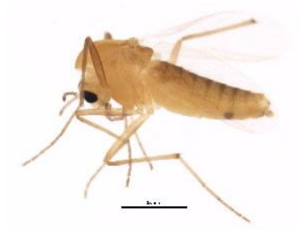
[Lateral] Chironomidae BIN URI: BOLD:AA5342