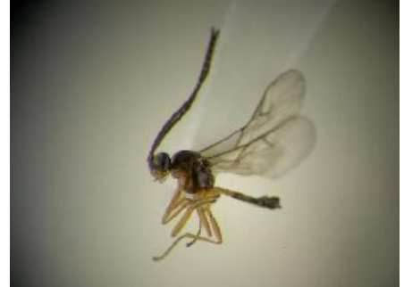
[Lateral] Monoctonus BIN URI: BOLD:AAA4188