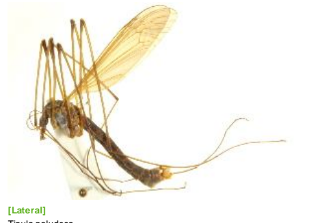
[Lateral] Tipula paludosa BIN URI: BOLD: AAE7386