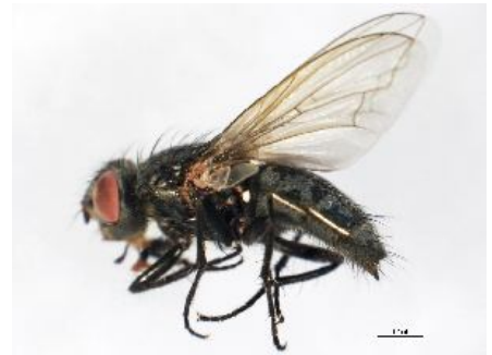
[Lateral] Pollenia pediculata BIN URI: BOLD:AAG6745