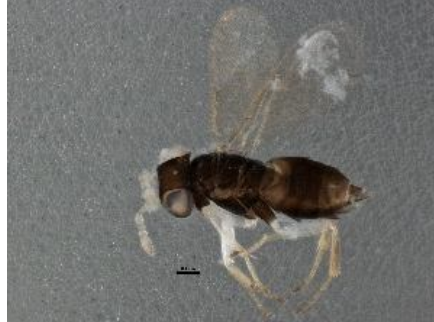
[Lateral] Aphelinus varipes BIN URI: BOLD:ABW3282