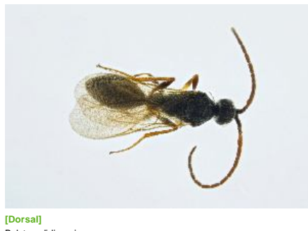
[Dorsal] Belyta validicornis BIN URI: BOLD:AAU8736