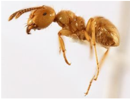
[Lateral] Lasius BIN URI: BOLD:ABY9254