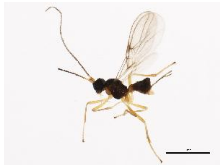
[Lateral] Braconidae BIN URI: BOLD:AAU8583