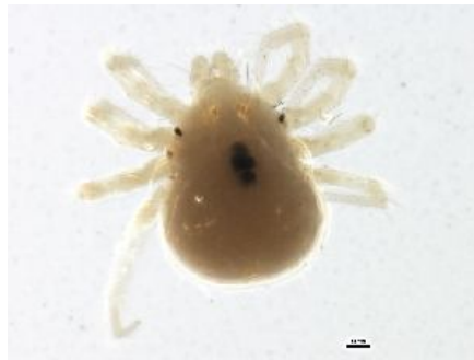
[Dorsal] Anystidae BIN URI: BOLD:ABW5642