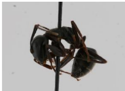
[Lateral] Hymenoptera BIN URI: BOLD:AAA9461