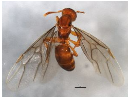
[Dorsal] Formicidae BIN URI: BOLD:AAF0890