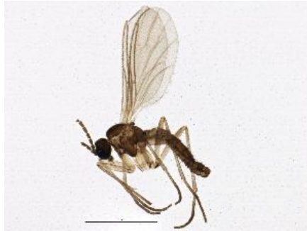
[Lateral] Sciariidae BIN URI: BOLD: ABA6407