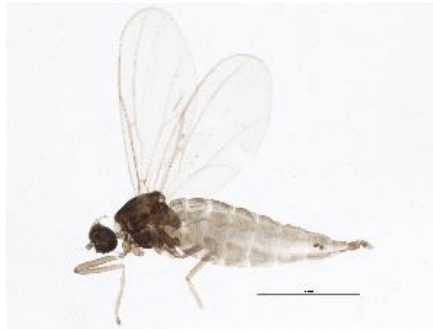
[Lateral] Sciariidae BIN URI: BOLD: AAN6433