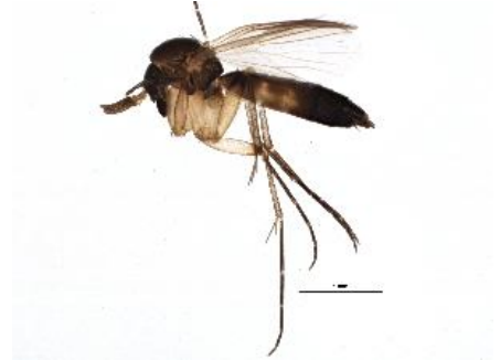
[Lateral] Mycetophilidae BIN URI: BOLD:ABV9015