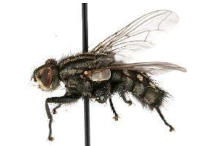
[Lateral] Diptera BIN URI: BOLD:AAG6743