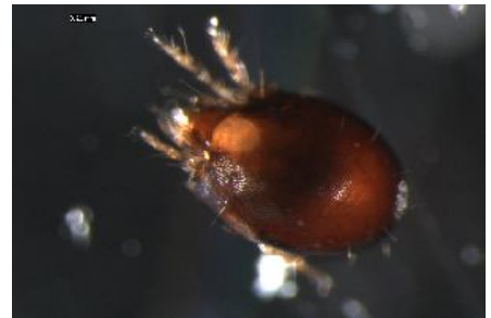
[Dorsal] Trichoribates BIN URI: BOLD:AAH2450