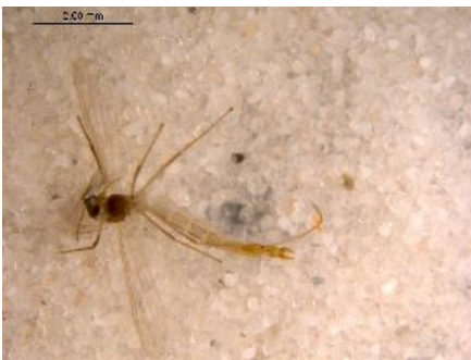
[Ventral] Micropsectra subletteorum BIN URI: BOLD:AAF7088