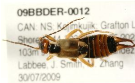
[Dorsal] Forticula auricularia-A BIN URI: BOLD:AAG9897