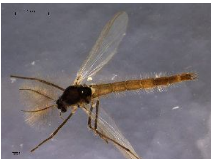
[Dorsal] Paracadopelma winnelli BIN URI: BOLD: AAK4963