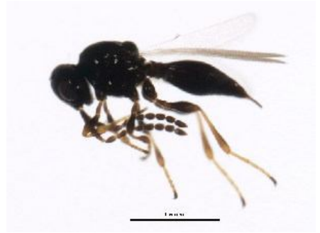
[Lateral] Hymenoptera BIN URI: BOLD:AAU8342