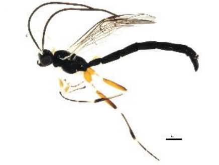
[Lateral] Ephialtes manifestator BIN URI: BOLD:AAU8667