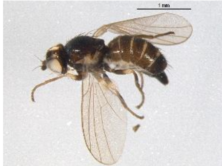
[Lateral] Cerodontha muscina BIN URI: BOLD:AAF1051