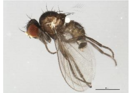
[Dorsal] Agromyzidae BIN URI: BOLD:AAV4830