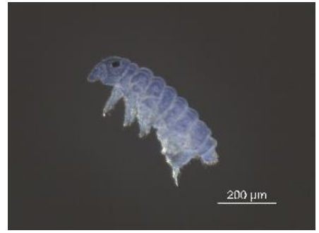
[Lateral] Collembola BIN URI: BOLD: AAN6447