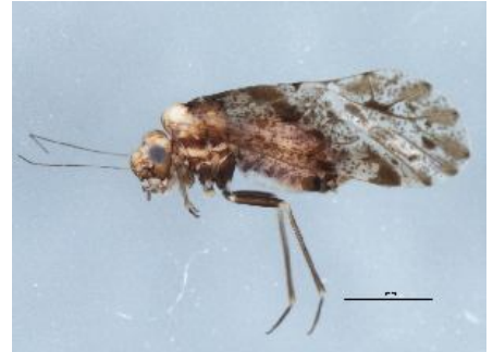
[Lateral] Psocoptera BIN URI: BOLD:ACE6318