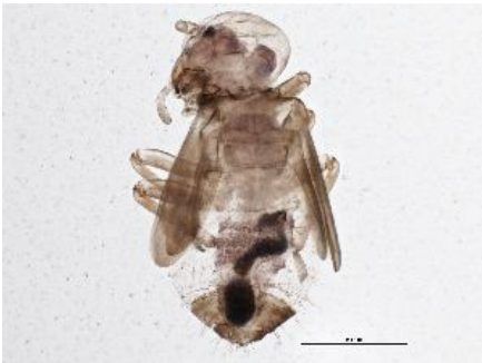
[Dorsal] Psocoptera BIN URI: BOLD:ACJ6739