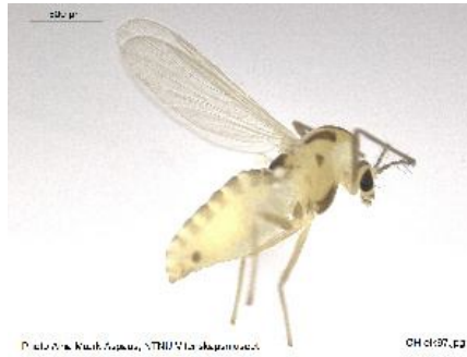
[Lateral] Paraphaenocladus impensus BIN URI: BOLD:AAC4197