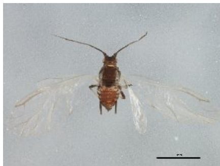
[Dorsal] Myzus cerasi BIN URI: BOLD: AAB2802