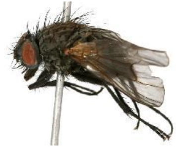
[Lateral] Helina evecia BIN URI: BOLD:AAC2498