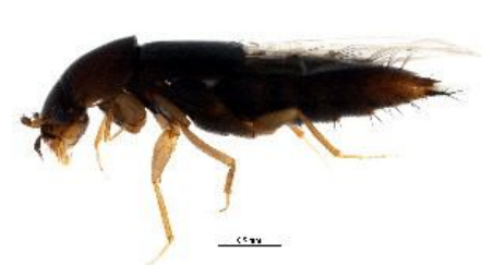
[Lateral] Habrocerus capillaricornis BIN URI: BOLD:AAH0117