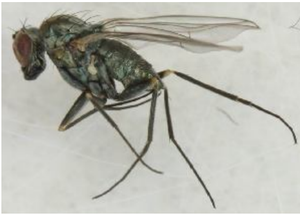
[Lateral] Medetera jacula BIN URI: BOLD:ACE1342