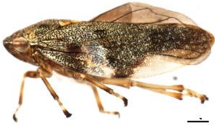
[Lateral] Aphrophora quadrinotata BIN URI: BOLD:AAZ2091