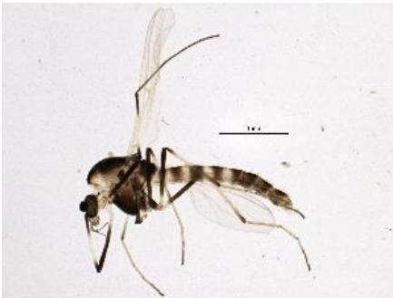
[Lateral] Cricotopus BIN URI: BOLD:AA5318