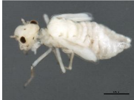
[Dorsal] Psocoptera BIN URI: BOLD:AAN8447