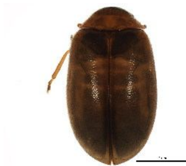
[Lateral] Cyphon laevipennis BIN URI: BOLD:AAG3633