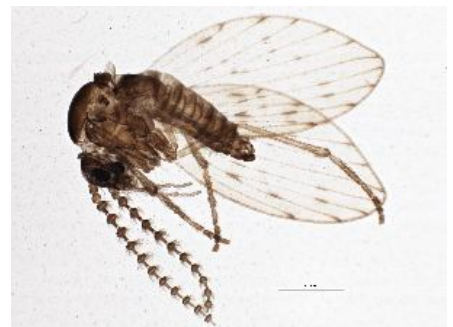
[Lateral] Psychodidae BIN URI: BOLD:AAP4712