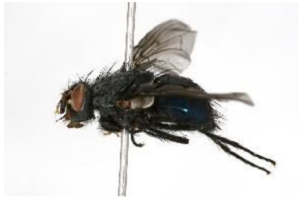
[Lateral] Cynomya cadaverina BIN URI: BOLD:AAB0868