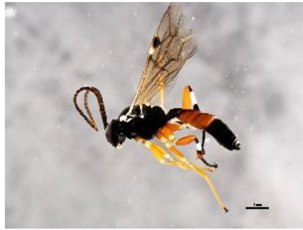
[Lateral] Diplazon laetatorius BIN URI: BOLD:AAD4214