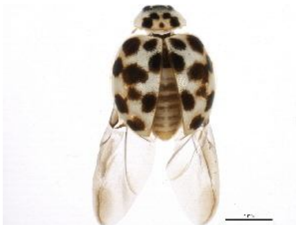
[Dorsal] Psyllobora vigintimaculata BIN URI: BOLD:AAH3320