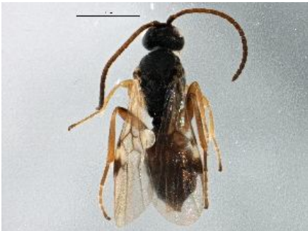
[Lateral] Microplitis jf109 BIN URI: BOLD:AAB8493