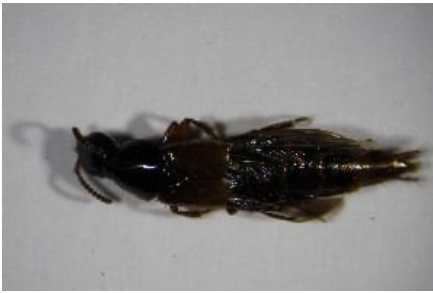
[Dorsal] Quedius cruentus BIN URI: BOLD:AAO1236