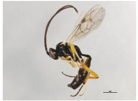
[Lateral] Campopleginae BIN URI: BOLD:AAG5792