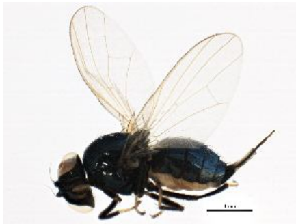
[Lateral] Lonchaea BIN URI: BOLD:AAG7070