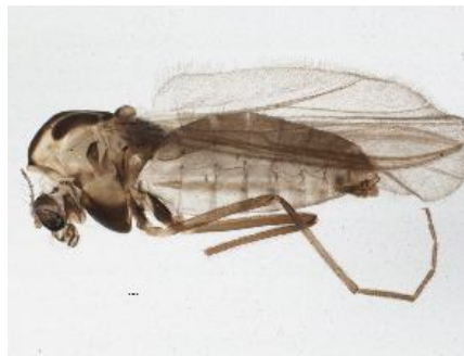
[Lateral] Heterotrissocladus BIN URI: BOLD:AA5836