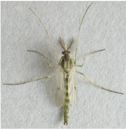
[Dorsal] Chironomidae BIN URI: BOLD:AAB7030