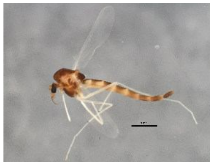
[Lateral] Chironomidae BIN URI: BOLD:AAG0920