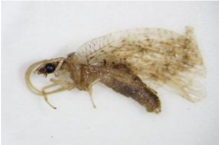
[Dorsal] Hemerobius humulinus BIN URI: BOLD:AAG0892