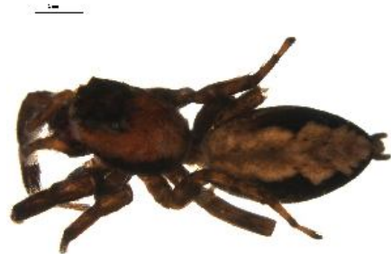
[Dorsal] Platycryptus undatus BIN URI: BOLD:AAD1010