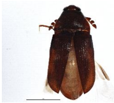
[Dorsal] Trixagus carinicollis BIN URI: BOLD:AA6148