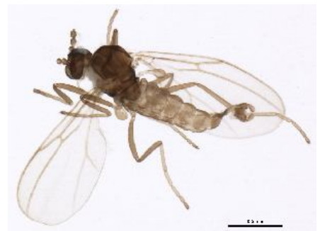
[Lateral] Cecidomyiidae BIN URI: BOLD:ABA1223