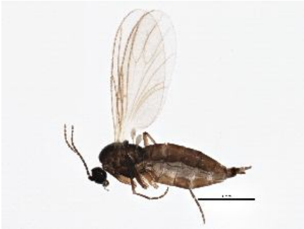
[Lateral] Lycoriella castanescens BIN URI: BOLD: ABA1215