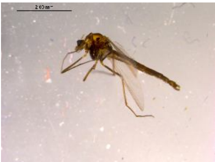
[Lateral] Heterotrissocladus BIN URI: BOLD:AA5369