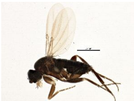
[Lateral] Phoridae BIN URI: BOLD:ABU5529