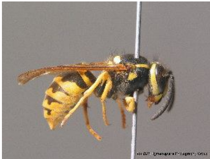
[Lateral] Vespula germanica BIN URI: BOLD:AAG9055