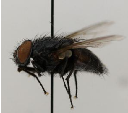
[Lateral] Muscina pasuorum BIN URI: BOLD:AAG1714