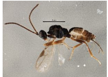
[Lateral] Blacus stelfoxi BIN URI: BOLD:AAZ9744