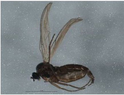
[Lateral] Scatopsiara BIN URI: BOLD: AAN6431