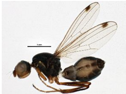
[Lateral] Sepsis punctum BIN URI: BOLD: AAG5639