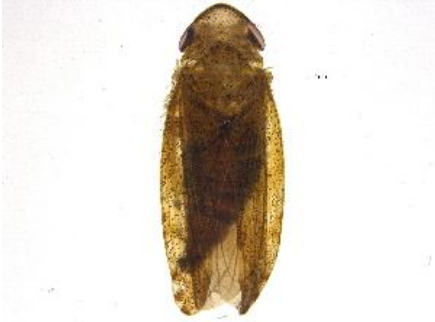
[Dorsal] Cicadellidae BIN URI: BOLD:ACJ7053