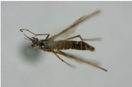
[Dorsal] Syvicola punctatus BIN URI: BOLD:AAL7534