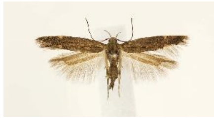
[Dorsal] Syncopacma BIN URI: BOLD:AAF9988