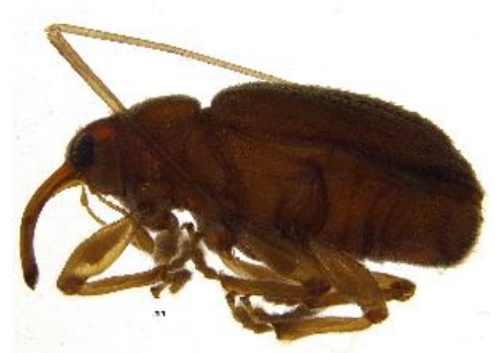
[Lateral] Curculionidae BIN URI: BOLD:ACJ7409