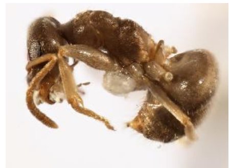
[Lateral] Lasius BIN URI: BOLD:AAB9126