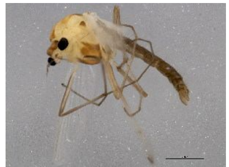
[Lateral] Chironomidae BIN URI: BOLD:AAM6246