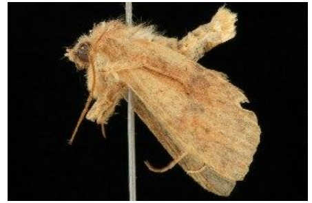
[Lateral] Sunira bicolorago BIN URI: BOLD:AAA4426