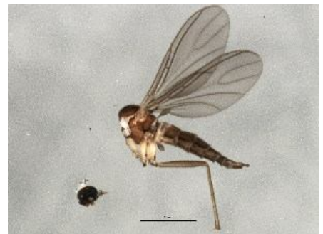
[Lateral] Diptera BIN URI: BOLD:AAM9255