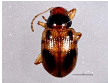
BIOUG05602-B04 [Dorsal] Paria fragariae