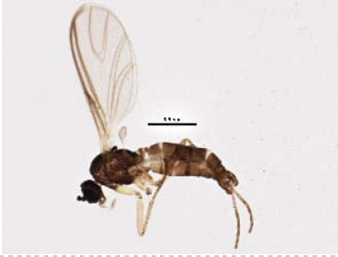
BIOUG05689-F03 [Lateral] Scatopsciara