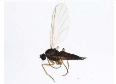
BIOUG05519-D06 [Lateral] Sciaridae