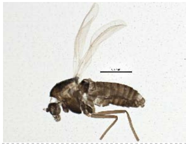
BIOUG05508-C09 [Lateral] Chironomidae