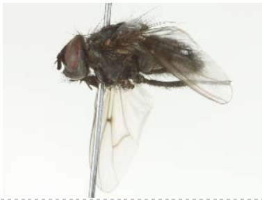
BIOUG05501-D10 [Lateral] Helina rufitibia