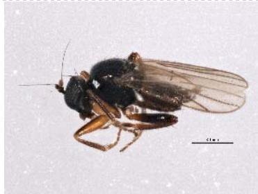
BIOUG05503-C11 [Lateral] Empididae