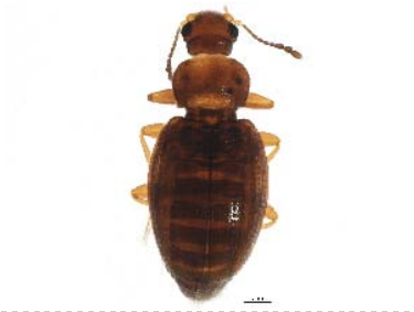
BIOUG05507-H02 [Dorsal] Latridiidae