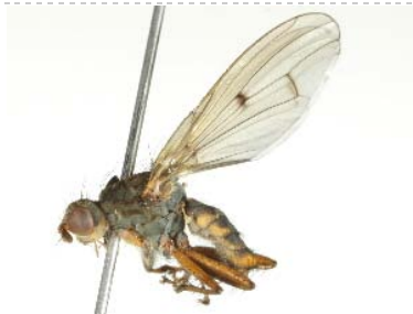
BIOUG05501-A03 [Lateral] Scathophaga furcata