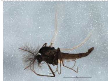
BIOUG05503-A03 [Lateral] Smittia