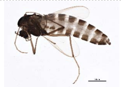
BIOUG05503-E10 [Lateral] Smittia