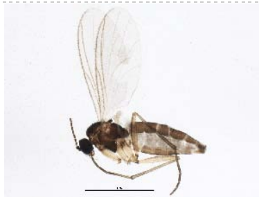
BIOUG05525-G01 [Lateral] Sciaridae