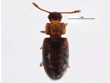
BIOUG05533-E12 [Dorsal] Cryptophilus obliteratus