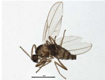
BIOUG05508-C04 [Lateral] Cecidomyiidae