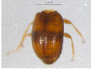
BIOUG05699-H01 [Dorsal] Latridiidae