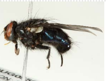
BIOUG05501-F08 [Lateral] Cynomya cadaverina