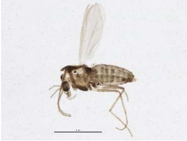
BIOUG05504-B10 [Lateral] Chironomidae