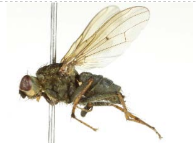
BIOUG05501-A07 [Lateral] Scathophaga stercoraria