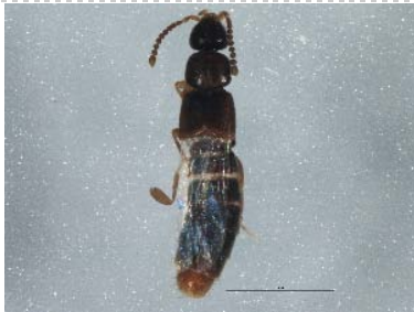
BIOUG05509-G11 [Dorsal] Staphylinidae