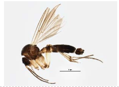
BIOUG05703-F06 [Lateral] Mycetophilidae