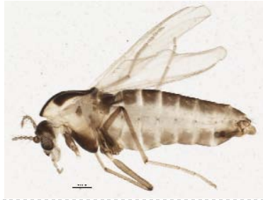
BIOUG05590-H11 [Lateral] Chironomidae