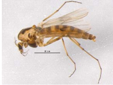
BIOUG05502-A10 [Lateral] Chironomus cf. decorus