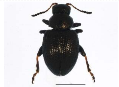
BIOUG05505-B07 [Dorsal] Chrysomelidae