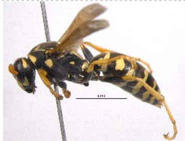
BIOUG05513-A01 [Lateral] Polistes dominula