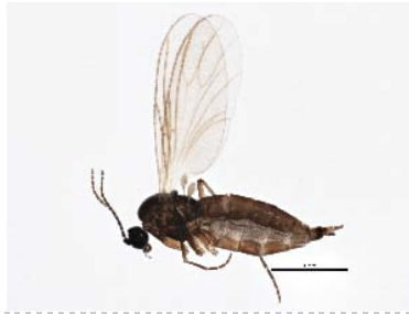
BIOUG05503-F04 [Lateral] Lycoriella castanescens