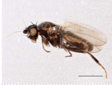
BIOUG05705-A12 [Lateral] Sphaeroceridae