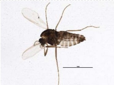
BIOUG05570-H09 [Lateral] Smittia edwardsi