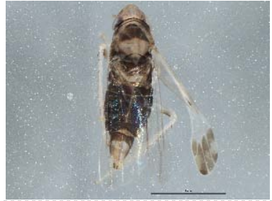
BIOUG05512-D01 [Dorsal] Erythroneura rubrella