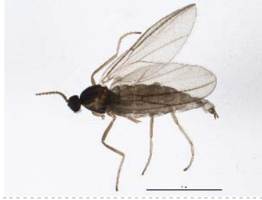
BIOUG05507-C10 [Lateral] Cecidomyiidae