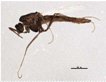
BIOUG05503-B05 [Lateral] Chironomidae