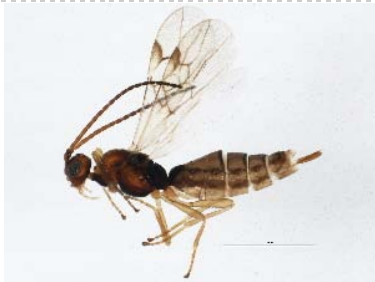
BIOUG05509-F12 [Lateral] Braconidae