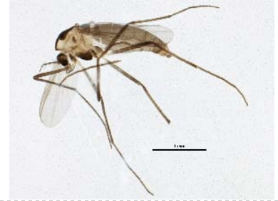
BIOUG05703-F07 [Lateral] Chironomidae