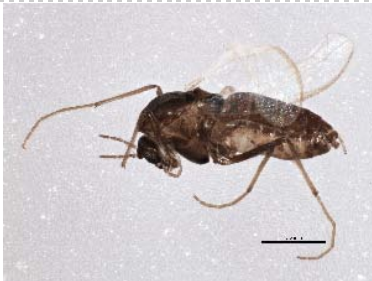
BIOUG05503-C01 [Lateral] Smittia