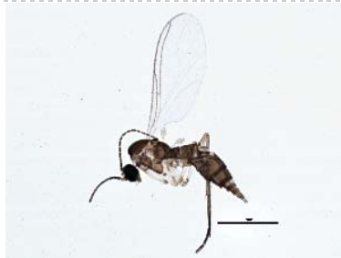
BIOUG05522-H01 [Lateral] Sciaridae