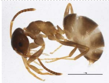
BIOUG05507-D08 [Lateral] Lasius neoniger