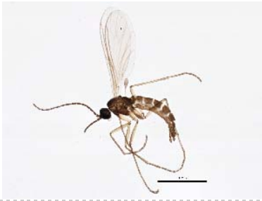
BIOUG05503-A10 [Lateral] Sciariidae