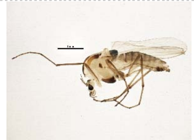
BIOUG05581-F11 [Lateral] Psectrocladius barbimanus