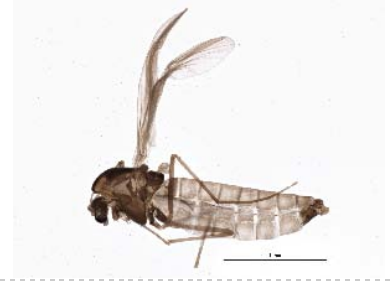
BIOUG05522-C03 [Lateral] Chironomidae