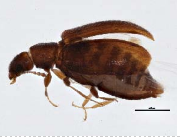
BIOUG05567-B12 [Lateral] Latridiidae