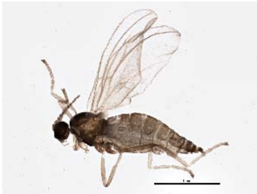
BIOUG05503-B09 [Lateral] Cecidomyiidae