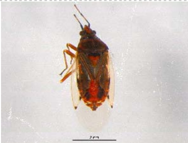
BIOUG05502-A09 [Dorsal] Kleidocerys