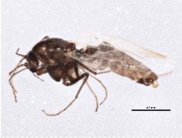
BIOUG05705-B05 [Lateral] Chironomidae