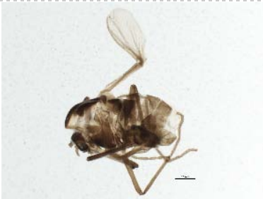
BIOUG05519-H08 [Lateral] Gymnometriocnemus brumalis