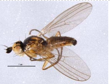
BIOUG05604-E05 [Lateral] Cerodontha dorsalis