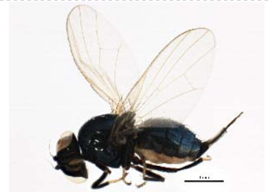
BIOUG05510-H10 [Lateral] Lonchaea