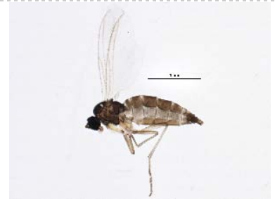
BIOUG05532-F06 [Lateral] Sciaridae