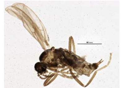
BIOUG05703-F05 [Lateral] Cecidomyiidae