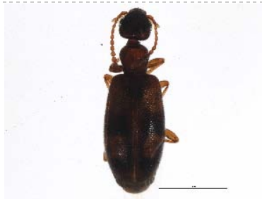
BIOUG05512-A02 [Dorsal] Anthicidae