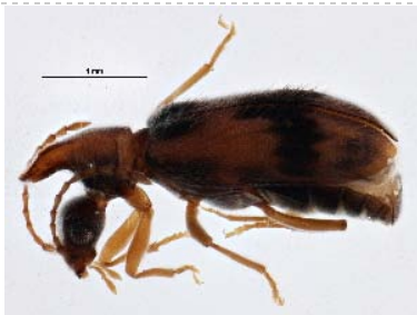
BIOUG05533-G12 [Lateral] Anthicidae