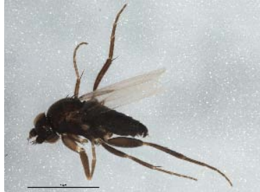
BIOUG05548-E10 [Lateral] Phoridae