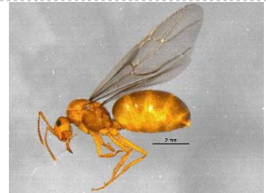
BIOUG05502-A07 [Lateral] Prenolepis imparis