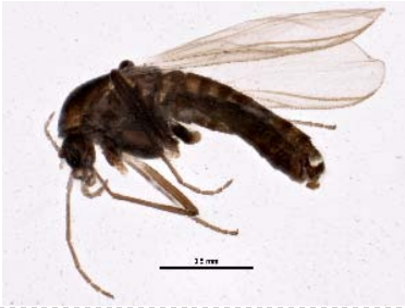
BIOUG05558-D08 [Lateral] Chironomidae