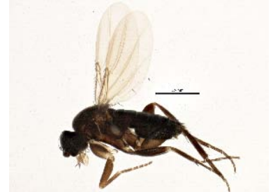
BIOUG05521-A04 [Lateral] Phoridae