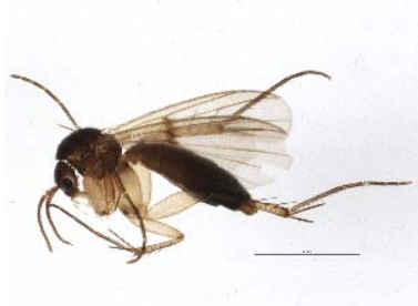
BIOUG05504-A05 [Lateral] Mycetophila