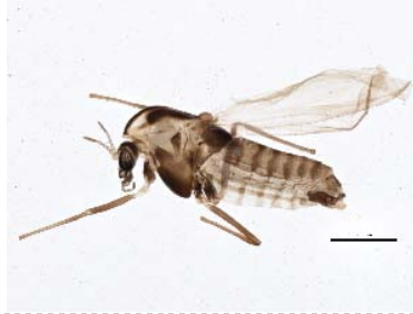
BIOUG05514-H06 [Lateral] Chironomidae