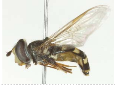
BIOUG05501-D08 [Lateral] Eupeodes americanus