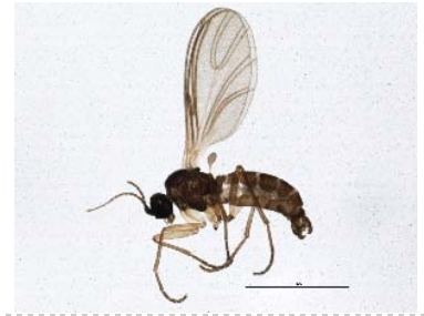
BIOUG05503-F12 [Lateral] Scatopsciara