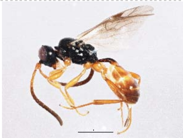
BIOUG05705-D06 [Lateral] Ichneumonidae