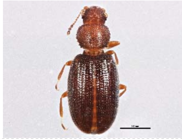
BIOUG05705-C11 [Dorsal] Corticaria serrata