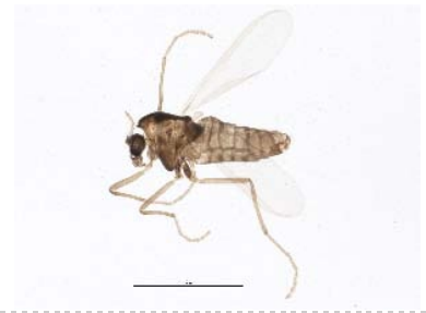
BIOUG05505-A07 [Lateral] Chironomidae