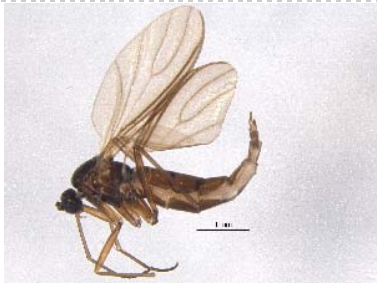
BIOUG05704-H10 [Lateral] Sciaridae