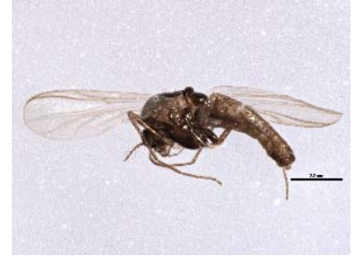
BIOUG05522-B11 [Lateral] Chironomus pseudothummi