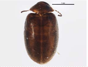
BIOUG05533-G01 [Dorsal] Scirtidae