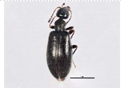
BIOUG05705-C08 [Dorsal] Anthicidae