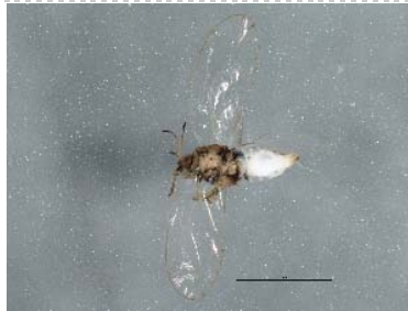
BIOUG05507-H03 [Lateral] Psyllidae