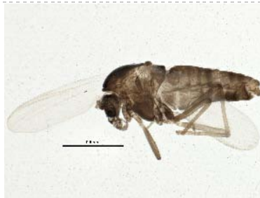
BIOUG05508-D08 [Lateral] Chironomidae