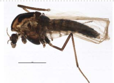
BIOUG05538-A03 [Lateral] Chironomidae