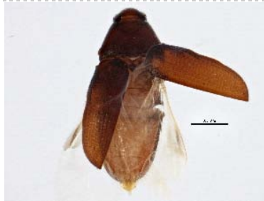
BIOUG05532-G09 [Dorsal] Trixagus