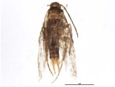
BIOUG05512-D10 [Dorsal] Elachista illectella