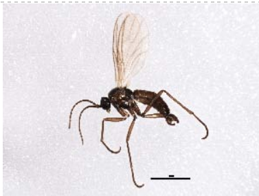
BIOUG05503-C12 [Lateral] Sciaridae