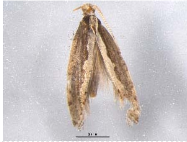
BIOUG05515-B06 [Dorsal] Plutella xylostella