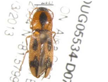
BIOUG05534-D07 [Dorsal] Aeolus