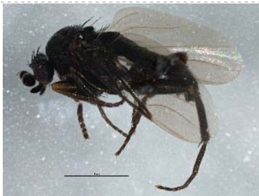
BIOUG05608-G10 [Lateral] Phoridae