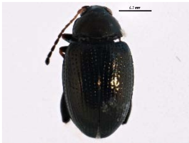
BIOUG05528-A10 [Dorsal] Chaetocnema concinna