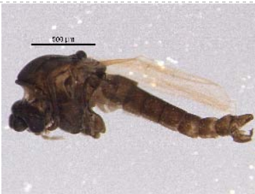
BIOUG05704-D06 [Lateral] Chironomidae