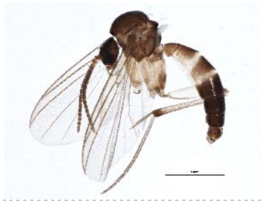
BIOUG05552-B12 [Lateral] Mycetophilidae