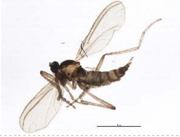
BIOUG05505-G10 [Lateral] Cecidomyiidae