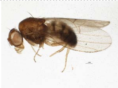
BIOUG05509-A02 [Lateral] Drosophila putrida