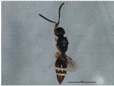
BIOUG05509-E08 [Dorsal] Megaspilidae