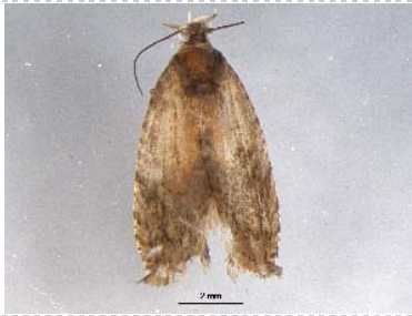
BIOUG05579-F01 [Dorsal] Pseudexentera spoliata