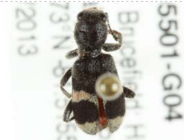
BIOUG05501-G04 [Dorsal] Enoclerus nigripes