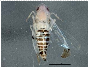
BIOUG05510-A11 [Dorsal] Erythroneura