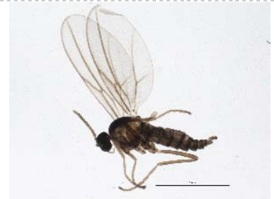
BIOUG05509-E05 [Lateral] Cecidomyiidae