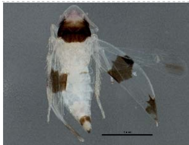
BIOUG05510-B02 [Dorsal] Erythroneura tricincta