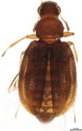
BIOUG05509-H09 [Dorsal] Latridiidae