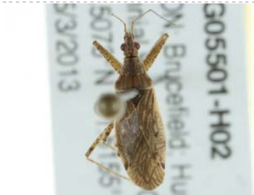
BIOUG05501-H02 [Dorsal] Nabis roseipennis