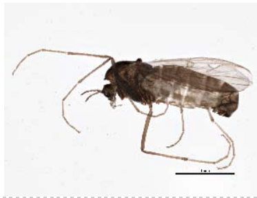
BIOUG05503-A08 [Lateral] Bryophaenocladius