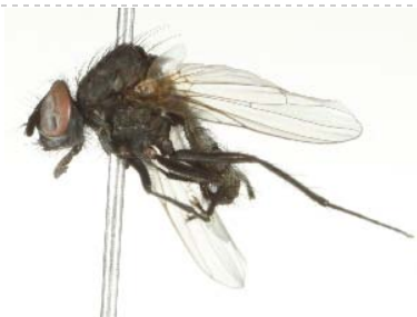
BIOUG05501-A01 [Lateral] Delia antiqua