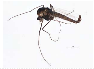
BIOUG05503-D04 [Lateral] Orthocladius dorenius