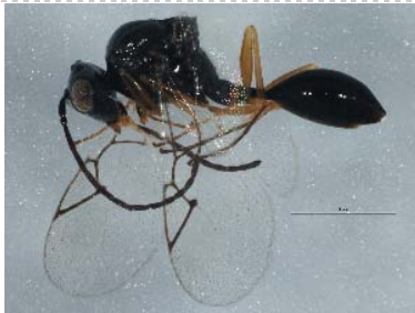
BIOUG05509-F10 [Lateral] Hymenoptera