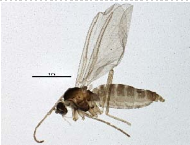
BIOUG05508-B01 [Lateral] Cecidomyiidae