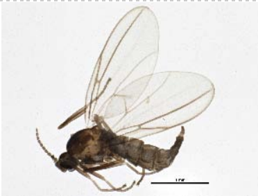
BIOUG05508-H03 [Lateral] Cecidomyiidae