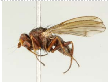
BIOUG05501-G01 [Lateral] Heleomyzidae