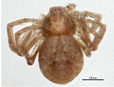
BIOUG05510-C02 [Dorsal] Philodromus cespitum