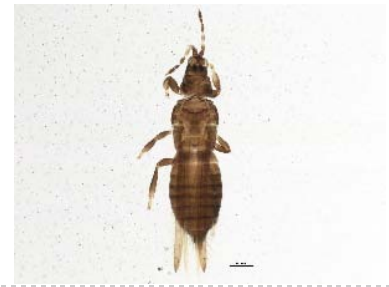
BIOUG05505-B11 [Dorsal] Taeniothrips inconsequens