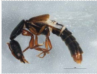
BIOUG05509-G08 [Lateral] Staphylinidae