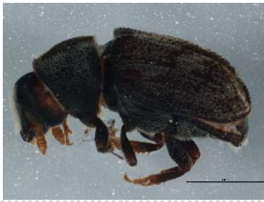
BIOUG05509-G06 [Lateral] Hylesinus aculeatus