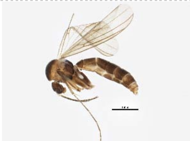
BIOUG05508-G04 [Lateral] Mycetophilidae