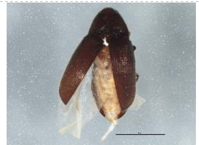
BIOUG05509-H05 [Dorsal] Throscidae