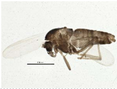
BIOUG05508-D08 [Lateral] Chironomidae