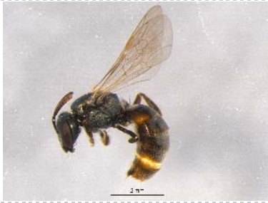
BIOUG05502-B10 [Lateral] Lasioglossum weemsi