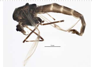
BIOUG05508-F06 [Lateral] Chironomidae