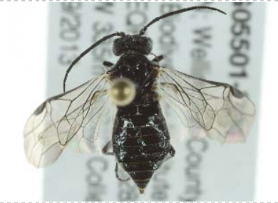
BIOUG05501-D04 [Dorsal] Dolerus