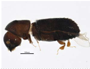
BIOUG05510-A03 [Lateral] Xyleborinus