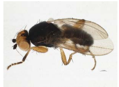
BIOUG05509-A03 [Lateral] Spelobia ochripes