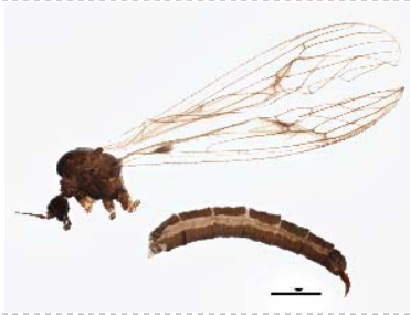
BIOUG05508-C07 [Lateral] Trichocera