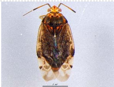
BIOUG05724-G09 [Dorsal] Lygus plagiatus