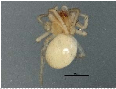
BIOUG05510-B10 [Dorsal] Neottiura bimaculata