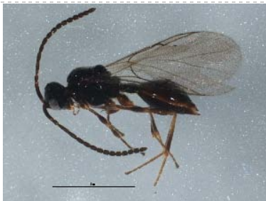
BIOUG05509-F09 [Lateral] Diapriidae