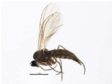
BIOUG05508-B05 [Lateral] Sciariidae