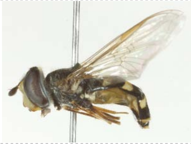
BIOUG05501-D08 [Lateral] Eupeodes americanus