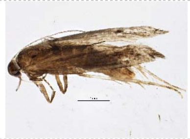
BIOUG05510-C06 [Lateral] Sinoe chambersi