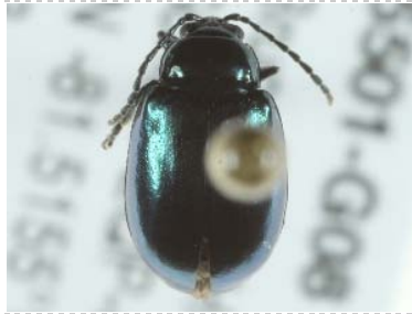
BIOUG05501-G08 [Dorsal] Altica chalybea