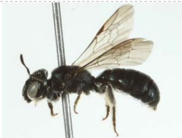
BIOUG05501-H04 [Lateral] Ceratina