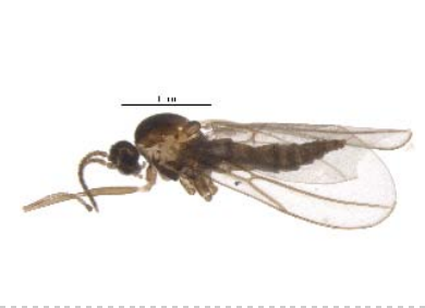
BIOUG05509-C02 [Lateral] Cecidomyiidae