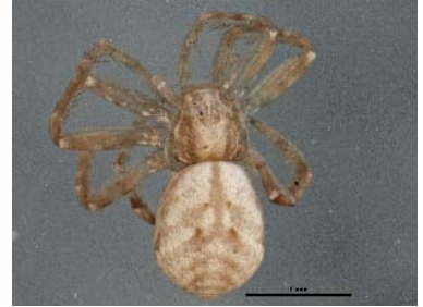
BIOUG05510-B11 [Dorsal] Philodromus marxi