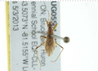
BIOUG05501-H01 [Dorsal] Nabis rufusculus