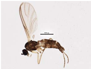
BIOUG05689-F03 [Lateral] Scatopsiara