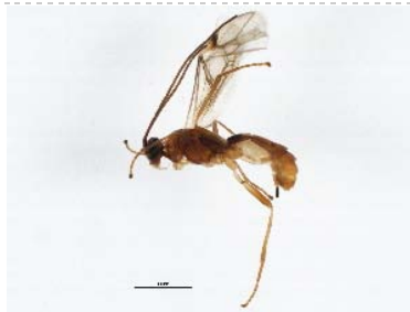
BIOUG05509-F06 [Lateral] Braconidae