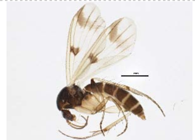
BIOUG05508-G12 [Lateral] Mycetophila