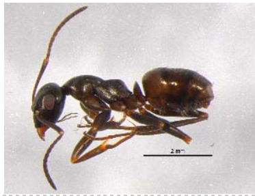
BIOUG05502-B08 [Lateral] Formica glacialis