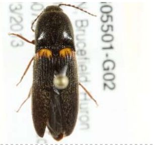
BIOUG05501-G02 [Dorsal] Ampedus protervus