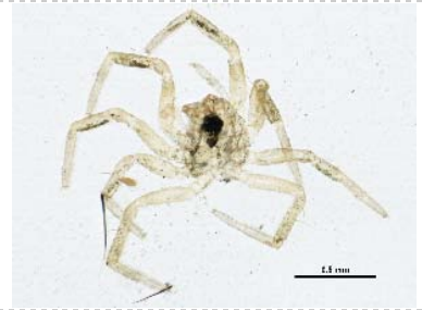
BIOUG05510-B12 [Dorsal] Pocadicnemis americana