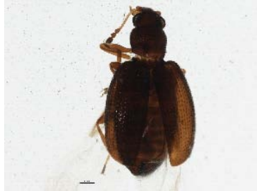
BIOUG05509-H08 [Dorsal] Cortinicara gibbosa