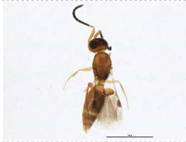
BIOUG05509-F02 [Dorsal] Megaspilidae