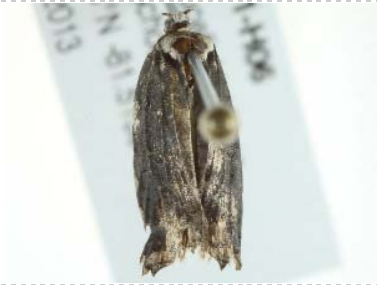
BIOUG05501-H06 [Dorsal] Acleris flavivittana