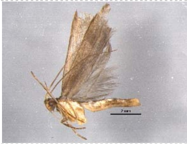
BIOUG05502-C10 [Lateral] Dichomeris ligulella