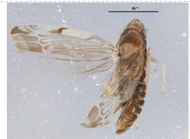
BIOUG05652-D09 [Dorsal] Erythroneura vulnerata