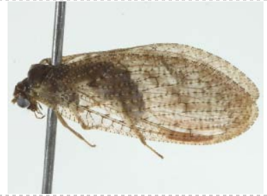
BIOUG05501-H05 [Lateral] Hemerobius