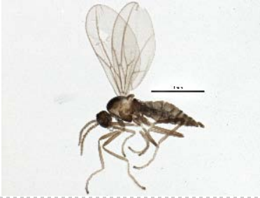
BIOUG05508-C08 [Lateral] Cecidomyiidae