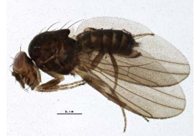
BIOUG05508-A10 [Lateral] Drosophilidae