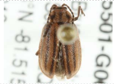
BIOUG05501-G06 [Dorsal] Ophraella