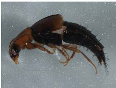
BIOUG05509-G10 [Lateral] Tachyporus chrysomelinus