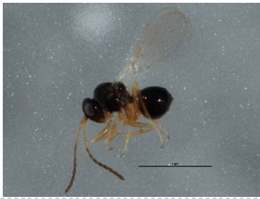
BIOUG05509-F05 [Lateral] Figitidae