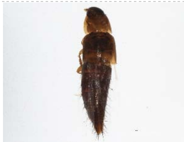
BIOUG05509-G12 [Dorsal] Tachyporus nitidulus