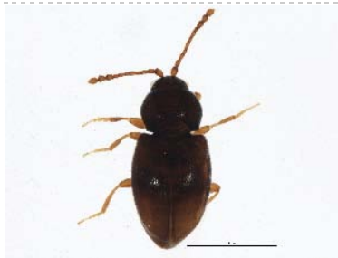
BIOUG05509-H02 [Dorsal] Atomaria