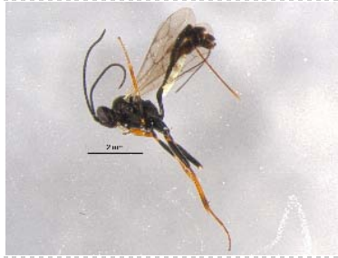
BIOUG05502-B11 [Lateral] Ichneumonidae