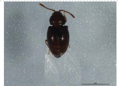
BIOUG05509-G09 [Dorsal] Atomaria