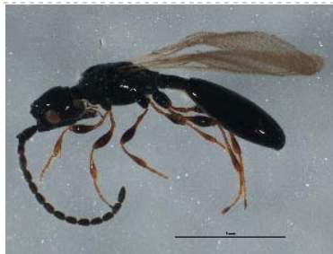
BIOUG05509-E07 [Lateral] Diapriidae