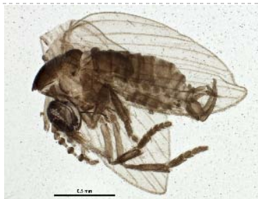
BIOUG05508-B03 [Lateral] Psychodidae