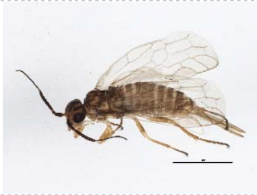
BIOUG05509-F11 [Lateral] Xyelidae