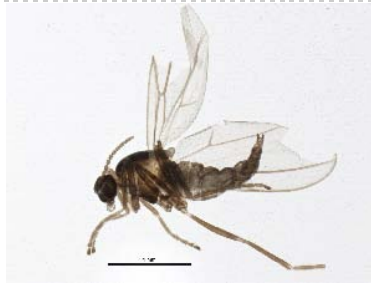
BIOUG05508-D12 [Lateral] Cecidomyiidae