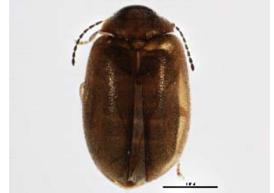
BIOUG05510-A05 [Dorsal] Cyphon laevipennis