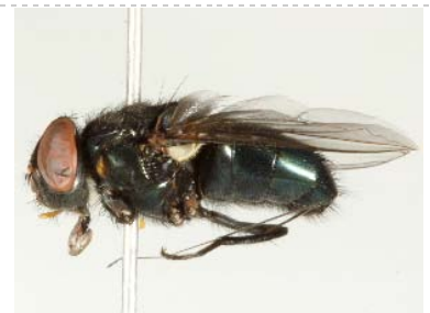
BIOUG05501-F09 [Lateral] Phormia regina