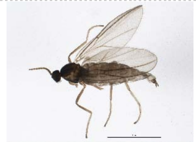
BIOUG05507-C10 [Lateral] Cecidomyiidae