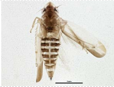
BIOUG05510-B01 [Dorsal] Arboridia