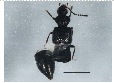
BIOUG05509-H04 [Dorsal] Carpelimus