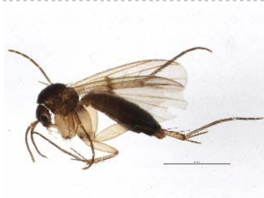
BIOUG05504-A05 [Lateral] Mycetophila