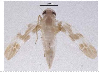
BIOUG05652-B05 [Dorsal] Empoasca