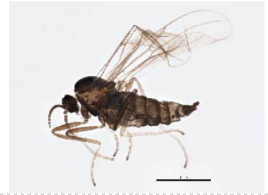
BIOUG05503-B03 [Lateral] Cecidomyiidae