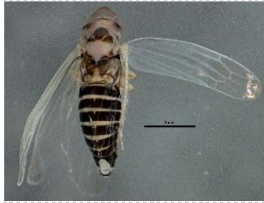
BIOUG05510-B04 [Dorsal] Dikraneura