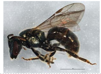
BIOUG05661-F06 [Lateral] Lasioglossum