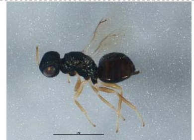
BIOUG05509-F08 [Lateral] Hymenoptera