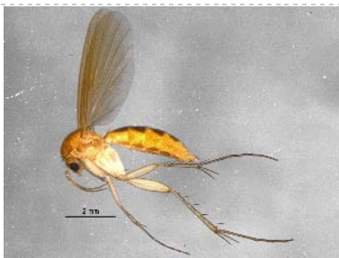
BIOUG05502-C04 [Lateral] Mycetophila fungorum