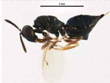
BIOUG05581-E09 [Lateral] Hymenoptera