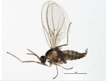
BIOUG05508-G03 [Lateral] Cecidomyiidae