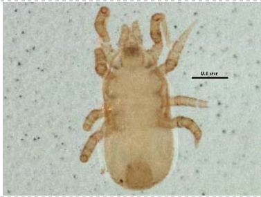
BIOUG05508-A07 [Dorsal] Ascidae