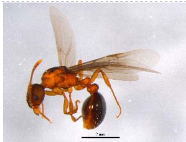
BIOUG05511-F03 [Lateral] Myrmica