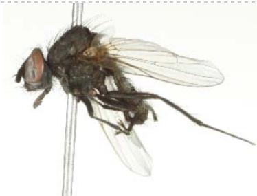
BIOUG05501-A01 [Lateral] Delia antiqua