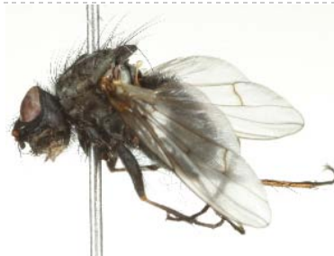
BIOUG05501-A02 [Lateral] Hylemya