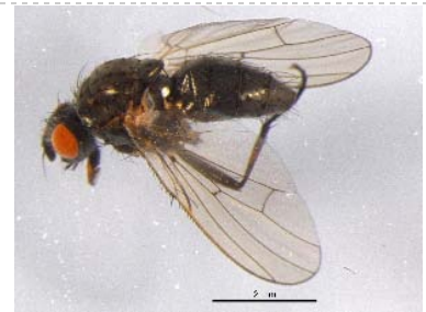
BIOUG05502-H06 [Lateral] Hylemya