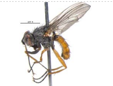
BIOUG05530-H07 [Lateral] Pegomya solennis