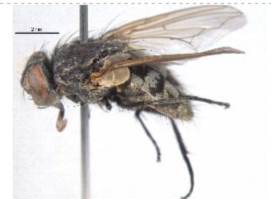
BIOUG05501-D07 [Lateral] Pollenia pediculata