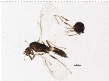
BIOUG05570-E09 [Lateral] Hymenoptera