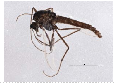
BIOUG05503-H02 [Lateral] Chironomidae