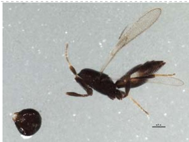
BIOUG05555-C01 [Lateral] Platygasteridae