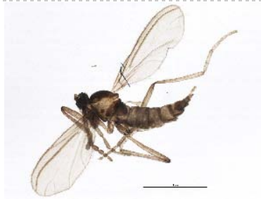
BIOUG05505-G10 [Lateral] Cecidomyiidae