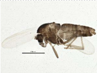
BIOUG05508-D08 [Lateral] Chironomidae