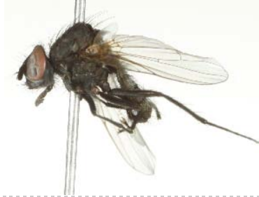
BIOUG05501-A01 [Lateral] Delia antiqua