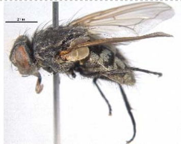
BIOUG05501-D07 [Lateral] Pollenia pediculata