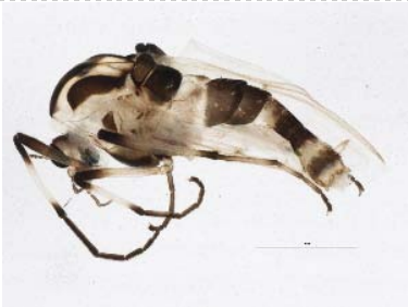
BIOUG05504-B05 [Lateral] Cricotopus sylvestris