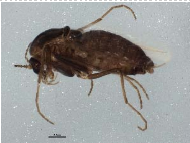
BIOUG05507-H05 [Lateral] Chironomidae