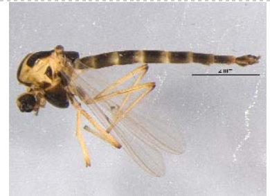
BIOUG05515-E11 [Lateral] Chironomus riparius