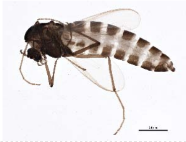
BIOUG05503-E10 [Lateral] Smittia