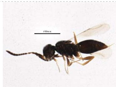
BIOUG05605-E03 [Lateral] Megaspilidae