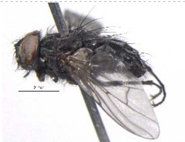
BIOUG05530-B03 [Lateral] Phaonia