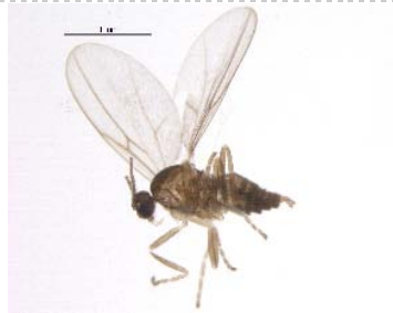
BIOUG05605-D01 [Lateral] Cecidomyiidae