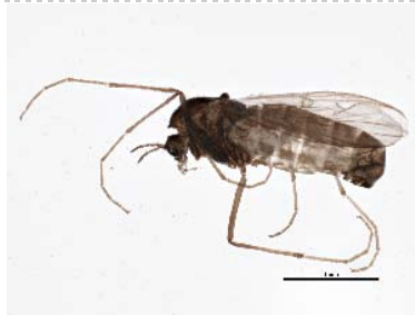
BIOUG05503-A08 [Lateral] Bryophaenocladus