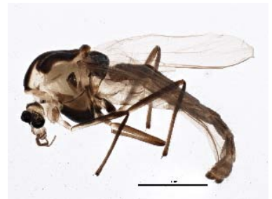
BIOUG05516-G04 [Lateral] Psectrocladius cf. limbatellus