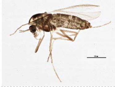
BIOUG05503-A11 [Lateral] Chironomidae