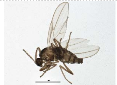
BIOUG05508-C04 [Lateral] Cecidomyiidae