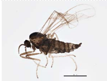
BIOUG05503-B03 [Lateral] Cecidomyiidae