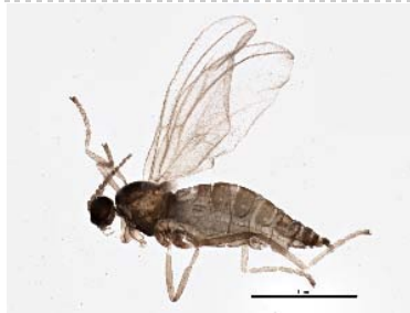
BIOUG05503-B09 [Lateral] Cecidomyiidae