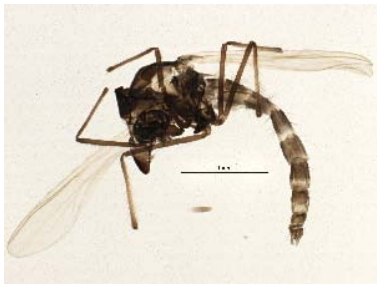
BIOUG05543-E09 [Lateral] Microtendipes pedellus grp.