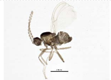
BIOUG05508-C06 [Lateral] Cecidomyiidae