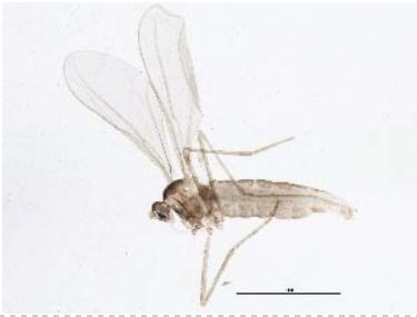
BIOUG05512-H03 [Lateral] Cecidomyiidae