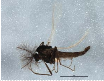
BIOUG05503-A03 [Lateral] Smittia