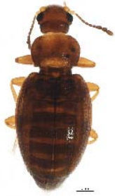
BIOUG05507-H02 [Dorsal] Latridiidae