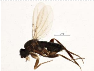
BIOUG05521-A04 [Lateral] Phoridae