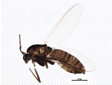
BIOUG05503-E12 [Lateral] Smittia