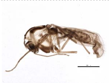
BIOUG05514-B04 [Lateral] Chironomidae