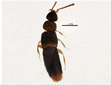
BIOUG05569-C12 [Dorsal] Atheta hansseni