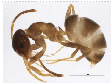
BIOUG05507-D08 [Lateral] Lasius neoniger