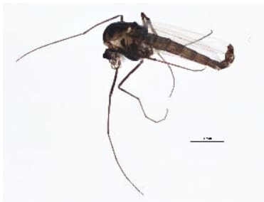
BIOUG05503-D04 [Lateral] Orthocladius dorenius