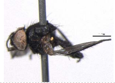
BIOUG05527-G04 [Lateral] Lasiomma