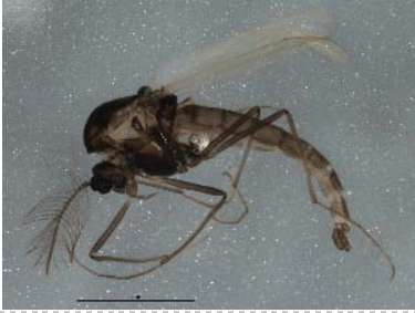
BIOUG05505-F01 [Lateral] Chironomidae