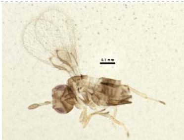
BIOUG05569-E03 [Lateral] Trichogramma platneri