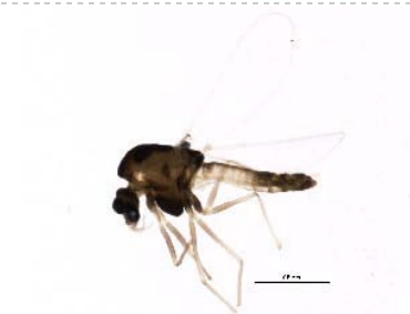
BIOUG05502-G10 [Lateral] Thienemanniella xena