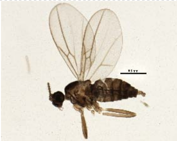
BIOUG05543-F11 [Lateral] Cecidomyiidae