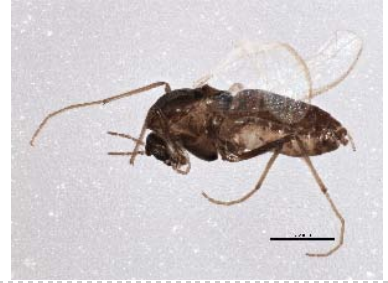
BIOUG05503-C01 [Lateral] Smittia