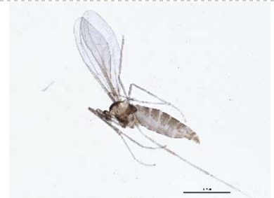
BIOUG05542-B01 [Lateral] Cecidomyiidae