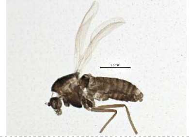
BIOUG05508-C09 [Lateral] Chironomidae