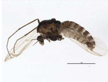
BIOUG05512-E08 [Lateral] Cricotopus tremulus