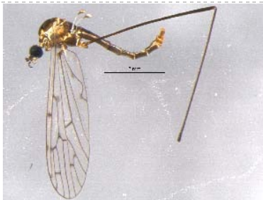
BIOUG05502-D11 [Lateral] Symplecta