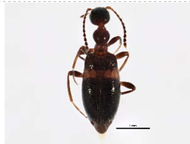
BIOUG05529-G04 [Dorsal] Anthicidae