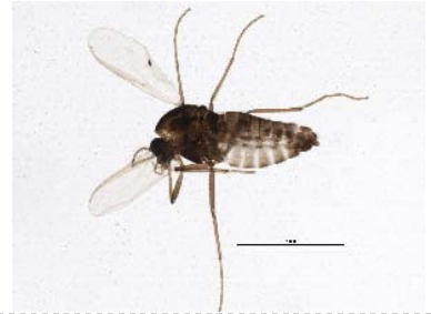
BIOUG05570-H09 [Lateral] Smittia edwardsi