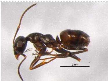
BIOUG05502-B08 [Lateral] Formica glacialis