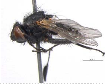
BIOUG05523-E08 [Lateral] Anthomyiidae