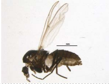
BIOUG05538-D12 [Lateral] Rheocricotopus robacki