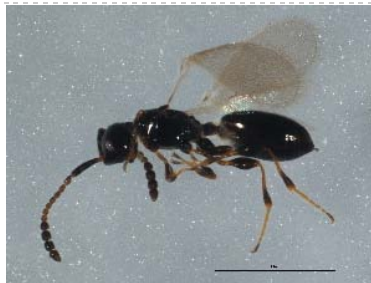
BIOUG05507-D11 [Lateral] Diapriidae