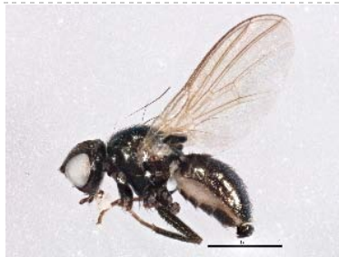
BIOUG05645-H02 [Lateral] Agromyzidae