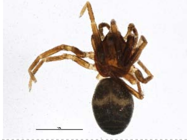
BIOUG05609-E08 [Dorsal] Scotinella madisonia