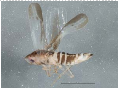
BIOUG05512-C12 [Lateral] Arboridia