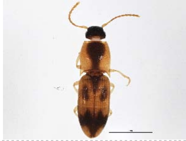
BIOUG05661-H05 [Dorsal] Aeolus