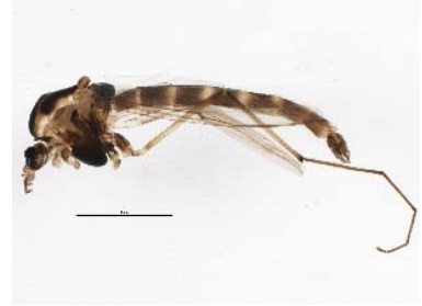
BIOUG05563-D08 [Lateral] Chironomus acidophilus