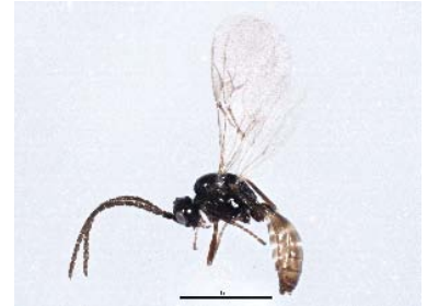
BIOUG05542-G12 [Lateral] Aphidius rhopalosiphi