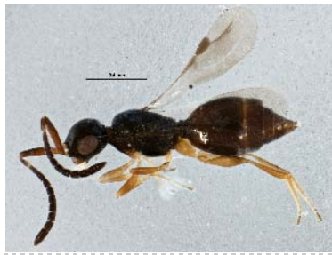
BIOUG05533-C06 [Lateral] Megaspilidae