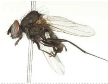
BIOUG05501-A01 [Lateral] Delia antiqua