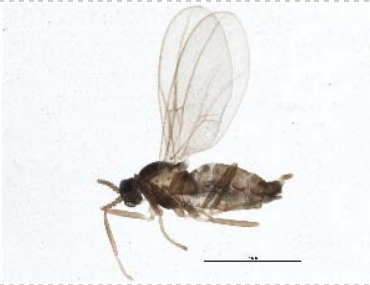
BIOUG05512-H02 [Lateral] Cecidomyiidae