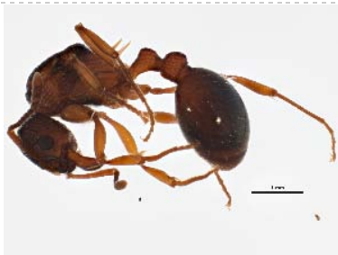
BIOUG05529-H01 [Lateral] Myrmica americana