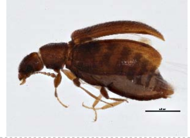
BIOUG05567-B12 [Lateral] Latridiidae