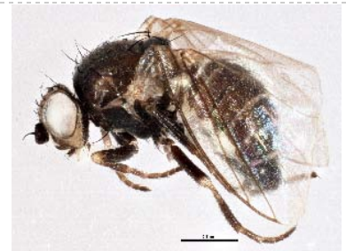
BIOUG05675-H10 [Lateral] Phytomyza solidaginophaga