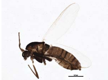
BIOUG05503-E12 [Lateral] Smittia