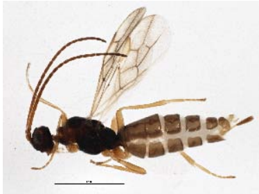
BIOUG05661-F08 [Lateral] Braconidae