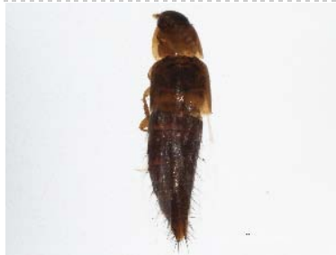
BIOUG05509-G12 [Dorsal] Tachyporus nitidulus