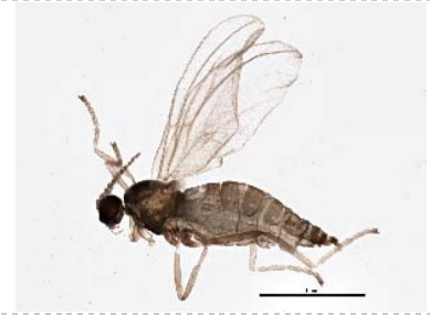
BIOUG05503-B09 [Lateral] Cecidomyiidae