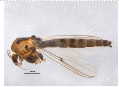
BIOUG05515-C08 [Lateral] Chironomidae