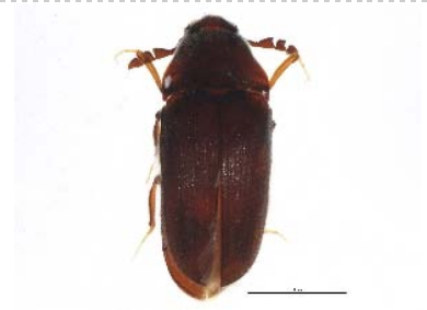
BIOUG05507-E08 [Dorsal] Trixagus carinicollis