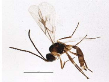
BIOUG05661-F07 [Lateral] Aphidius funebris