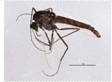
BIOUG05503-H02 [Lateral] Chironomidae