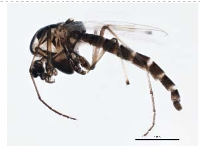
BIOUG05522-E10 [Lateral] Chironomidae