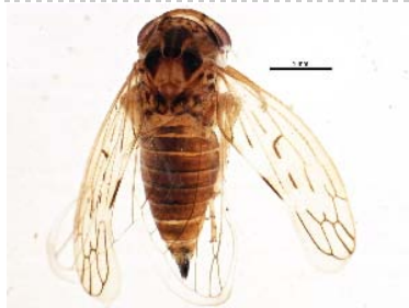
BIOUG05539-F03 [Dorsal] Idiocerus