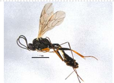
BIOUG05556-D01 [Lateral] Ichneumonidae