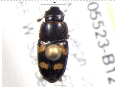
BIOUG05523-B12 [Dorsal] Glioschrochilus quadrisignatus