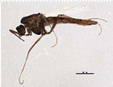
BIOUG05503-B05 [Lateral] Chironomidae