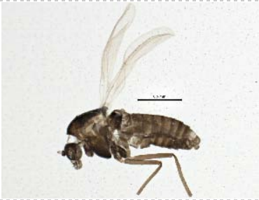
BIOUG05508-C09 [Lateral] Chironomidae