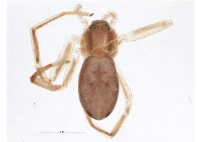
BIOUG05536-E07 [Dorsal] Philodromus rufus vibrans