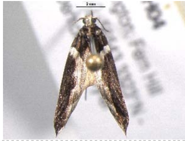
BIOUG05549-H04 [Dorsal] Telphusa longifasciella