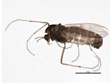
BIOUG05503-A08 [Lateral] Bryophaenocladus