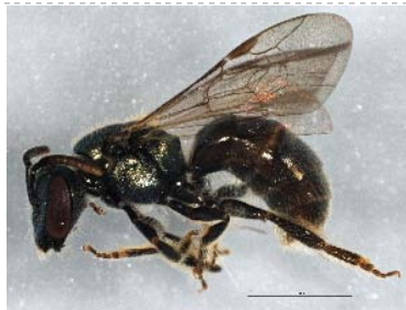
BIOUG05661-F06 [Lateral] Lasioglossum