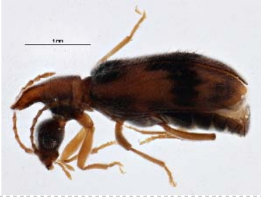
BIOUG05533-G12 [Lateral] Anthicidae