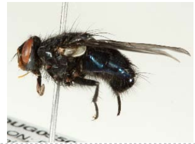
BIOUG05501-F08 [Lateral] Cynomya cadaverina