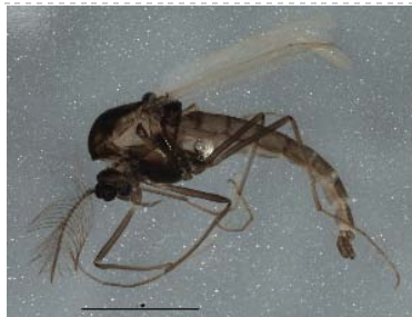
BIOUG05505-F01 [Lateral] Chironomidae