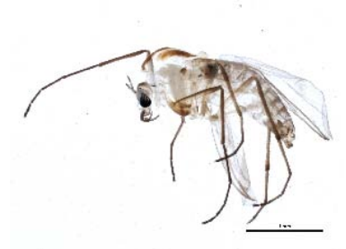
BIOUG05546-A02 [Lateral] Psectrocladius