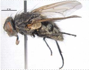
BIOUG05501-D07 [Lateral] Pollenia pediculata