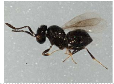
BIOUG05661-H01 [Lateral] Platygasteridae