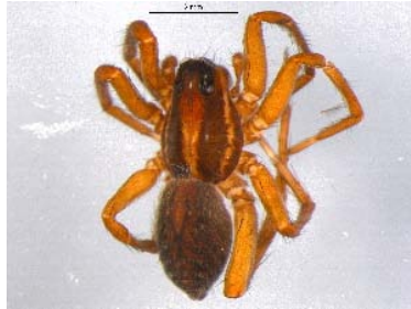
BIOUG05662-C01 [Dorsal] Schizocosa crassipalpa