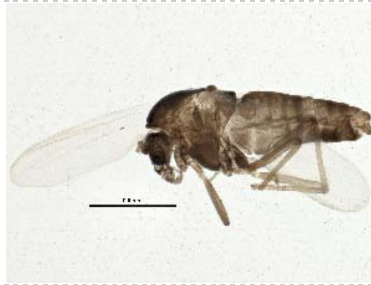
BIOUG05508-D08 [Lateral] Chironomidae