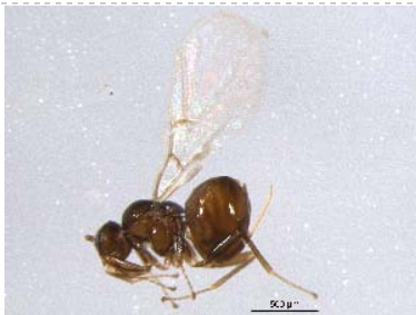
BIOUG05612-E06 [Lateral] Cynipidae