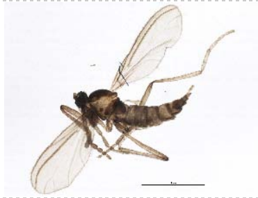
BIOUG05505-G10 [Lateral] Cecidomyiidae