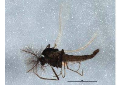
BIOUG05503-A03 [Lateral] Smittia