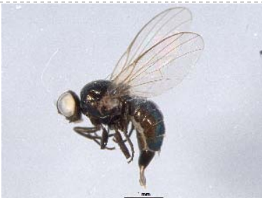
BIOUG05666-C03 [Lateral] Agromyzidae