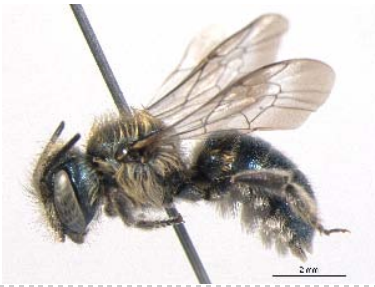
BIOUG05607-C07 [Lateral] Osmia conjuncta