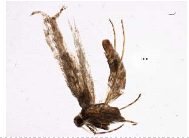
BIOUG05528-B12 [Lateral] Parectopa albicostella