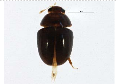
BIOUG05600-F04 [Dorsal] Phalacridae