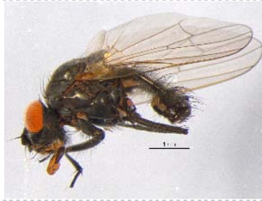
BIOUG05502-H03 [Lateral] Pollenia vagabunda