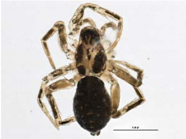
BIOUG05510-C01 [Dorsal] Piratulla minuta