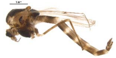
BIOUG05576-H06 [Lateral] Chironomidae