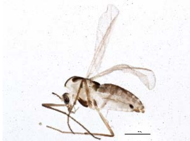
BIOUG05514-D06 [Lateral] Paraphaenocladus impensus