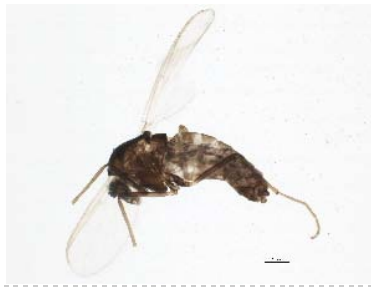
BIOUG05519-A08 [Lateral] Chironomidae