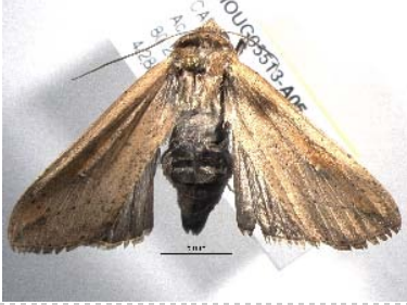
BIOUG05513-A05 [Dorsal] Mythimna unipuncta