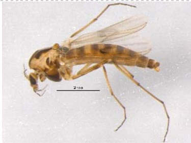
BIOUG05502-A10 [Lateral] Chironomus cf. decorus