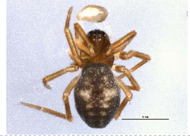
BIOUG05545-F10 [Lateral] Grammonota angusta