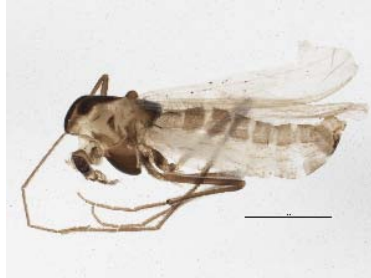
BIOUG05572-F06 [Lateral] Paratanytarsus