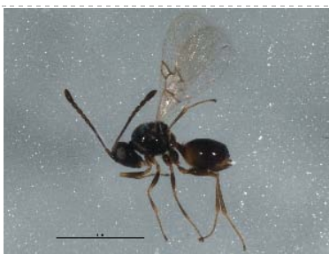
BIOUG05525-B03 [Lateral] Figitidae