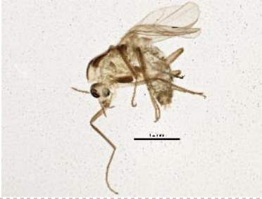
BIOUG05568-B07 [Lateral] Chironomidae