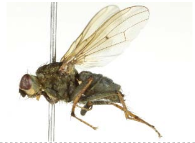
BIOUG05501-A07 [Lateral] Scathophaga stercoraria