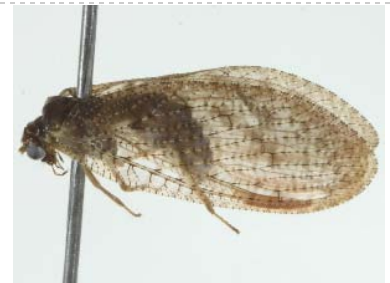
BIOUG05501-H05 [Lateral] Hemerobius