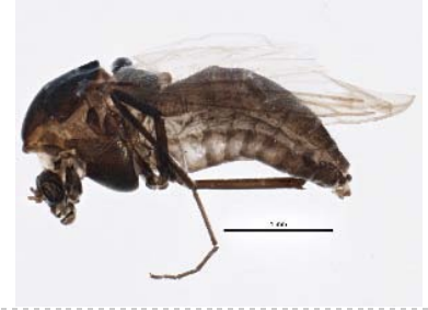
BIOUG05532-F02 [Lateral] Chironomidae