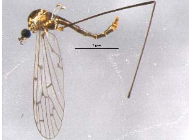
BIOUG05502-D11 [Lateral] Symplecta