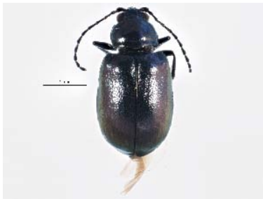
BIOUG05533-H02 [Dorsal] Altica corni