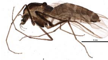
BIOUG05503-A06 [Lateral] Chironomidae