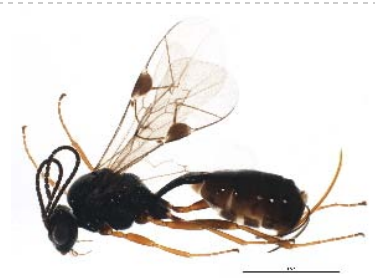
BIOUG05505-B08 [Lateral] Tersilochinae