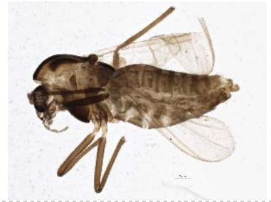
BIOUG05557-E06 [Lateral] Gymnometrioctenemus