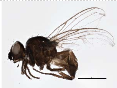
BIOUG05567-G12 [Lateral] Egle