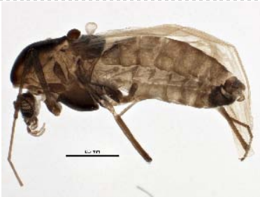
BIOUG05521-F01 [Lateral] Chironomidae