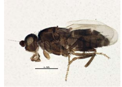
BIOUG05568-H01 [Lateral] Sphaeroceridae