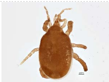
BIOUG05566-E12 [Dorsal] Macrochelidae