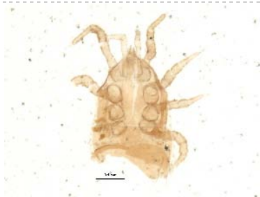
BIOUG05525-F07 [Dorsal] Ascidae