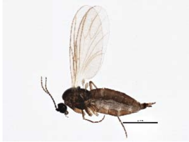
BIOUG05503-F04 [Lateral] Lycoriella castanescens