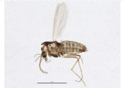
BIOUG05504-B10 [Lateral] Chironomidae