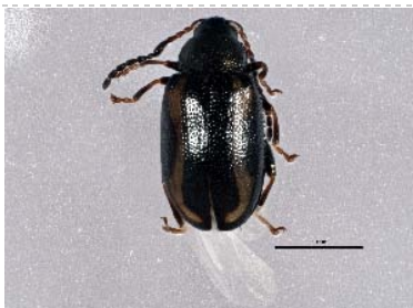
BIOUG05567-A10 [Dorsal] Chrysomelidae