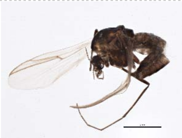
BIOUG05522-C05 [Lateral] Chironomidae