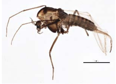
BIOUG05517-F03 [Lateral] Orthocladius oliveri