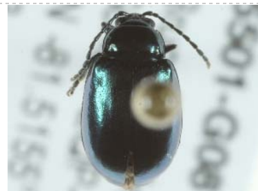
BIOUG05501-G08 [Dorsal] Altica chalybea