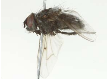
BIOUG05501-D10 [Lateral] Helina rufitibia