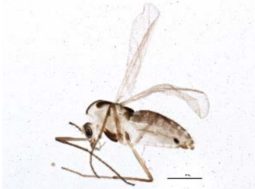
BIOUG05514-D06 [Lateral] Paraphaenocladus impensus