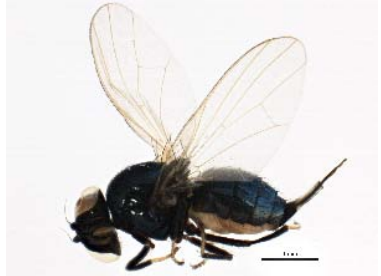
BIOUG05510-H10 [Lateral] Lonchaea