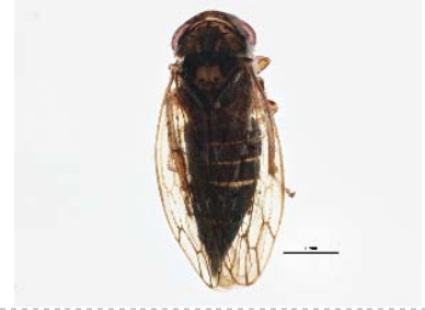
BIOUG05567-C07 [Lateral] Idiocerus setaceus