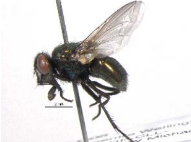
BIOUG05565-D05 [Lateral] Muscidae