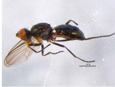
BIOUG05515-G09 [Lateral] Themira nigricornis