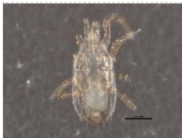
BIOUG05566-E05 [Dorsal] Melicharidae