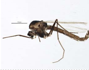
BIOUG05506-C04 [Lateral] Chironomidae