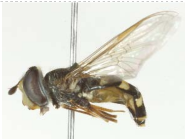
BIOUG05501-D08 [Lateral] Eupeodes americanus