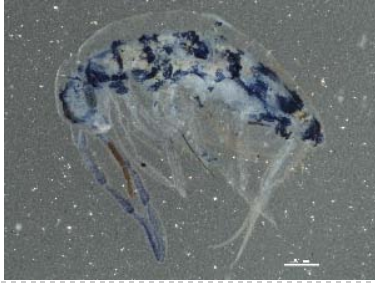
BIOUG05595-D07 [Lateral] Lepidosira