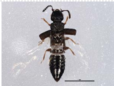
BIOUG05516-B10 [Dorsal] Anotylus tetracarınatus