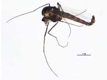
BIOUG05503-D04 [Lateral] Orthocladius doreus