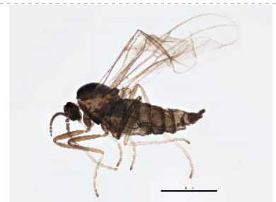
BIOUG05503-B03 [Lateral] Cecidomyiidae