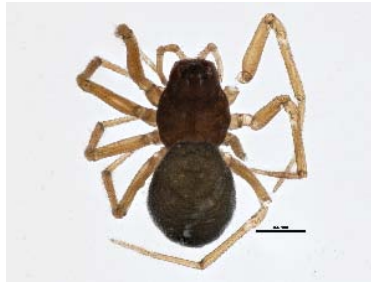
BIOUG05567-D11 [Lateral] Erigone atra