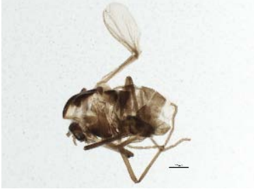
BIOUG05519-H08 [Lateral] Gymnometrioctenemus brumalis