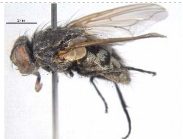
BIOUG05501-D07 [Lateral] Pollenia pediculata