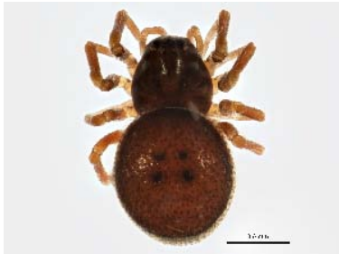
BIOUG05554-D03 [Dorsal] Ceratinella brunnea