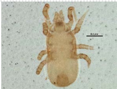
BIOUG05508-A07 [Dorsal] Ascidae