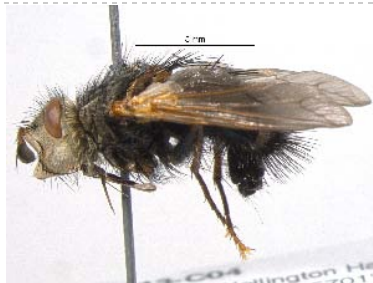
BIOUG05513-C04 [Lateral] Epalpus signifier