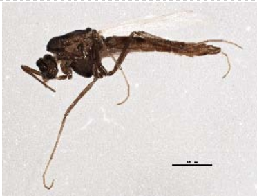
BIOUG05503-B05 [Lateral] Chironomidae