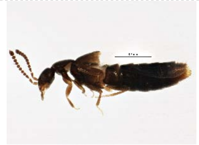
BIOUG05551-C02 [Lateral] Amischa analis