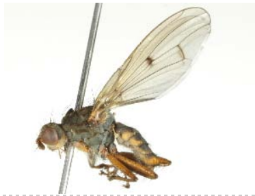
BIOUG05501-A03 [Lateral] Scathophaga furcata