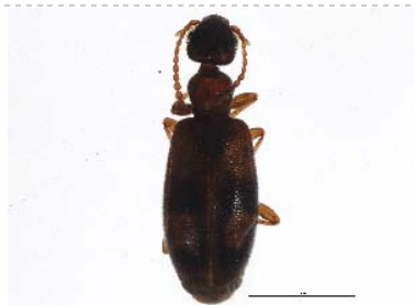
BIOUG05512-A02 [Dorsal] Anthicidae