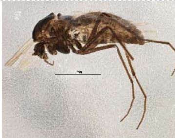
BIOUG05529-E12 [Lateral] Chironomidae