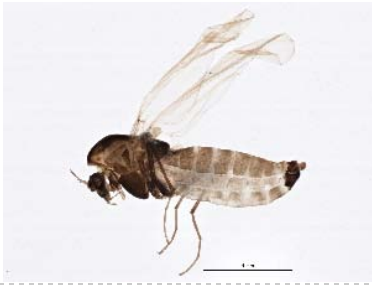
BIOUG05503-B06 [Lateral] Chironomidae