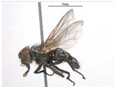
BIOUG05518-B06 [Lateral] Pollenia rudis