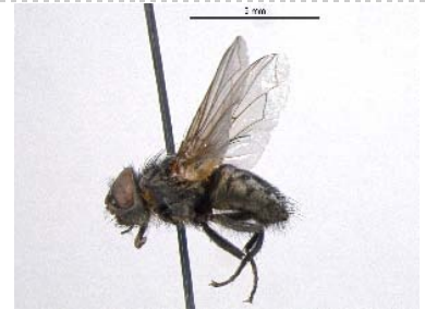
BIOUG05518-B12 [Lateral] Pollenia angustigena