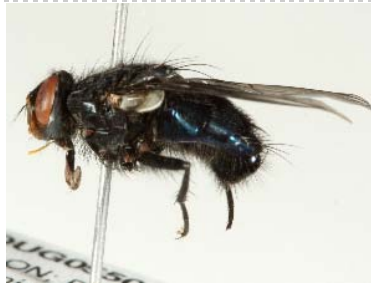
BIOUG05501-F08 [Lateral] Cynomya cadaverina