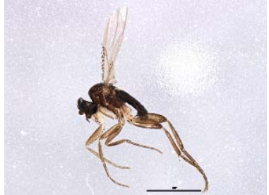
BIOUG05514-G10 [Lateral] Megaselia