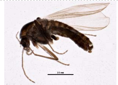
BIOUG05558-D08 [Lateral] Chironomidae