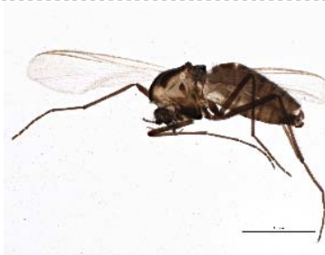
BIOUG05514-B07 [Lateral] Chironomidae