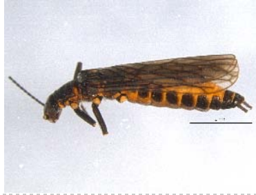
BIOUG05564-B10 [Lateral] Allocapnia nivicola