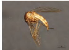
[Lateral] Aedes vexans BIN URI: BOLD:AAA7067