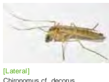
[Lateral] Chironomus cf. decorus BIN URI: BOLD:AAB7030