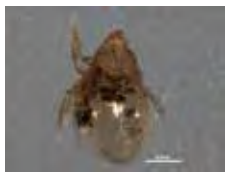
[Dorsal] Oribatulidae BIN URI: BOLD:ACP8854