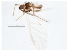
[Lateral] Rhopalomyzus BIN URI: BOLD:ACA4534