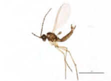
[Lateral] Sciaridae BIN URI: BOLD:AAN6447