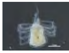
[Dorsal] Anystidae BIN URI: BOLD:ACM0934