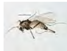
[Lateral] Chironomidae BIN URI: BOLD:AAP5921