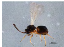
[Lateral] Cynipidae BIN URI: BOLD:ACP9016