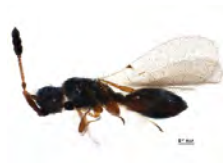
[Lateral] Diapriidae BIN URI: BOLD:ACP9218