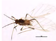
[Dorsal] Hyperomyzus BIN URI: BOLD:AAV6754