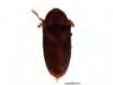
[Dorsal] Trixagus BIN URI: BOLD:AAU6966