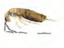
[Lateral] Entomobrya unostriata BIN URI: BOLD:AAH6630