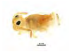
[Lateral] Collembola BIN URI: BOLD:ACC0359