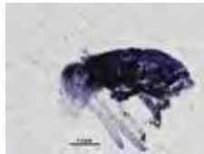
[Lateral] Entomobryomorpha BIN URI: BOLD:ACF9315