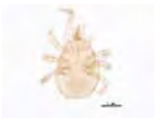
[Dorsal] Phytoseiidae BIN URI: BOLD:ACP8142