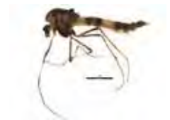
[Lateral] Chironomidae BIN URI: BOLD:AAG1004