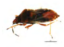
[Lateral] Hemiptera BIN URI: BOLD:ABY8347