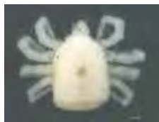
[Dorsal] Anystidae BIN URI: BOLD:AAM7961