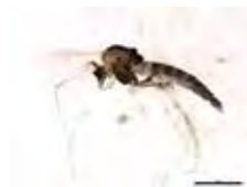
[Lateral] Cricotopus BIN URI: BOLD:AAN5318