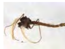
[Lateral] Chironomidae BIN URI: BOLD:ACC4669