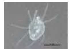
[Dorsal] Tetranychidae BIN URI: BOLD:ACP9194