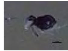
[Lateral] Sminthurinus BIN URI: BOLD:ACH6717