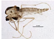
[Lateral] Chironomidae BIN URI: BOLD:ACF8490