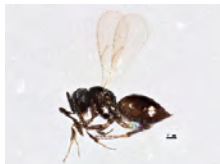
[Lateral] Platygasteridae BIN URI: BOLD:AAU8457