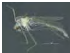
[Lateral] Tanytarsus guerlus BIN URI: BOLD:AAC4525