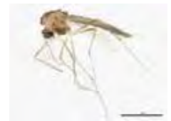
[Lateral] Chironomidae BIN URI: BOLD:AAI2688