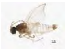
[Lateral] Cecidomyiidae BIN URI: BOLD:AAN5283