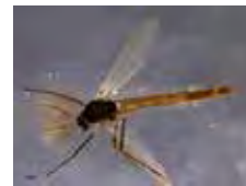
[Dorsal] Paracladopelma winnelli BIN URI: BOLD:AAK4963