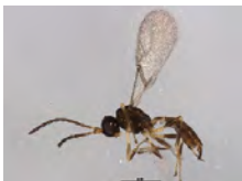
[Lateral] Hymenoptera BIN URI: BOLD:AAU8585