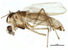
[Lateral] Chironomidae BIN URI: BOLD:AAU6612