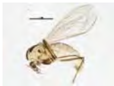
[Lateral] Chironomidae BIN URI: BOLD:AAN5369