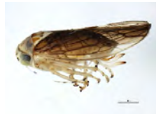
[Lateral] Idiocerus formosus BIN URI: BOLD:AAG2890