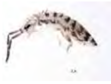
[Lateral] Entomobrya multifasciata BIN URI: BOLD:AAA7242