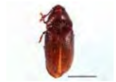
[Dorsal] Trixagus chevroleti BIN URI: BOLD:ACF8583