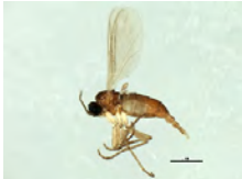
[Lateral] Sciaridae BIN URI: BOLD:ABU5520