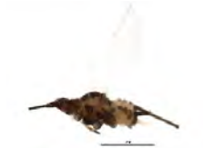
[Lateral] Hemiptera BIN URI: BOLD:AAB4239