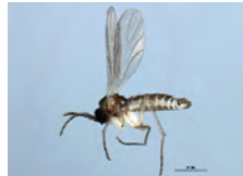
[Lateral] Sciaridae BIN URI: BOLD:AAM9242