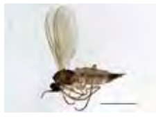
[Lateral] Microspectra subletteorum BIN URI: BOLD:AAF7088