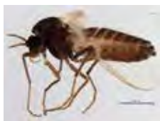
[Lateral] Chironomidae BIN URI: BOLD:AAM7064