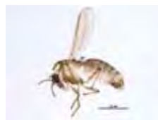
[Lateral] Chironomidae BIN URI: BOLD:ACI3270