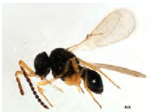
[Lateral] Telenomus BIN URI: BOLD:AAV9192