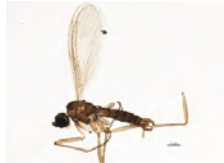
[Lateral] Sciaridae BIN URI: BOLD:ACF6849