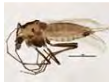
[Lateral] Orthocladius BIN URI: BOLD:AAB2641