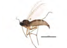
[Lateral] Sciaridae BIN URI: BOLD:AAV6412