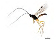
[Lateral] Braconidae BIN URI: BOLD:AAG1352