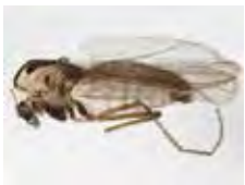
[Lateral] Heterotriisocladius BIN URI: BOLD:AAH0836