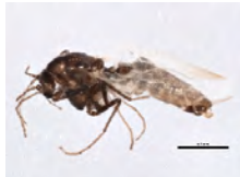
[Lateral] Chironomidae BIN URI: BOLD:ACF7513