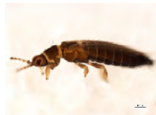
[Lateral] Franklaniella BIN URI: BOLD:AAL2817