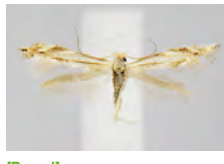
[Dorsal] Bucculatrix pomifoliella BIN URI: BOLD:AAD2085