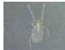
[Lateral] Abrolophus BIN URI: BOLD:ACI9840