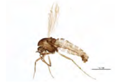
[Lateral] Limnophyes BIN URI: BOLD:ABV1190