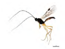
[Lateral] Braconidae BIN URI: BOLD:AAG1352