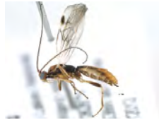
[Lateral] Aleiodes BIN URI: BOLD:ACF1641