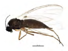
[Lateral] Scatopsiara BIN URI: BOLD:AAH3920