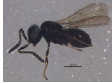
[Lateral] Synopeas BIN URI: BOLD:ACP8802