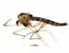
[Lateral] Chironomidae BIN URI: BOLD: AAJ4295