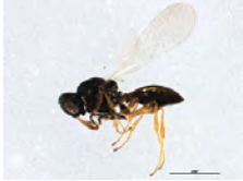
[Lateral] Platygasteridae BIN URI: BOLD:ABX2598