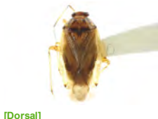
[Dorsal] Lygus lineolaris BIN URI: BOLD:AAA5803