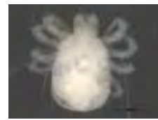
[Dorsal] Anystidae BIN URI: BOLD: ACE1253