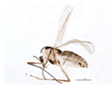
[Lateral] Paraphaenocladus impensus BIN URI: BOLD:AAC4197