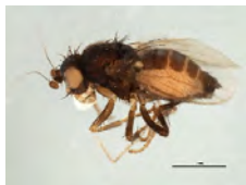
[Lateral] Sphaeroceridae BIN URI: BOLD:AAG7275