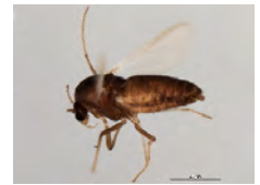
[Lateral] Chironomidae BIN URI: BOLD:AAF4817