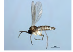
[Lateral] Sciaridae BIN URI: BOLD:AAM9242