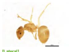
[Lateral] Lasius flavus BIN URI: BOLD:ABY6333