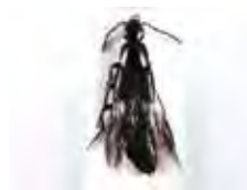
[Dorsal] Philonthus cognatus BIN URI: BOLD: AAL5087