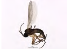
[Lateral] Sciaridae BIN URI: BOLD:ACE3123