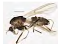
[Lateral] Cricotopus annulator cplx BIN URI: BOLD: ABY9141