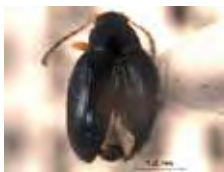
[Dorsal] Psyllodes napi BIN URI: BOLD: ABA4532