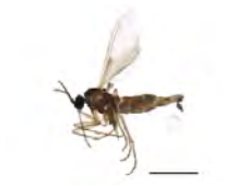
[Lateral] Sciaridae BIN URI: BOLD:AAN6446