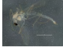
[Lateral] Chironomidae BIN URI: BOLD:ACA5100