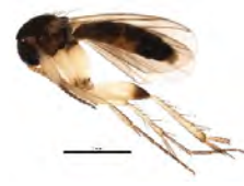
[Lateral] Mycetophilidae BIN URI: BOLD:AAN8584