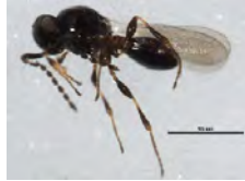
[Lateral] Platygasteridae BIN URI: BOLD:AAU9273