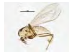
[Lateral] Chironomidae BIN URI: BOLD: AAN5369