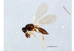
[Lateral] Platygasteridae BIN URI: BOLD:AAG8368