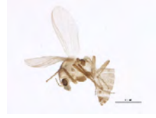
[Lateral] Chironomidae BIN URI: BOLD:ABA6452