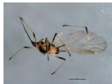
[Lateral] Aphididae BIN URI: BOLD:AAB9332