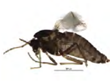
[Lateral] Chironomidae BIN URI: BOLD:ACN2260