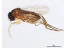
[Lateral] Phoridae BIN URI: BOLD:ABV3314