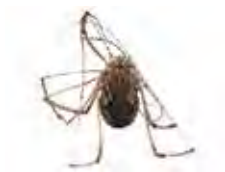
[Dorsal] Phalangium opilio BIN URI: BOLD: AAI4346