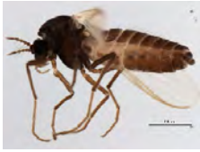
[Lateral] Chironomidae BIN URI: BOLD:AAM7064