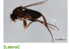
[Lateral] Phoridae BIN URI: BOLD:ABU5529