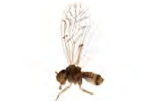
[Lateral] Psocoptera BIN URI: BOLD:AAF1729