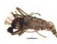
[Lateral] Cecidomyiidae BIN URI: BOLD: ACP8666