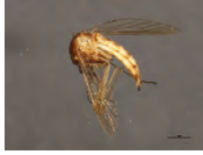
[Lateral] Aedes vexans BIN URI: BOLD:AAV7067