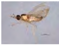
[Lateral] Cecidomyiidae BIN URI: BOLD: AAZ5618