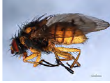
[Lateral] Muscidae BIN URI: BOLD:AAG1717