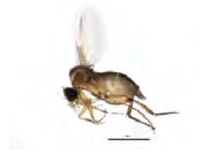
[Lateral] Phoridae BIN URI: BOLD:AAM7996