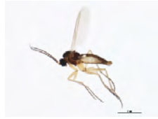
[Lateral] Sciaridae BIN URI: BOLD:AAN6444