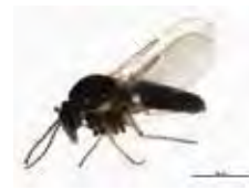
[Dorsal] Ceratopogonidae BIN URI: BOLD: AAN5162