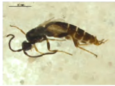
[Lateral] Stenomacrus BIN URI: BOLD:AAH1490