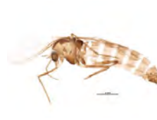
[Lateral] Chironomidae BIN URI: BOLD:ABA6405