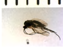
[Lateral] Sciaridae BIN URI: BOLD:ACM6005