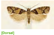
[Dorsal] Epinotia radicana BIN URI: BOLD:AAA9458