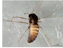
[Dorsal] Chironomidae BIN URI: BOLD:ACP4736