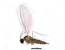
[Lateral] Cecidomyiidae BIN URI: BOLD: ABA6413