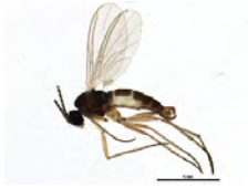
[Lateral] Sciaridae BIN URI: BOLD:AAM9235