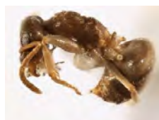
[Lateral] Lasius BIN URI: BOLD:AAB9126