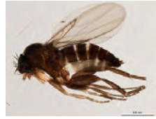
[Lateral] Phoridae BIN URI: BOLD:AAN8700