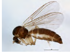
[Lateral] Mycetophilidae BIN URI: BOLD:ACG5774