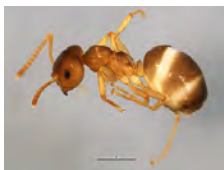
[Lateral] Formicidae BIN URI: BOLD:AAI1292