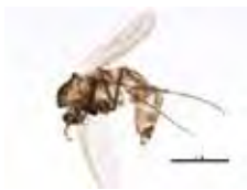
[Lateral] Bryophaenocladus sp. 8ES BIN URI: BOLD: AAG1021