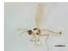
[Lateral] Cecidomyiidae BIN URI: BOLD: ABA6412