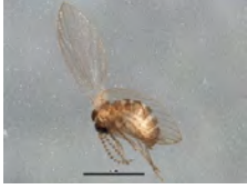
[Lateral] Psychodidae BIN URI: BOLD:AAF9317