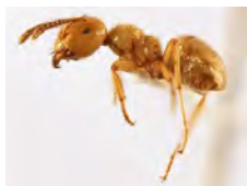
[Lateral] Lasius BIN URI: BOLD:ABY9254