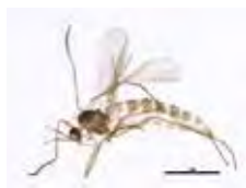
[Lateral] Cecidomyiidae BIN URI: BOLD: ABA6449