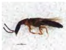
[Lateral] Nudobius BIN URI: BOLD: AAY6531