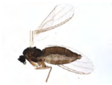
[Lateral] Lycoriella BIN URI: BOLD:ACM4797