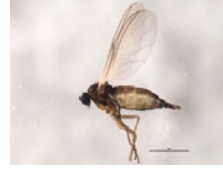
[Lateral] Sciaridae BIN URI: BOLD:AAM9243