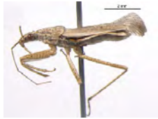
[Lateral] Nabis americoferus BIN URI: BOLD:AAB8143