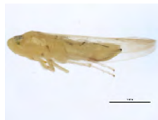
[Lateral] Typhlocyba BIN URI: BOLD:ABA5828