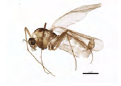
[Lateral] Chironomidae BIN URI: BOLD:ABA6465