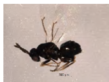
[Lateral] Eulophidae BIN URI: BOLD:ABX9553