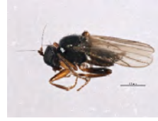
[Lateral] Hybotidae BIN URI: BOLD:AAN5501