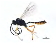
[Lateral] Campoletis flavicincta BIN URI: BOLD:AAN7740