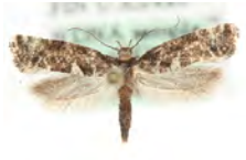
[Dorsal] Acrolepiopsis assectella BIN URI: BOLD:AAB4903