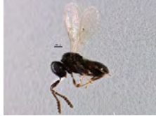
[Lateral] Platygasteridae BIN URI: BOLD:ACC0993