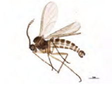
[Lateral] Sciaridae BIN URI: BOLD:ABA6407