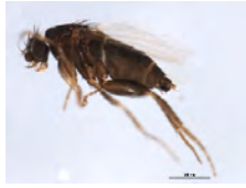
[Lateral] Phoridae BIN URI: BOLD:AAG3316