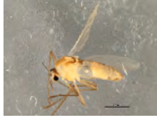
[Lateral] Chironomidae BIN URI: BOLD:AAN5342