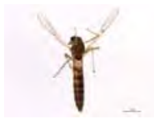
[Dorsal] Chironomidae BIN URI: BOLD: AAJ4275