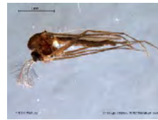
[Lateral] Parochlus kiefferi BIN URI: BOLD:AAC1427