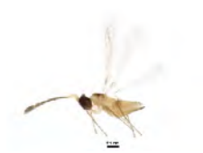
[Lateral] Mymaridae BIN URI: BOLD:ABV9379