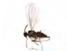
[Lateral] Cecidomyiidae BIN URI: BOLD: ABA7873