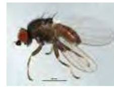
[Lateral] Chamaemyiidae BIN URI: BOLD: ACC5514