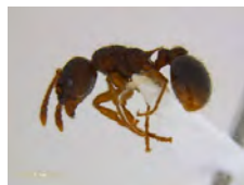
[Lateral] Myrmica AF-smi BIN URI: BOLD:AAA1840