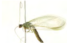
[Lateral] Chrysoperla rufilabris BIN URI: BOLD:ACC7133