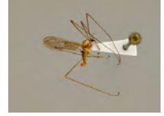
[Lateral] Erioptera septemtrionis BIN URI: BOLD:AAF9055