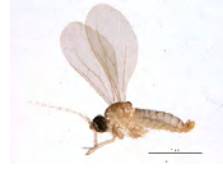
[Lateral] Mycetophilidae BIN URI: BOLD:ACI8785