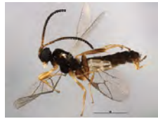
[Lateral] Hymenoptera BIN URI: BOLD:AAP6689