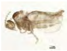
[Lateral] Cecidomyiidae BIN URI: BOLD: AAV5796