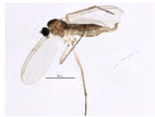
[Lateral] Sciaridae BIN URI: BOLD:ACF8967