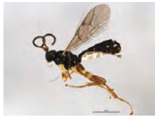
[Lateral] Hymenoptera BIN URI: BOLD:AAM7494