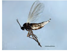
[Lateral] Sciaridae BIN URI: BOLD:AAM9225