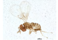
[Lateral] Trichogramma sp. BIN URI: BOLD:ACE9876