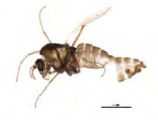
[Lateral] Smittia BIN URI: BOLD:ABA6450