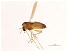
[Lateral] Chironomidae BIN URI: BOLD:ABU5525