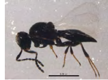
[Lateral] Platygasteridae BIN URI: BOLD:ACL4258