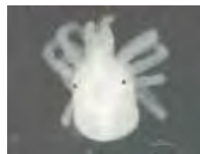
[Dorsal] Anystidae BIN URI: BOLD: ABW2639