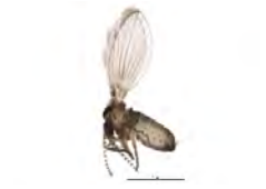
[Lateral] Psychodidae BIN URI: BOLD:AAF9314