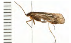
[Lateral] Limnephilus submonilifer BIN URI: BOLD:AAA3080