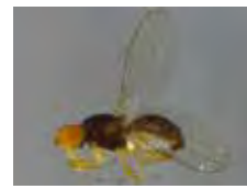
[Lateral] Leiomyza curvinervis BIN URI: BOLD: AAX5462