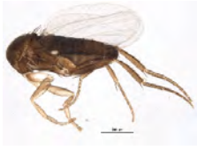
[Lateral] Phoridae BIN URI: BOLD:ACE1685