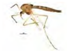
[Lateral] Chironomus BIN URI: BOLD: ABV1236