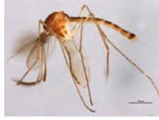
[Lateral] Culicidae BIN URI: BOLD:AAB6943