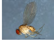
[Lateral] Drosophila neotestacea BIN URI: BOLD:AAC7070