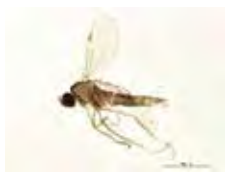
[Lateral] Cecidomyiidae BIN URI: BOLD: AAU6598