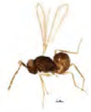
[Lateral] Myrmaridae BIN URI: BOLD:AAZ0173