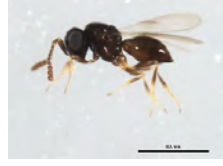
[Lateral] Telenomus BIN URI: BOLD:AAU9340