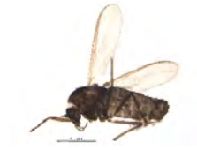
[Lateral] Smittia BIN URI: BOLD:ACP7551