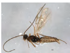
[Lateral] Hormius BIN URI: BOLD:ACC4201