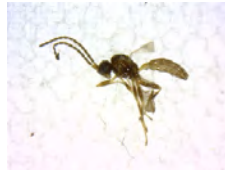
[Lateral] Hymenoptera BIN URI: BOLD:ACD1926