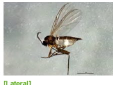
[Lateral] Sciaridae BIN URI: BOLD:AAH3942