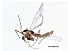
[Lateral] Micropsectra polita BIN URI: BOLD:AAC4403