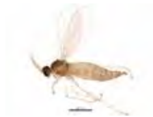
[Lateral] Cecidomyiidae BIN URI: BOLD: ABA6460