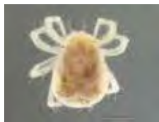
[Dorsal] Anystidae BIN URI: BOLD: ACA6346