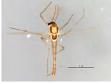
[Dorsal] Chironomidae BIN URI: BOLD:AAN5348