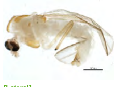
[Lateral] Chironominae BIN URI: BOLD:ACA3275