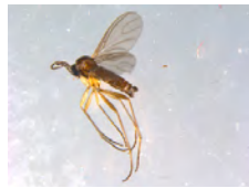
[Lateral] Sciaridae BIN URI: BOLD:AAH3918