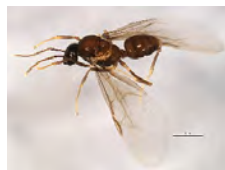
[Lateral] Formicidae BIN URI: BOLD:ACF3947