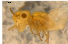
[Lateral] Valenzuela burmeisteri BIN URI: BOLD:AAO4092