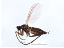
[Lateral] Sciaridae BIN URI: BOLD:AAV1261