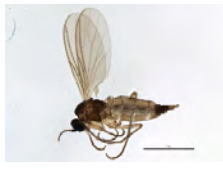
[Lateral] Micropsectra subletterorum BIN URI: BOLD:AAF7088