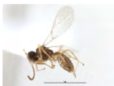
[Lateral] Aphidiinae BIN URI: BOLD:AAM7497