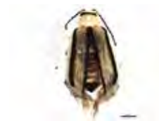
[Dorsal] Acalymma vittatum BIN URI: BOLD: AAF4335