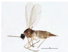
[Lateral] Sciaridae BIN URI: BOLD:AAP6465