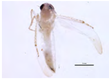
[Dorsal] Cicadellidae BIN URI: BOLD:ACP8819