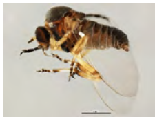
[Lateral] Simulium decorum BIN URI: BOLD:AAB7749