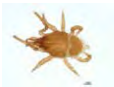
[Dorsal] Parasitidae BIN URI: BOLD: AAN6627