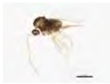
[Lateral] Cecidomyiidae BIN URI: BOLD: AAN5178