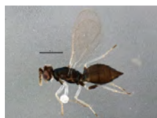
[Lateral] Eulophidae BIN URI: BOLD:AAZ3291