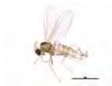
[Lateral] Cecidomyiidae BIN URI: BOLD: ABA6426