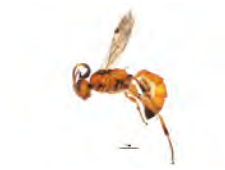
[Lateral] Ichneumoninae BIN URI: BOLD:AAH7265