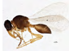
[Lateral] Platygasteridae BIN URI: BOLD:ACE3998