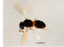
[Lateral] Scelioninae BIN URI: BOLD:ABA6154