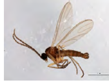
[Lateral] Sciaridae BIN URI: BOLD:AAH3939