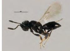
[Lateral] Hymenoptera BIN URI: BOLD:ACP7647