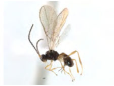
[Lateral] Braconidae BIN URI: BOLD:AAU9433