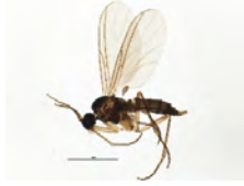
[Lateral] Bradysia difformis BIN URI: BOLD:AAV1295