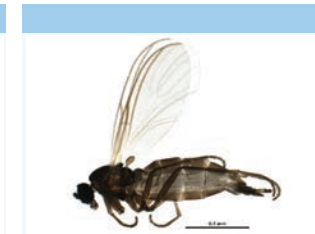
[Lateral] Bradysia atroparva BIN URI: BOLD:AAM9243