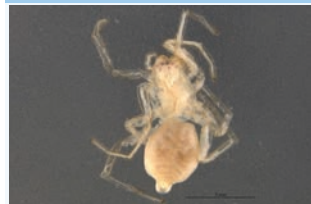
[Dorsal] Clubiona canadensis BIN URI: BOLD:AAB2563