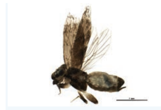
[Lateral] Psocoptera BIN URI: BOLD:AAP4625