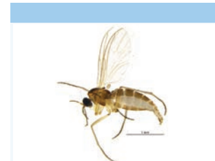
[Lateral] Sciaridae BIN URI: BOLD:AAH3947