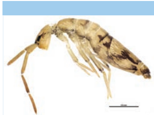
[Lateral] Entomobrya nivalis BIN URI: BOLD:AAA8924