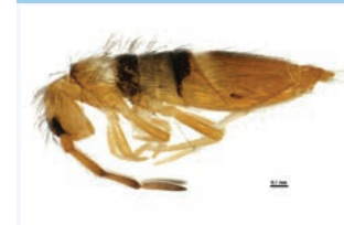
[Lateral] Entomobrya atrocincta BIN URI: BOLD:ACE5102