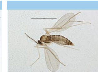
[Lateral] Cecidomyiidae BIN URI: BOLD:ABW7897