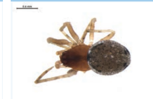
[Dorsal] Wamba crispulus BIN URI: BOLD:AAN6371