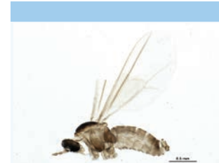
[Lateral] Cecidomyiidae BIN URI: BOLD:ACL1381