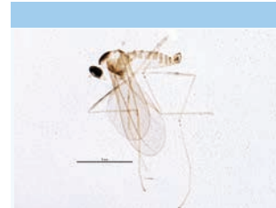
[Lateral] Cecidomyiidae BIN URI: BOLD:ACC6796