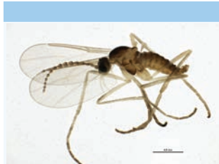
[Lateral] Cecidomyiidae BIN URI: BOLD:AAV5757