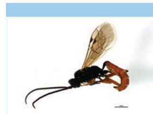
[Lateral] Ichneumoninae BIN URI: BOLD:AAH1919