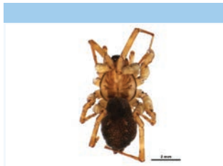
[Dorsal] Agelenopsis utahana BIN URI: BOLD:AAB0090

The images of the species collected in your Malaise trap are shown below. A single representative from each species was selected to be photographed; in some cases, only a damaged specimen was available.