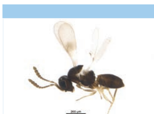
[Lateral] Platygasteridae BIN URI: BOLD:AAU9340