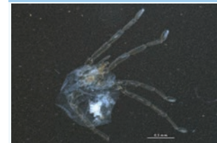
[Dorsal] Erythraeidae BIN URI: BOLD:ACI6338