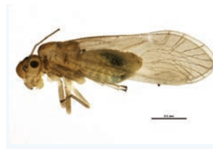
[Lateral] Valenzuela BIN URI: BOLD:ACR3866