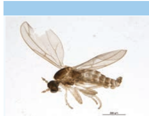
[Lateral] Cecidomyiidae BIN URI: BOLD:ACT5836