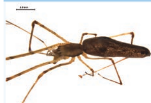
[Dorsal] Tetragnatha viridis BIN URI: BOLD:AAG5659