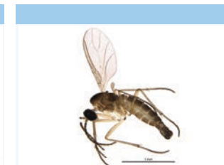
[Lateral] Sciaridae BIN URI: BOLD:ACL7022