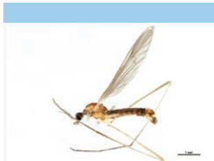
[Lateral] Ormosia affinis BIN URI: BOLD:AAU6544