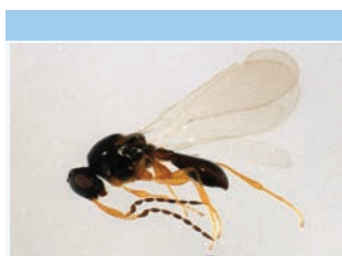
[Lateral] Platygasteridae BIN URI: BOLD:ABV2735