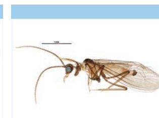
[Lateral] Coniopterygidae BIN URI: BOLD:ACG2784