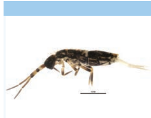
[Lateral] Collembola BIN URI: BOLD:AAA6611