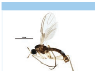
[Lateral] Sciaridae BIN URI: BOLD:ABX3195