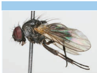
[Lateral] Fanniidae BIN URI: BOLD:AAG4620