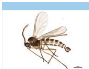
[Lateral] Sciaridae BIN URI: BOLD:ABA6407