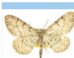
[Dorsal] Protoboarmia porcelaria BIN URI: BOLD:AAA2077