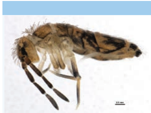
[Lateral] Lepidocyrtus BIN URI: BOLD:ACM2009