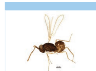
[Lateral] Myrmecodia BIN URI: BOLD:AAZ0173