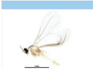
[Lateral] Cecidomyiidae BIN URI: BOLD:AAM6087