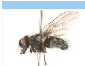
[Lateral] Phaonia BIN URI: BOLD:ABU9891