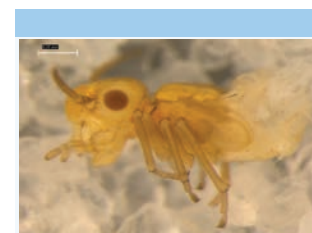
[Lateral] Valenzuela burmeisteri BIN URI: BOLD:AAO4092