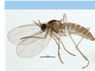
[Lateral] Cecidomyiidae BIN URI: BOLD:AAQ0652