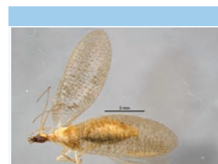
[Lateral] Hemerobius pinidumus BIN URI: BOLD:AAG0904