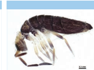
[Lateral] Entomobrya BIN URI: BOLD:AAA4664