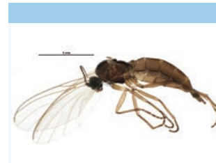
[Lateral] Scatopsciara atomaria BIN URI: BOLD:AAH3920