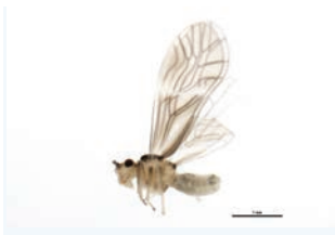
[Lateral] Valenzuela flavidus BIN URI: BOLD:AAH3228