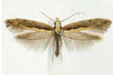
[Dorsal] Plutella xylostella BIN URI: BOLD:AAA1513