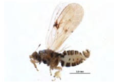
[Lateral] Craspedolepta BIN URI: BOLD:ACI8479