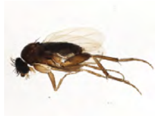
[Lateral] Megaselia BIN URI: BOLD:AAG3274