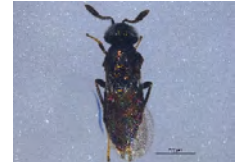
[Dorsal] Encyrtidae BIN URI: BOLD:ACP9725