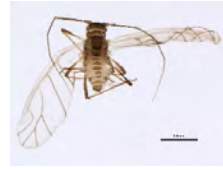
[Dorsal] Chaetosphon fragaefolii BIN URI: BOLD:AAD3961