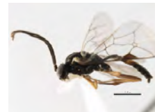
[Lateral] Ichneumonidae BIN URI: BOLD:AAH1498