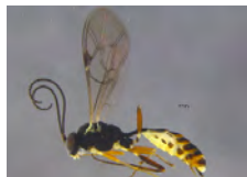
[Lateral] Ichneumonidae BIN URI: BOLD:AAN7726