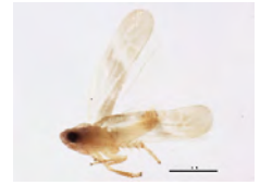
[Lateral] Empoasca BIN URI: BOLD:AAV0226