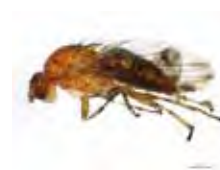
[Lateral] Suillia nemorum BIN URI: BOLD: AAG0469