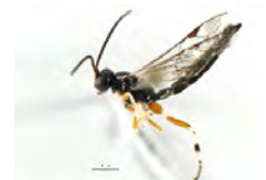
[Lateral] Scambus BIN URI: BOLD:ACP9166