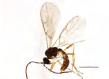
[Lateral] Aphidiinae BIN URI: BOLD:ACP9320