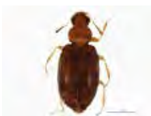
[Dorsal] Corticaria BIN URI: BOLD: ABA9093