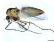
[Lateral] Chironomidae BIN URI: BOLD: AAN4803