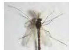
[Dorsal] Chironomidae BIN URI: BOLD: AAN8989