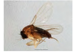
[Lateral] Phoridae BIN URI: BOLD:ABY0968