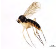
[Lateral] Mycetophilidae BIN URI: BOLD:AAL9137