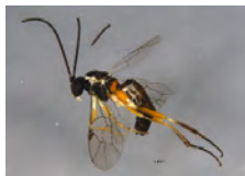
[Lateral] Woldstedtius BIN URI: BOLD:ACC6456