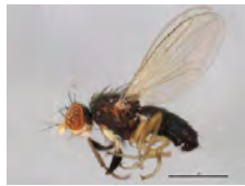
[Lateral] Heleomyzidae BIN URI: BOLD:AAP6255