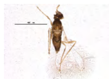
[Dorsal] Idris BIN URI: BOLD:ACP9287