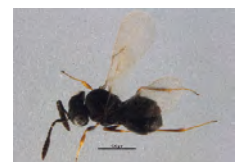
[Dorsal] Hymenoptera BIN URI: BOLD:ACD5196