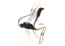
[Lateral] Diadegma BIN URI: BOLD:AAL1411