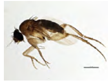
[Lateral] Phoridae BIN URI: BOLD:AAZ6701