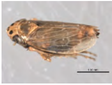
[Lateral] Amblysellus dorsti BIN URI: BOLD:ACD9105