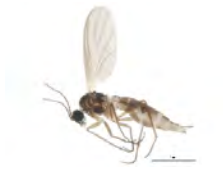
[Lateral] Sciaridae BIN URI: BOLD:AAH3941