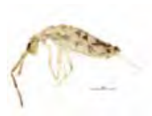
[Lateral] Entomobrya BIN URI: BOLD: ACL6239