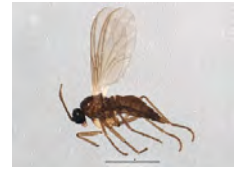
[Lateral] Sciaridae BIN URI: BOLD:ABX3194