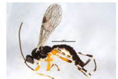
[Lateral] Ichneumonidae BIN URI: BOLD:AAQ2915