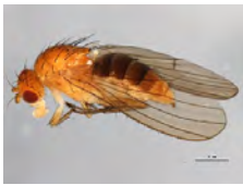
[Lateral] Heleomyzidae BIN URI: BOLD:AAG0459