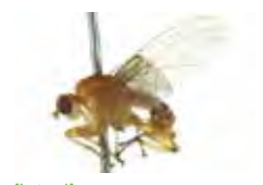
[Lateral] Heleomyzidae BIN URI: BOLD: AAP2913