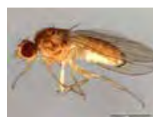
[Lateral] Drosophilidae BIN URI: BOLD: AAN5544