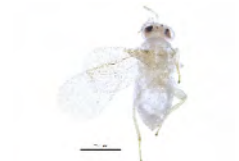
[Dorsal] Aphelinus BIN URI: BOLD:ACP9451