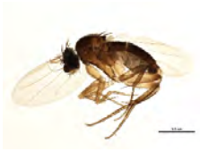
[Lateral] Phoridae BIN URI: BOLD:ACB6729