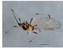
[Lateral] Aphididae BIN URI: BOLD:AAB9332