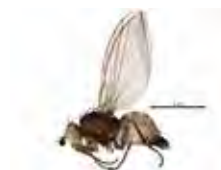
[Lateral] Phytomyza BIN URI: BOLD: ACP7355