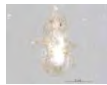
[Ventral] Ascidae BIN URI: BOLD: ABA5555