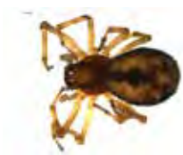
[Dorsal] Dictyna brevitarsa BIN URI: BOLD: AAN2653