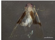
[Dorsal] Empoasca BIN URI: BOLD:ABA5763