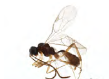
[Lateral] Ichneumonidae BIN URI: BOLD:AAC8821