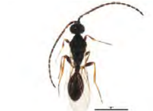
[Dorsal] Belyta validicornis BIN URI: BOLD:AAU8736