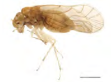
[Lateral] Psocoptera BIN URI: BOLD:ABW5647