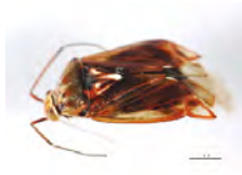
[Dorsal] Lygus plagiatus BIN URI: BOLD:ACF4388