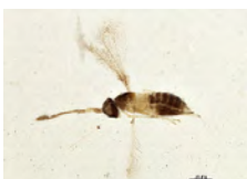
[Lateral] Anagrus BIN URI: BOLD:AAZ1968