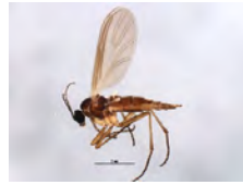
[Lateral] Sciaridae BIN URI: BOLD:AAH3929