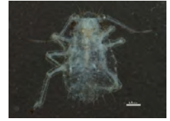
[Dorsal] Chaetophorus populialbae BIN URI: BOLD:AAI4166