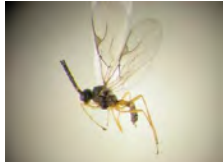
[Lateral] Praon BIN URI: BOLD:AAC9533