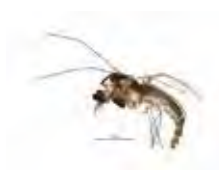
[Lateral] Orthocladinae BIN URI: BOLD: ACL0132