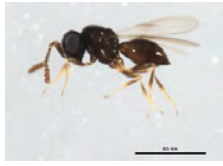
[Lateral] Telenomus BIN URI: BOLD:AAU9340