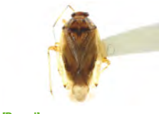
[Dorsal] Lygus lineolaris BIN URI: BOLD:AAA5803