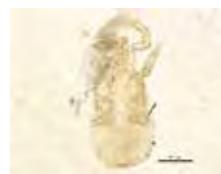
[Dorsal] Ascidae BIN URI: BOLD: ACE1827