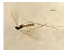
[Dorsal] Cecidomyiidae BIN URI: BOLD: AAP9022