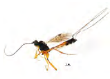
[Lateral] Lissonota coracina BIN URI: BOLD:AAG7794