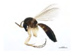
[Lateral] Mycetophilidae BIN URI: BOLD:ABU5545