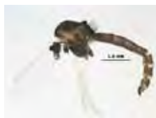
[Lateral] Orthocladus BIN URI: BOLD: ACP9504