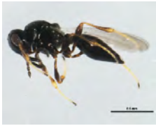
[Lateral] Platygastridae BIN URI: BOLD:AAU8342