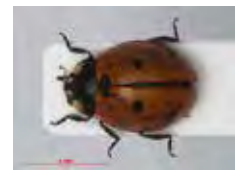
[Dorsal] Coccinella septempunctata BIN URI: BOLD: AAA8933