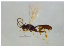
[Lateral] Stenomacrus BIN URI: BOLD:ACE4848