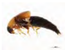
[Lateral] Tachyporus rulomus BIN URI: BOLD: AAP7029