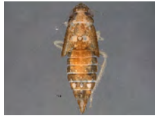
[Dorsal] Colladonus BIN URI: BOLD:ACC8216