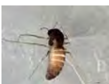
[Dorsal] Chironomidae BIN URI: BOLD: ACP4736