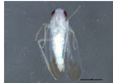
[Dorsal] Empoasca BIN URI: BOLD:AAN8289