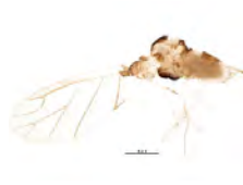
[Lateral] Capitophorus elaeagni BIN URI: BOLD:AAE3015