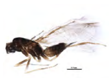
[Lateral] Myrmaridae BIN URI: BOLD:ACP9674