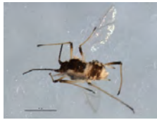
[Lateral] Aphididae BIN URI: BOLD:AAB8566