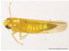
[Lateral] Empoasca BIN URI: BOLD:AAG8850