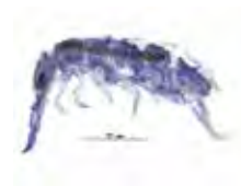
[Lateral] Isotoma BIN URI: BOLD: ACP8804