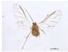
[Dorsal] Metopolophium dirhodum BIN URI: BOLD:AAE7796