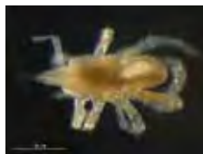
[Dorsal] Cyta BIN URI: BOLD: AAH6636