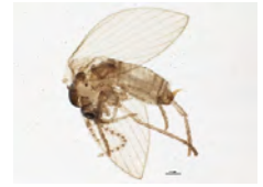
[Lateral] Psychodidae BIN URI: BOLD:ACF6513