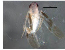
[Dorsal] Empoasca BIN URI: BOLD:ACC8521