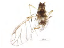
[Dorsal] Ericaphis gentneri BIN URI: BOLD:AAC9301