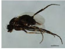
[Lateral] Phoridae BIN URI: BOLD:AAG3236