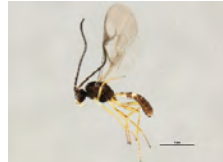
[Lateral] Braconidae BIN URI: BOLD:AAU9028