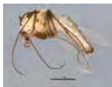
[Lateral] Chironomidae BIN URI: BOLD: ACG3299