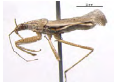
[Lateral] Nabis americoferus BIN URI: BOLD:AAB8143