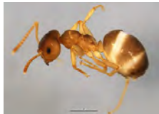
[Lateral] Formicidae BIN URI: BOLD:AAI1292