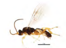
[Lateral] Orthocentrus JFT02 BIN URI: BOLD:AAU8218