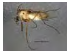
[Lateral] Orthocladus BIN URI: BOLD: ABX3879