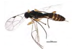
[Dorsal] Eruga BIN URI: BOLD:ACP9667