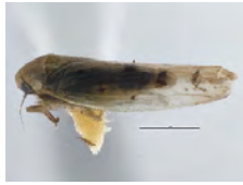
[Lateral] Balclutha punctata BIN URI: BOLD:AAG9374