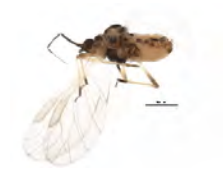
[Lateral] Nearctaphis crataegifoliae BIN URI: BOLD:ACF1270