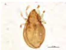
[Dorsal] Sarcotiformes BIN URI: BOLD: ACD9111