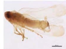
[Lateral] Typhlocyba pomaria BIN URI: BOLD:AAF5980