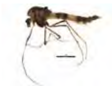
[Lateral] Chironomidae BIN URI: BOLD: AAG1004