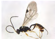
[Lateral] Ichneumonidae BIN URI: BOLD:ACE0702