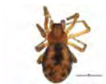
[Dorsal] Dictyna brevitarsa BIN URI: BOLD: AAB2306