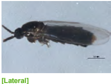
[Lateral] Scatopsidae BIN URI: BOLD:AAN8523