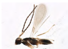
[Lateral] Hymenoptera BIN URI: BOLD:ACD0107