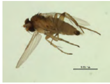
[Lateral] Phoridae BIN URI: BOLD:AAG3350