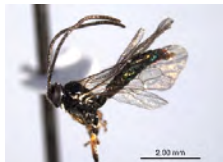
[Lateral] Itopectis vesca BIN URI: BOLD:AAB1282