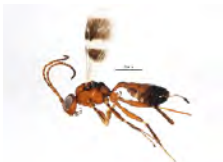
[Lateral] Hymenoptera BIN URI: BOLD:AAA6280