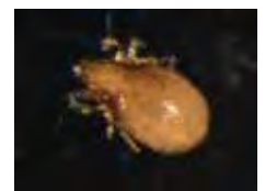
[Dorsal] Oribatula BIN URI: BOLD: AAZ5791