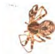
[Dorsal] Philodromus alascensis BIN URI: BOLD: AAC0312