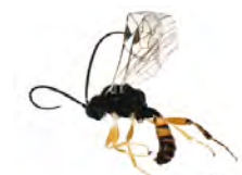
[Lateral] Ichneumonidae BIN URI: BOLD:AAQ2692