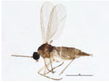
[Lateral] Sciaridae BIN URI: BOLD:AAP6465