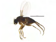
[Lateral] Phoridae BIN URI: BOLD:AAG3311