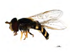
[Lateral] Syrphidae BIN URI: BOLD:AAB2384