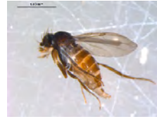
[Lateral] Phoridae BIN URI: BOLD:AAG3266