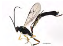
[Lateral] Diadegma sp. BIN URI: BOLD:AAB8765