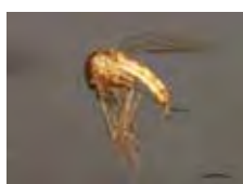
[Lateral] Aedes vexans BIN URI: BOLD: AAA7067