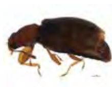
[Lateral] Corticarina BIN URI: BOLD: ACD4236