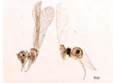
[Lateral] Psocoptera BIN URI: BOLD:ACG6082