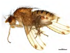
[Lateral] Heleomyzidae BIN URI: BOLD:AAE1978