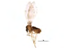
[Lateral] Psychodidae BIN URI: BOLD:AAF9306