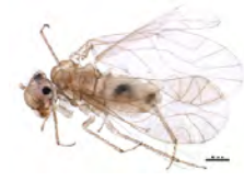
[Lateral] Psocoptera BIN URI: BOLD:ACM5405