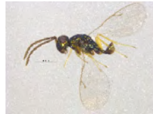
[Lateral] Pteromalidae BIN URI: BOLD:ACD0889