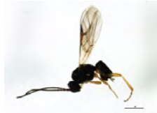
[Lateral] Opinae BIN URI: BOLD:ACP9711