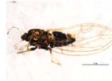
[Lateral] Hemiptera BIN URI: BOLD:AAO8339