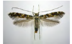
[Dorsal] Caloptilia syringella BIN URI: BOLD:AAC0054