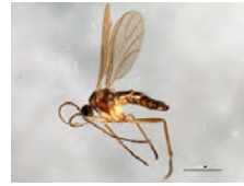
[Lateral] Sciaridae BIN URI: BOLD:AAM9255