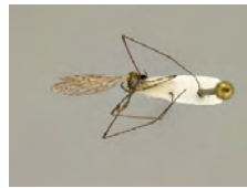
[Lateral] Symplecta BIN URI: BOLD:AAF9014