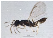
[Lateral] Eulophidae BIN URI: BOLD:ACL2737