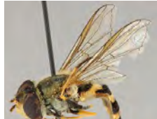
[Lateral] Syrphus vitripennis BIN URI: BOLD:AAB5577