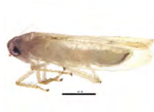
[Lateral] Empoasca BIN URI: BOLD:ACP7407