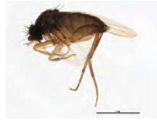
[Lateral] Megaselia BIN URI: BOLD:AAU6524