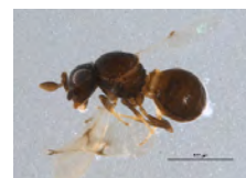
[Lateral] Idris BIN URI: BOLD:AAU9367