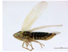
[Lateral] Dikraneura BIN URI: BOLD:AAV0227