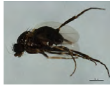
[Lateral] Phoridae BIN URI: BOLD:AAG3236