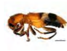
[Lateral] Cleridae BIN URI: BOLD:AAH0237