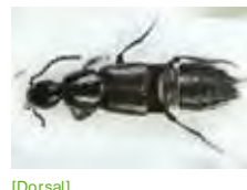
[Dorsal] Philonthus carbonarius BIN URI: BOLD:AAR1764