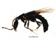
[Lateral] Staphylinidae BIN URI: BOLD:ABA9958