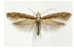
[Dorsal] Plutella xylostella BIN URI: BOLD:AAA1513