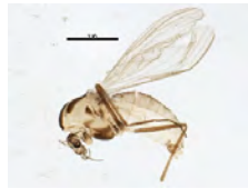
[Lateral] Chironomidae BIN URI: BOLD:AAN5369