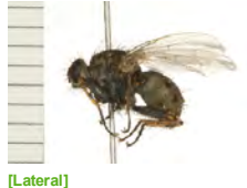
[Lateral] Coenosia tigrina BIN URI: BOLD:AAB5609