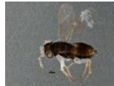
[Lateral] Aphelinus varipes BIN URI: BOLD: ABW3282