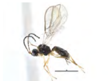
[Lateral] Dinotrema BIN URI: BOLD: AAU8452