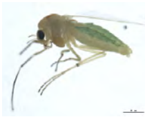
[Lateral] Chironomidae BIN URI: BOLD:ACL4244