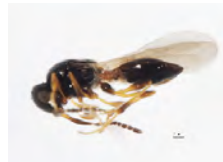
[Lateral] Hymenoptera BIN URI: BOLD:AAG8271