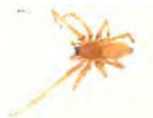
[Dorsal] Cheiracanthium mildei BIN URI: BOLD:AAB7601