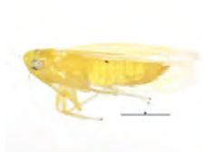
[Lateral] Empoasca BIN URI: BOLD: AAN8250