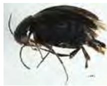
[Lateral] Mordellistena BIN URI: BOLD:AAH0125