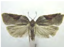
[Dorsal] Acleris macdunnoughi BIN URI: BOLD:AAA7793