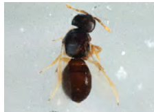
[Dorsal] Hymenoptera BIN URI: BOLD:ACC7658