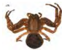
[Dorsal] Xysticus elegans BIN URI: BOLD:AAC1568