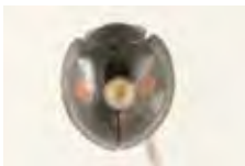
[Dorsal] Chilocorus stigma BIN URI: BOLD:AAH3301