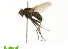
[Lateral] Anthomyiidae BIN URI: BOLD:AAG2460