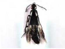
[Dorsal] Philonthus cognatus BIN URI: BOLD:AAL5087