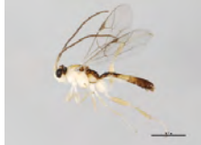
[Lateral] Orthocentrinae BIN URI: BOLD:AAG8257