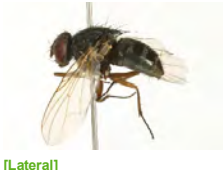
[Lateral] Muscidae BIN URI: BOLD:AAG1715