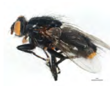
[Lateral] Boettcheria cimbicis BIN URI: BOLD:AAG6756