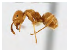
[Lateral] Lasius BIN URI: BOLD: ABZ0423