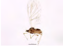
[Lateral] Rhopalomyzus lonicerae BIN URI: BOLD: AAC4637