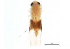
[Dorsal] Empoasca BIN URI: BOLD: AAY6743