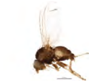
[Lateral] Aulagromyza luteoscutellata BIN URI: BOLD:AAJ9681