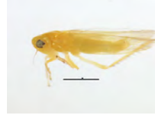
[Lateral] Empoasca decipiens BIN URI: BOLD: AAY6741