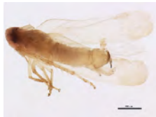
[Lateral] Typhlocyba pomaria BIN URI: BOLD: AAF5980