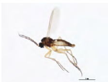
[Lateral] Sciaridae BIN URI: BOLD:AAN6444