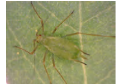
[Dorsal] Macrosiphum euphorbiae BIN URI: BOLD: AAA6213