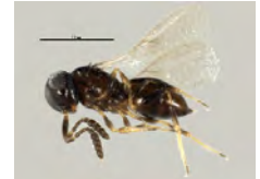
[Lateral] Telenomus BIN URI: BOLD:ACJ0216