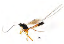
[Lateral] Lissonota coracina BIN URI: BOLD:AAG7794