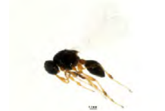
[Lateral] Platygastriidae BIN URI: BOLD:AAG7883