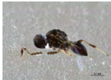
[Lateral] Platygastriidae BIN URI: BOLD:ACL3237