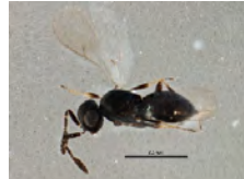
[Lateral] Telenomus BIN URI: BOLD:ACC8019