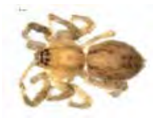
[Dorsal] Anyphaena pectorosa BIN URI: BOLD:AAD6926