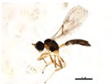
[Lateral] Aphidius BIN URI: BOLD: ACF4786