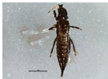
[Dorsal] Haplothrips BIN URI: BOLD:AAI6861