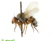
[Lateral] Siphona flavipes BIN URI: BOLD:AAM7892