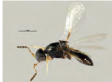
[Lateral] Synopeas BIN URI: BOLD:ACI9856