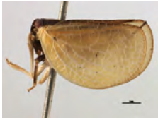
[Lateral] Acanalonia bivittata BIN URI: BOLD: AAN8422