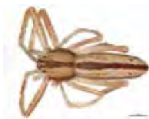
[Dorsal] Tibellus maritimus BIN URI: BOLD:AAA7188