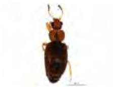
[Dorsal] Corticarina BIN URI: BOLD:AAH0256