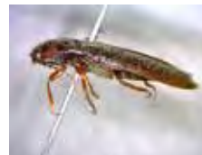
[Lateral] Enoclerus nigripes rufiventris BIN URI: BOLD:AAU6970