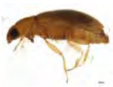
[Lateral] Corticaria BIN URI: BOLD:AAN6154