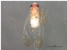
[Dorsal] Hemiptera BIN URI: BOLD: ABW2932