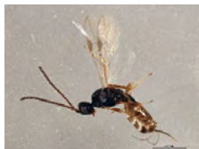
[Lateral] Blacus steffoxi BIN URI: BOLD: AAZ9744