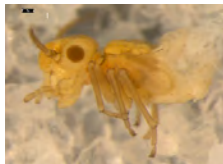
[Lateral] Valenzuela burmeisteri BIN URI: BOLD:AAO4092