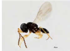
[Lateral] Telenomus BIN URI: BOLD:AAV9194