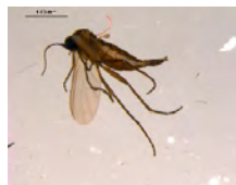
[Lateral] Sciaridae BIN URI: BOLD:AAQ2138