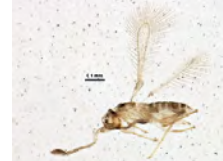
[Lateral] Myrmariidae BIN URI: BOLD:ABV2812