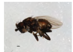
[Lateral] Sphaeroceridae BIN URI: BOLD:AAG7289