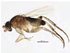
[Lateral] Phoridae BIN URI: BOLD:AAU5598