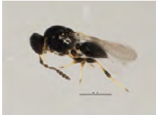
[Lateral] Synopeas BIN URI: BOLD:AAU8571