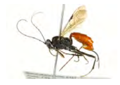
[Lateral] Hymenoptera BIN URI: BOLD: ACF3458