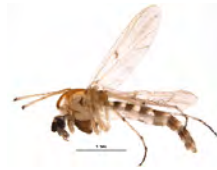
[Lateral] Chironomidae BIN URI: BOLD:ACP8516