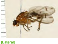
[Lateral] Dryomyza anilis BIN URI: BOLD:AAC6974