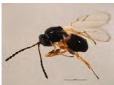
[Lateral] Hymenoptera BIN URI: BOLD: AAP6708