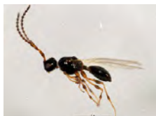
[Lateral] Diapriidae BIN URI: BOLD: AAP6717