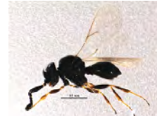
[Lateral] Telenomus BIN URI: BOLD:ACP8474