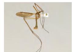
[Lateral] Tipula paludosa BIN URI: BOLD:AAE7386