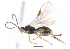
[Lateral] Braconidae BIN URI: BOLD: AAU8453