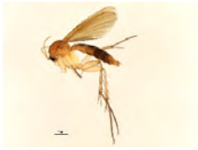
[Lateral] Mycetophila fungorum BIN URI: BOLD:ACF2821