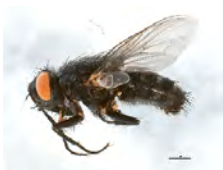
[Lateral] Sarcophagidae BIN URI: BOLD:ABV1243