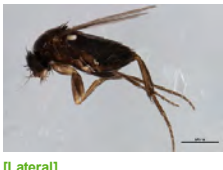
[Lateral] Phoridae BIN URI: BOLD:ABU5529