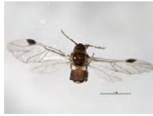
[Dorsal] Hemiptera BIN URI: BOLD: AAN8408