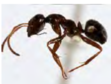
[Lateral] Formica BIN URI: BOLD: AAE0406