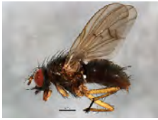
[Lateral] Muscidae BIN URI: BOLD:ACE9475