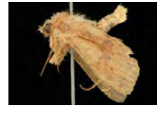
[Lateral] Sunira bicolorago BIN URI: BOLD:AAA4426