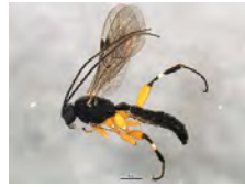
[Lateral] Hymenoptera BIN URI: BOLD:AAD5194