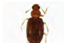
[Dorsal] Corticaria BIN URI: BOLD:ABA9093