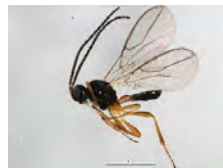
[Lateral] Hymenoptera BIN URI: BOLD: AAG1342