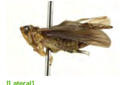
[Lateral] Prescottia lobata BIN URI: BOLD: AAY6739