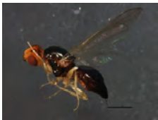
[Lateral] Psilidae BIN URI: BOLD:AAF9710