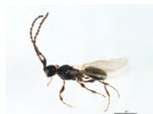
[Lateral] Hymenoptera BIN URI: BOLD: AAM7487