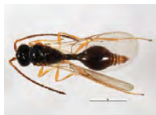
[Dorsal] Diapriidae BIN URI: BOLD: AAU8448