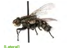
[Lateral] Diptera BIN URI: BOLD:AAG6743