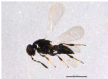
[Lateral] Platygastriidae BIN URI: BOLD:ACI8508