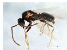
[Lateral] Prenolepis imparis BIN URI: BOLD: AAC1302