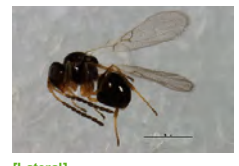
[Lateral] Hymenoptera BIN URI: BOLD: AAG0778