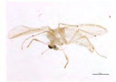
[Lateral] Chironomidae BIN URI: BOLD:AAL7356