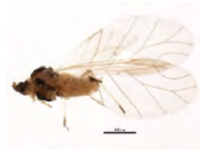
[Lateral] Aphis glycines BIN URI: BOLD: AAB7938