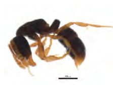
[Lateral] Ponera pennsylvanica BIN URI: BOLD: AAF0441