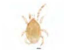
[Dorsal] Mesostigmata BIN URI: BOLD:ACF7854