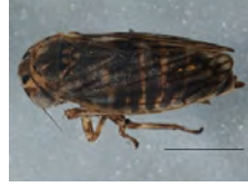
[Lateral] Ceratagallia sanguinolenta BIN URI: BOLD: AAG2874