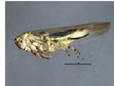
[Lateral] Macrosteles quadrilineatus BIN URI: BOLD: AAA9422