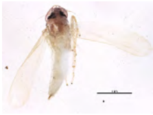
[Dorsal] Empoasca BIN URI: BOLD: AAG2868