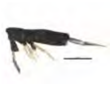
[Lateral] Collembola BIN URI: BOLD:AAB8452