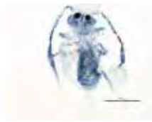
[Dorsal] Collembola BIN URI: BOLD:ACJ0012