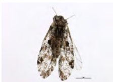
[Dorsal] Psocoptera BIN URI: BOLD:AAF4633