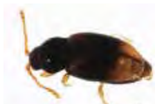
[Dorsal] Atomaria ephippiata BIN URI: BOLD:AAP7030