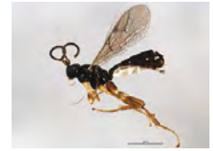
[Lateral] Hymenoptera BIN URI: BOLD:AAM7494