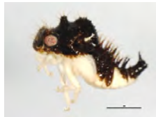
[Lateral] Pubilia concava BIN URI: BOLD: AAD6344