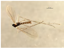
[Dorsal] Cecidomyiidae BIN URI: BOLD:AAP9022