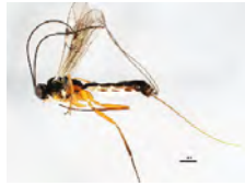
[Lateral] Hymenoptera BIN URI: BOLD:AAG7644