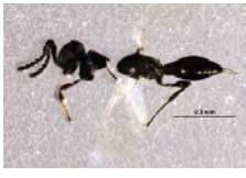
[Lateral] Platygastriidae BIN URI: BOLD:ACP9170