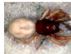
[Dorsal] Trachelas depressus BIN URI: BOLD:ACN8290