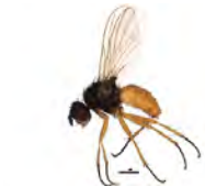
[Lateral] Anthomyiidae BIN URI: BOLD:AAN5497