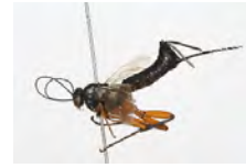
[Lateral] Pimpla pedalis BIN URI: BOLD:AAD5192