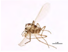
[Lateral] Chironomidae BIN URI: BOLD:ABA6447