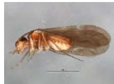
[Lateral] Psocoptera BIN URI: BOLD:ABA6163