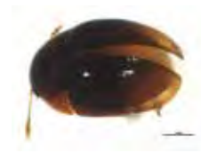
[Lateral] Stilbus apicalis BIN URI: BOLD:AAH0134