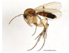
[Lateral] Mycetophilidae BIN URI: BOLD:AAM8980