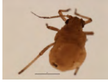
[Dorsal] Rhopalosiphum padi BIN URI: BOLD: AA9899