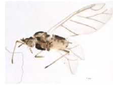
[Lateral] Capitophorus BIN URI: BOLD: ACI9922