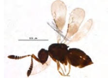
[Lateral] Megaspilidae BIN URI: BOLD:ACH3693