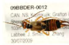
[Dorsal] Forficula auricularia-A BIN URI: BOLD:AAG9897