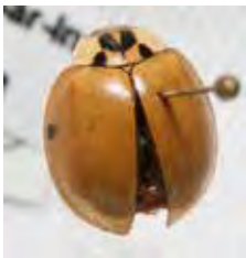
[Dorsal] Coccinellidae BIN URI: BOLD:AAB5640