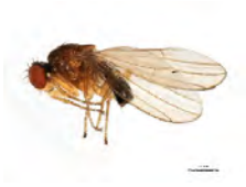
[Lateral] Drosophila BIN URI: BOLD:AAG8493