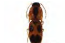
[Dorsal] Aeolus BIN URI: BOLD:ACP9027