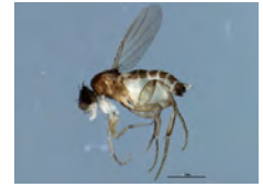
[Lateral] Phoridae BIN URI: BOLD:AAG3248