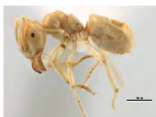
[Lateral] Lasius nearcticus BIN URI: BOLD: AAD1528