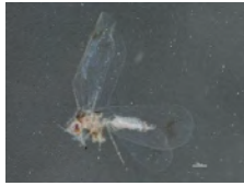
[Lateral] Aleyrodidae BIN URI: BOLD: ACC4413