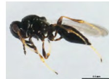
[Lateral] Platygastriidae BIN URI: BOLD:AAU8342