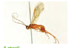
[Lateral] Braconidae BIN URI: BOLD: AAQ2672