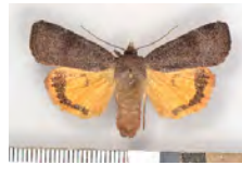
[Dorsal] Noctua comes BIN URI: BOLD:AAA2633