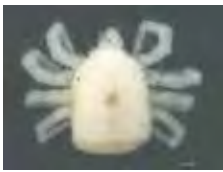
[Dorsal] Anystidae BIN URI: BOLD:AAM7961