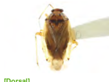
[Dorsal] Lygus lineolaris BIN URI: BOLD: AAA5803