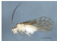
[Lateral] Psocoptera BIN URI: BOLD:AAV8447