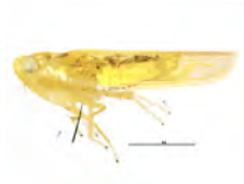
[Lateral] Empoasca BIN URI: BOLD: ABZ4247