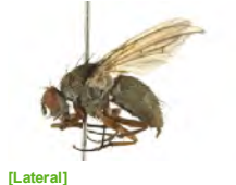
[Lateral] Muscidae BIN URI: BOLD:AAG1711