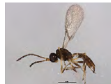
[Lateral] Hymenoptera BIN URI: BOLD: AAU8585