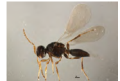
[Lateral] Hymenoptera BIN URI: BOLD:ACK8120