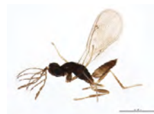
[Lateral] Eulophidae BIN URI: BOLD: AAU8734