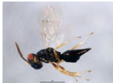
[Lateral] Cecidostiba BIN URI: BOLD:ABW3206