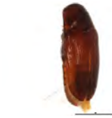
[Dorsal] Paratenetus punctatus BIN URI: BOLD:AAZ0340