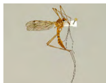
[Lateral] Nephrotoma BIN URI: BOLD:ABX6298