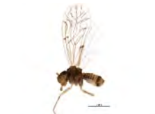
[Lateral] Psocoptera BIN URI: BOLD:AAF1729