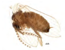
[Lateral] Psychodidae BIN URI: BOLD:AAL7815