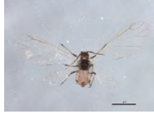
[Dorsal] Rhopalosiphum rufiabdominalis BIN URI: BOLD: AAI0406