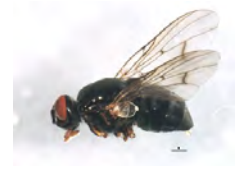
[Lateral] Phaonia BIN URI: BOLD:ABU9891