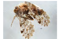
[Lateral] Psocoptera BIN URI: BOLD:ACE6318