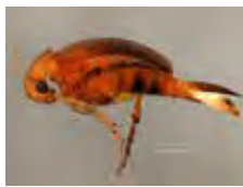
[Lateral] Mordellistena BIN URI: BOLD:AAU7171