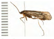
[Lateral] Limnephilus submonilifer BIN URI: BOLD:AAA3080