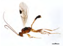
[Lateral] Ichneumonidae BIN URI: BOLD:AAH1901