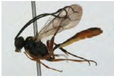
[Lateral] Cymodusa distincta BIN URI: BOLD:ABZ4363