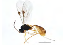
[Lateral] Ichneumonidae BIN URI: BOLD:ABA6173