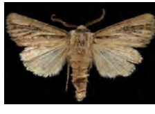
[Dorsal] Agrotis venerabilis BIN URI: BOLD:ABZ1938