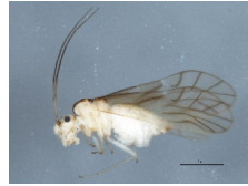
[Lateral] Psocoptera BIN URI: BOLD:AAN8447