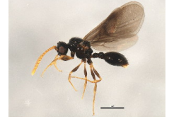
[Lateral] Hymenoptera BIN URI: BOLD:AAC2392