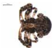
[Dorsal] Ozyptila praticola BIN URI: BOLD:AAZ7413