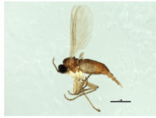
[Lateral] Sciaridae BIN URI: BOLD:ABU5520