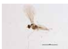
[Lateral] Cecidomyiidae BIN URI: BOLD:ABX7420