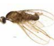
[Lateral] Cecidomyiidae BIN URI: BOLD:ACB9545