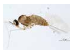
[Lateral] Cecidomyiidae BIN URI: BOLD:AAZ6707