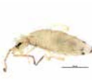
[Lateral] Collembola BIN URI: BOLD:AAA7246