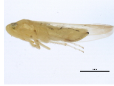
[Lateral] Typhlocyba BIN URI: BOLD:ABA5828