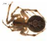
[Dorsal] Theridion murarium BIN URI: BOLD:AAZ6350