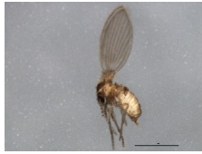
[Lateral] Psychodidae BIN URI: BOLD:AAF9320