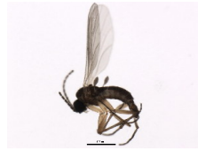
[Lateral] Sciaridae BIN URI: BOLD:ACE3123