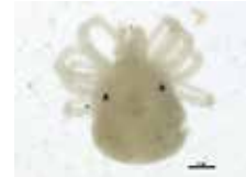
[Dorsal] Anystidae BIN URI: BOLD:ACP8046