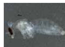
[Lateral] Cecidomyiidae BIN URI: BOLD:AAH3661