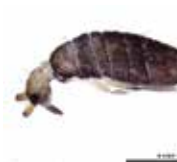
[Lateral] Entomobrya sp. BIN URI: BOLD:AAA7249