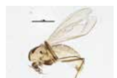
[Lateral] Chironomidae BIN URI: BOLD:AAN5369