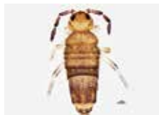
[Dorsal] Lepidocyrtus BIN URI: BOLD:ACM2009