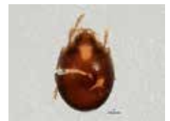
[Dorsal] Trichoribates BIN URI: BOLD:ABZ3529