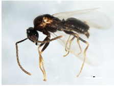
[Lateral] Prenolepis imparis BIN URI: BOLD:AAC1302