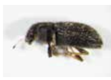
[Dorsal] Sitona hispidulus BIN URI: BOLD:AAH0130