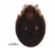
[Dorsal] Trichoribates BIN URI: BOLD:ACL2370