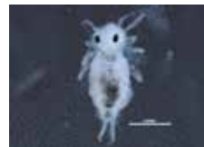
[Dorsal] Bourletiella BIN URI: BOLD:ACL2932