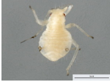
[Dorsal] Periphyllus lyropictus BIN URI: BOLD:AAH2863