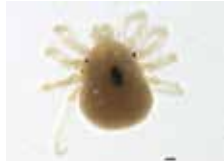
[Dorsal] Anystidae BIN URI: BOLD:ABW5642