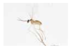
[Lateral] Cecidomyiidae BIN URI: BOLD:AAN5226