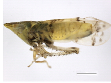
[Lateral] Scaphoideus forceps BIN URI: BOLD:AAY9210