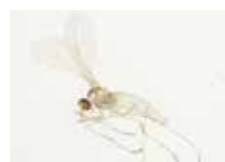
[Lateral] Cecidomyiidae BIN URI: BOLD:AAY6450