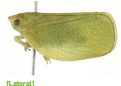
[Lateral] Acanalonia conica BIN URI: BOLD:AAJ5015