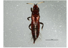
[Dorsal] Haplothrips BIN URI: BOLD:AAG2812