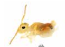
[Lateral] Collembola BIN URI: BOLD:AAB7914