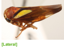
[Lateral] Balcanocerus provancheri BIN URI: BOLD:AAG8834