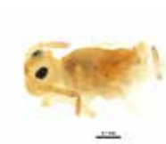
[Lateral] Collembola BIN URI: BOLD:ACC0359