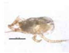
[Dorsal] Phytos eiidae BIN URI: BOLD:ACH4020