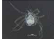
[Dorsal] Anystidae BIN URI: BOLD:ACP7674