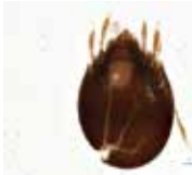
[Dorsal] Trichoribates BIN URI: BOLD:AAF9182