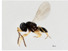
[Lateral] Telenomus BIN URI: BOLD:AAY9194