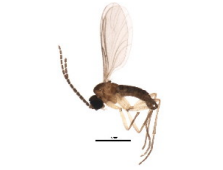
[Lateral] Sciaridae BIN URI: BOLD:ABU5521