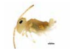
[Lateral] Collembola BIN URI: BOLD:ACE8589