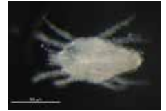
[Lateral] Tydeus BIN URI: BOLD:AAH3904