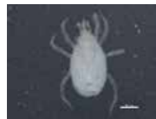
[Dorsal] Phytos eiidae BIN URI: BOLD:ACB9781