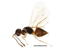
[Lateral] Ooctonus BIN URI: BOLD:AAY9180