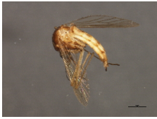
[Lateral] Aedes vexans BIN URI: BOLD:AAA7067