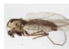
[Lateral] Heterotris socladius BIN URI: BOLD:AAX0836