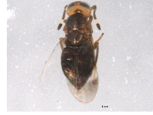
[Lateral] Encyrtidae BIN URI: BOLD:ACQ9467