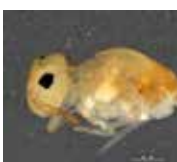
[Lateral] Bourletiella BIN URI: BOLD:AAZ2181