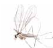
[Lateral] Cecidomyiidae BIN URI: BOLD:ACP8817