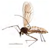
[Lateral] Dixidae BIN URI: BOLD:ACI6982