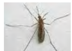
[Dorsal] Culiseta BIN URI: BOLD: AAC9132