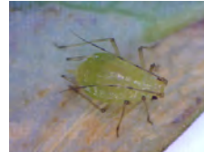
[Dorsal] Wahlgreniella vaccinii BIN URI: BOLD:AAB6874