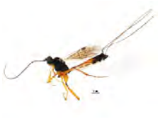
[Lateral] Lissonota coracina BIN URI: BOLD:AAG7794