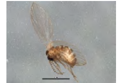
[Lateral] Psychodidae BIN URI: BOLD:AAF9317