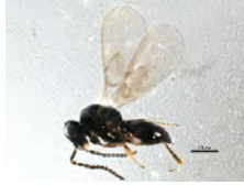
[Lateral] Telenomus BIN URI: BOLD:ACP8654