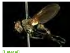
[Lateral] Diptera BIN URI: BOLD: AAG6745