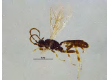
[Lateral] Stenomacrus BIN URI: BOLD:ACE4848