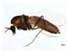
[Lateral] Chironomidae BIN URI: BOLD: ACB0946