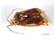
[Dorsal] Lygus plagiatus BIN URI: BOLD:ACF4388