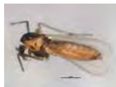
[Lateral] Microspectra nigripila BIN URI: BOLD: ABZ5071