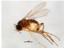
[Lateral] Phoridae BIN URI: BOLD:AAG3255