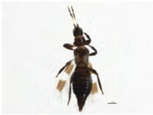
[Dorsal] Aeolothrips BIN URI: BOLD:AAU0577