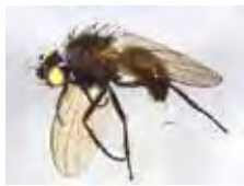
[Lateral] Anthomyiidae BIN URI: BOLD: ACC9953