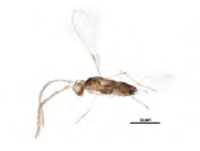
[Lateral] Mymaridae BIN URI: BOLD:ACN6494