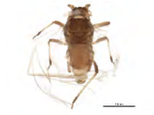
[Dorsal] Rhopalosiphum oxyacanthae BIN URI: BOLD:AAD1504