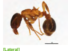
[Lateral] Myrmica BIN URI: BOLD:AAI3346