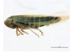
[Lateral] Balclutha BIN URI: BOLD:AAG9373