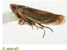
[Lateral] Psammotettix lividellus BIN URI: BOLD:AAG8681