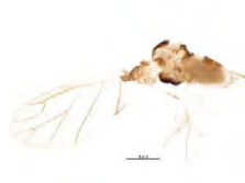
[Lateral] Capitophorus elaeagni BIN URI: BOLD:AAE3015