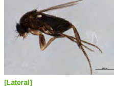
[Lateral] Phoridae BIN URI: BOLD:ABU5529