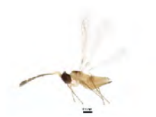
[Lateral] Mymaridae BIN URI: BOLD:ABV9379