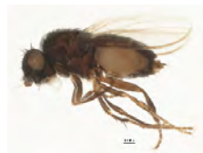
[Lateral] Sphaeroceridae BIN URI: BOLD:ABV1407