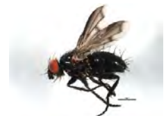
[Lateral] Tachinidae BIN URI: BOLD:AAG2175