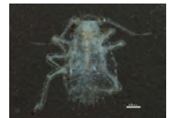
[Dorsal] Chaitophorus populialbae BIN URI: BOLD:AAI4166