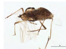
[Lateral] Ceruraphis BIN URI: BOLD:AAI4199