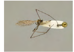
[Lateral] Symplecta BIN URI: BOLD:AAF9014