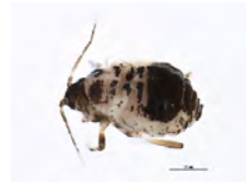
[Lateral] Nearctaphis sensoriata BIN URI: BOLD:AAG3602