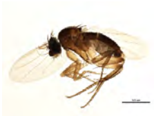
[Lateral] Phoridae BIN URI: BOLD:ACB6729