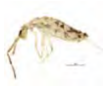
[Lateral] Entomobrya BIN URI: BOLD: ACL6239