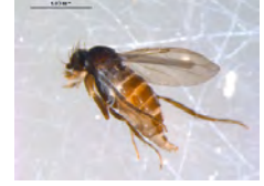
[Lateral] Phoridae BIN URI: BOLD:AAG3266