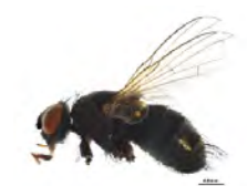
[Lateral] Graphogaster BIN URI: BOLD:ACP7602