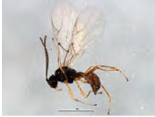
[Lateral] Praon brevistigma BIN URI: BOLD:AAH7424