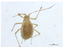
[Dorsal] Acyrtosiphon pisum BIN URI: BOLD:AAB1787