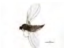
[Lateral] Cecidomyiidae BIN URI: BOLD: ACP9347