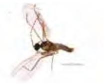
[Lateral] Diptera BIN URI: BOLD: ACE1652