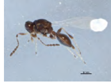
[Lateral] Platygastriinae BIN URI: BOLD:ACD3193