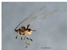
[Lateral] Aphididae BIN URI: BOLD:ACF1560