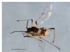
[Lateral] Aphididae BIN URI: BOLD:AAB8566