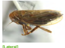
[Lateral] Hardya dentata BIN URI: BOLD:ACP8443