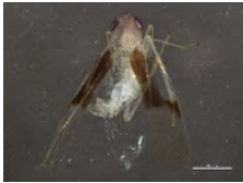
[Dorsal] Empoasca BIN URI: BOLD:ABA5763