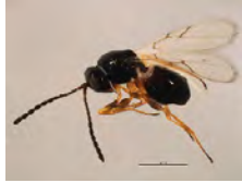
[Lateral] Hymenoptera BIN URI: BOLD:AAP6708