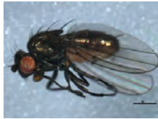
[Lateral] Ephyridae BIN URI: BOLD:AAG2751