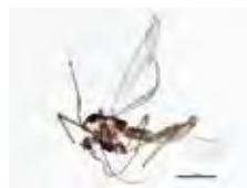
[Lateral] Microspectra polita BIN URI: BOLD: AAC4403