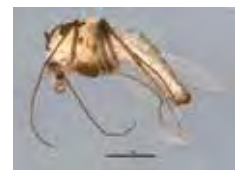
[Lateral] Chironomidae BIN URI: BOLD: ACG3299