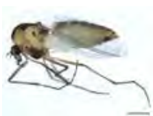
[Lateral] Chironomidae BIN URI: BOLD: AAN4803