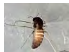
[Dorsal] Chironomidae BIN URI: BOLD: ACP4736