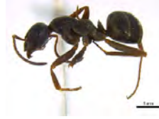
[Lateral] Fomicidae BIN URI: BOLD:AAA4977