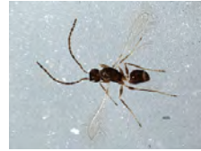
[Lateral] Mymaridae BIN URI: BOLD:ACB6947