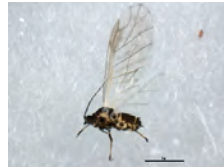
[Lateral] Nearctaphis bakeri BIN URI: BOLD:AAD0902