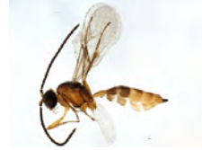
[Lateral] Aphidius ervi BIN URI: BOLD:ACI2531