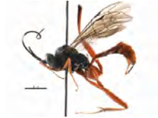
[Lateral] Ichneumonidae BIN URI: BOLD:ACG2110