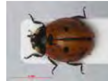
[Dorsal] Coccinella septempunctata BIN URI: BOLD: AAA8933