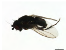
[Lateral] Sphaeroceridae BIN URI: BOLD:AAG7277