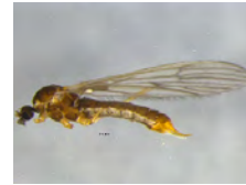
[Lateral] Molophilus sp. BIN URI: BOLD:AAP8637