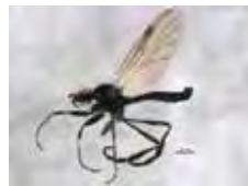
[Lateral] Bibionidae BIN URI: BOLD: ABV0350