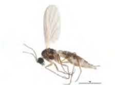
[Lateral] Sciaridae BIN URI: BOLD:AAH3941