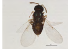
[Lateral] Hymenoptera BIN URI: BOLD:AAU9131