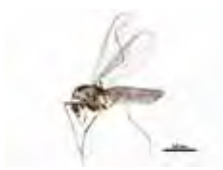
[Lateral] Parametricnemus BIN URI: BOLD: ACI8426