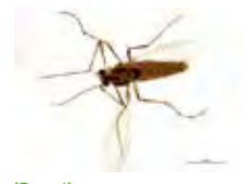
[Dorsal] Orthocladius oblidens BIN URI: BOLD: AAD8971