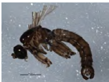
[Lateral] Sciaridae BIN URI: BOLD:ACJ7008