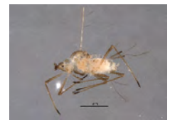
[Lateral] Macrosiphum BIN URI: BOLD:AAI1641