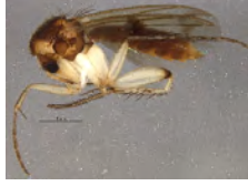
[Lateral] Exechia BIN URI: BOLD:ACD9501