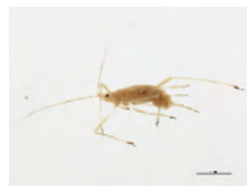
[Lateral] Illinoia spiraeicola BIN URI: BOLD:ACE5456