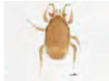
[Dorsal] Cheiroseius BIN URI: BOLD: AAN6642