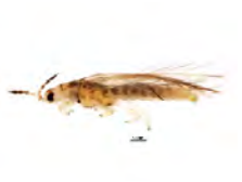
[Lateral] Anaphothrips obscurus BIN URI: BOLD:AAQ0558