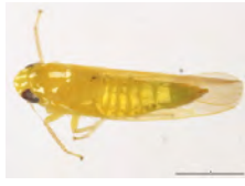
[Lateral] Empoasca BIN URI: BOLD:AAG8850