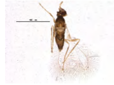
[Dorsal] Mymaridae BIN URI: BOLD:ACP9287