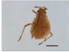
[Dorsal] Rhopalosiphum cerasifoliae BIN URI: BOLD:AAB5408