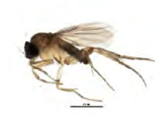
[Lateral] Phoridae BIN URI: BOLD:ABU5528