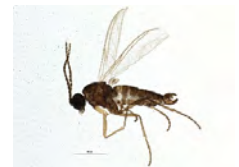
[Lateral] Sciaridae BIN URI: BOLD:ACC5491