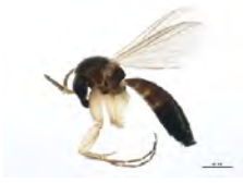
[Lateral] Mycetophilidae BIN URI: BOLD:ABU5545