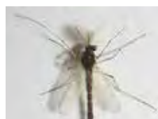
[Dorsal] Chironomidae BIN URI: BOLD: AAN8989