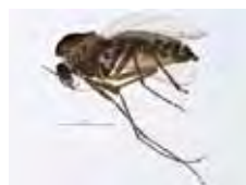
[Lateral] Chironomidae BIN URI: BOLD: ACA8540