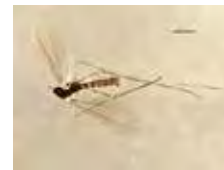
[Dorsal] Cecidomyiidae BIN URI: BOLD: AAP9022