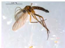
[Lateral] Sciaridae BIN URI: BOLD:AAM9253