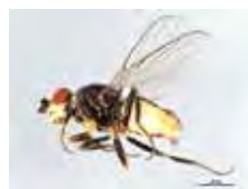
[Lateral] Chloropidae BIN URI: BOLD: AAH4148