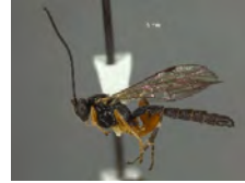
[Lateral] Pimpla hesperus BIN URI: BOLD:AAP6739