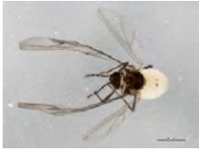
[Dorsal] Pemphigus bursarius BIN URI: BOLD:AAD1826