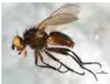
[Lateral] Anthomyiidae BIN URI: BOLD: AAG2465