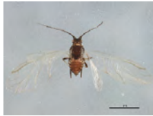
[Dorsal] Myzus cerasi BIN URI: BOLD:AAB2802