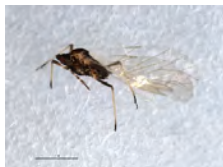
[Lateral] Aphididae BIN URI: BOLD:AAC1165