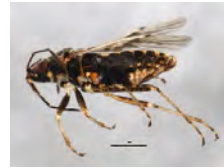
[Lateral] Nysius groenlandicus BIN URI: BOLD:ACE3366