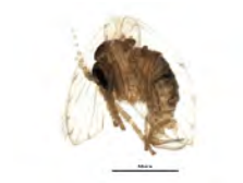
[Lateral] Psychodidae BIN URI: BOLD:AAP4581