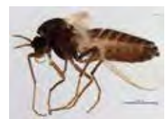
[Lateral] Chironomidae BIN URI: BOLD: AAM7064