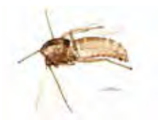
[Lateral] Chironomidae BIN URI: BOLD: ABA6408