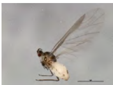
[Lateral] Eriosoma americanum BIN URI: BOLD:AAD7955