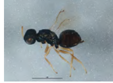
[Lateral] Aphytis BIN URI: BOLD:ABW3280