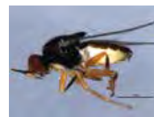
[Lateral] Elachiptera sibirica BIN URI: BOLD: AAH4208