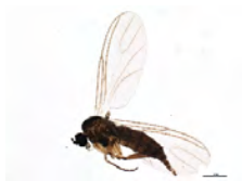
[Lateral] Sciaridae BIN URI: BOLD:AAZ2139