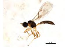
[Lateral] Aphidius BIN URI: BOLD:ACF4786