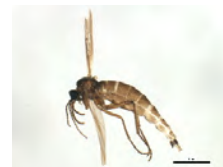
[Lateral] Sciaridae BIN URI: BOLD:AAY6391