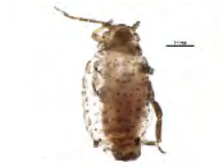
[Dorsal] Nearctaphis BIN URI: BOLD:ACE5867