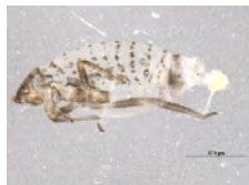
[Lateral] Callipterinella BIN URI: BOLD:ACB2802