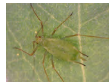
[Dorsal] Macrosiphum euphorbiae BIN URI: BOLD:AAA6213