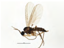
[Lateral] Bradyzia difformis BIN URI: BOLD:AAV1295