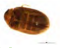
[Dorsal] Cyphon laevipennis BIN URI: BOLD: AAG3633