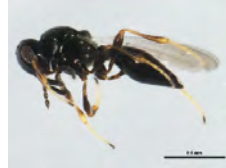
[Lateral] Platygastriidae BIN URI: BOLD:AAU8342