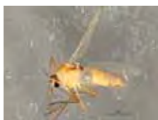
[Lateral] Chironomidae BIN URI: BOLD: AAN5342