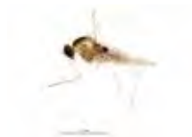
[Lateral] Cecidomyiidae BIN URI: BOLD:ACN7340