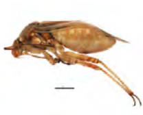
[Lateral] Lygus borealis BIN URI: BOLD:ACF1336