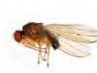
[Lateral] Drosophila BIN URI: BOLD:AAG8493