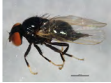
[Lateral] Lonchaeidae BIN URI: BOLD:AAG7072