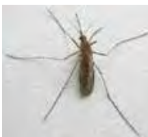
[Dorsal] Culiseta BIN URI: BOLD:AAC9132