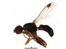
[Lateral] Sepsidae BIN URI: BOLD:AAC2855