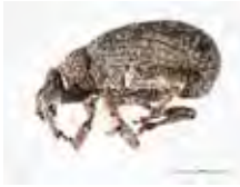
[Lateral] Trachyploeus bifoveolatus BIN URI: BOLD:AAH0270