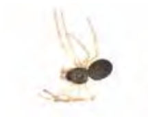
[Dorsal] Erigone aletris BIN URI: BOLD:AAD1746