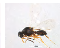
[Lateral] Platygastridae BIN URI: BOLD:ACP7737