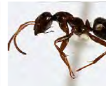
[Lateral] Formica BIN URI: BOLD:AAE0406