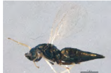
[Lateral] Pteromalidae BIN URI: BOLD:ACG4086