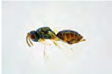
[Lateral] Pteromalidae BIN URI: BOLD:ACI9027