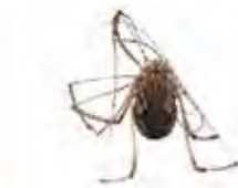
[Dorsal] Phalangium opilio BIN URI: BOLD:AAI4346