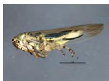
[Lateral] Macrosteles quadrilineatus BIN URI: BOLD:AAA9422