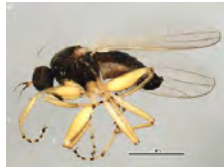
[Lateral] Empididae BIN URI: BOLD:AAF9771