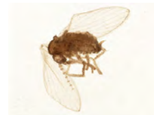
[Lateral] Psychoda sp. BIN URI: BOLD:AAL7819