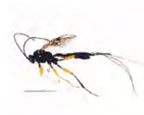
[Lateral] Banchinae BIN URI: BOLD:AAH1851