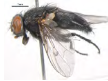
[Lateral] Muscina pascurum BIN URI: BOLD:AAG1714