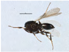
[Lateral] Hymenoptera BIN URI: BOLD:ACI3485