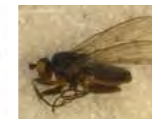
[Lateral] Heleomyzidae BIN URI: BOLD:AAM7341