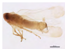
[Lateral] Typhlocyba pomaria BIN URI: BOLD:AAF5980