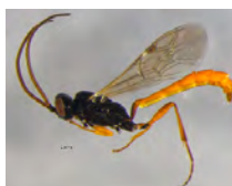
[Lateral] Ichneumonidae BIN URI: BOLD:ACB8824