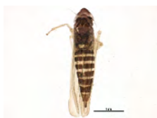
[Dorsal] Hemiptera BIN URI: BOLD:AAO8340