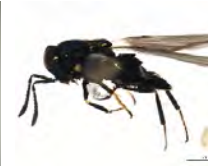
[Lateral] Hymenoptera BIN URI: BOLD:AAG7882