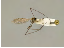
[Lateral] Symplecta BIN URI: BOLD:AAF9014