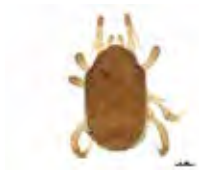
[Dorsal] Cheiroseius BIN URI: BOLD:AAV0589