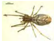
[Dorsal] Tetragnatha laboriosa BIN URI: BOLD:AAA6381