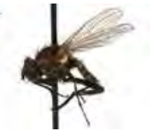
[Lateral] Diptera BIN URI: BOLD:AAA3453