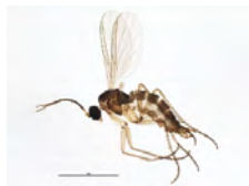
[Lateral] Sciaridae BIN URI: BOLD:ABA6488