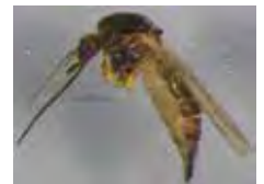
[Lateral] Aedes ventrivittis BIN URI: BOLD:AAW1988