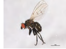
[Lateral] Schoenomyza BIN URI: BOLD:AAG4622