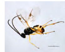
[Lateral] Cotesia jft06 BIN URI: BOLD:AAA8055