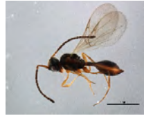
[Lateral] Diapriidae BIN URI: BOLD:ACP9149