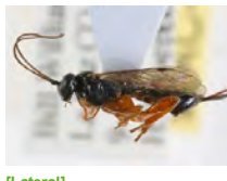
[Lateral] Ichneumonidae BIN URI: BOLD:AAG0383