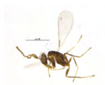
[Lateral] Gonatocerus BIN URI: BOLD:AAG3145