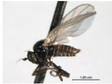
[Lateral] Crossopalpus sp. 1 JMC BIN URI: BOLD:ACE6928