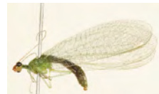
[Lateral] Chrysoperla BIN URI: BOLD:AAB0373