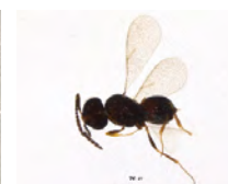
[Lateral] Platygastridae BIN URI: BOLD:ACD1768