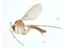
[Lateral] Mycetophilidae BIN URI: BOLD:ABV9018