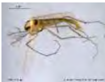
[] Tanytarsus sp. BIN URI: BOLD:AAD2169