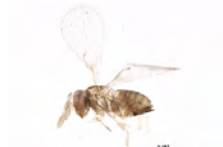
[Lateral] Trichogrammatidae BIN URI: BOLD:ACP8204