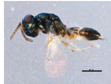
[Lateral] Pteromalidae BIN URI: BOLD:ACI4931