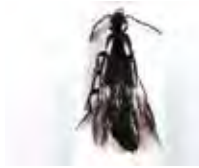
[Dorsal] Philonthus cognatus BIN URI: BOLD:AAL5087