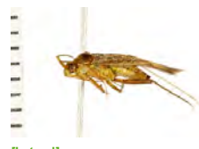
[Lateral] Adelphocoris lineolatus BIN URI: BOLD:ACE7444