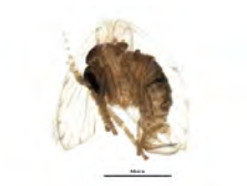
[Lateral] Psychodidae BIN URI: BOLD:AAP4581