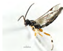
[Lateral] Scambus BIN URI: BOLD:ACP9166