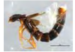
[Lateral] Staphylinidae BIN URI: BOLD:ACI4884