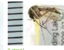
[Lateral] Aedes campestris BIN URI: BOLD:AAD7982