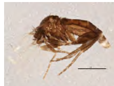
[Lateral] Phoridae BIN URI: BOLD:ABX3085