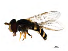
[Lateral] Syrphidae BIN URI: BOLD:AAB2384