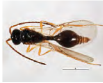
[Dorsal] Diapriidae BIN URI: BOLD:AAU8448