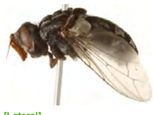
[Lateral] Tachinidae BIN URI: BOLD:ACP9779