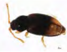
[Dorsal] Atomaria ephippiata BIN URI: BOLD:AAP7030