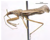
[Lateral] Nabis americanoferus BIN URI: BOLD:AAB8143