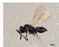
[Lateral] Platygastridae BIN URI: BOLD:ACC5761