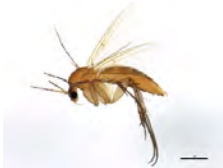
[Lateral] Mycetophilidae BIN URI: BOLD:AAG4905