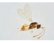
[adult] Myrmariidae BIN URI: BOLD:ACE0609