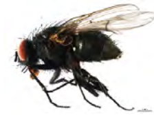
[Lateral] Helina sp. BIN URI: BOLD:AAC2498