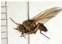
[Lateral] Anthomyiidae BIN URI: BOLD:AAG2451