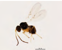
[Lateral] Cynipidae BIN URI: BOLD:AAU9391