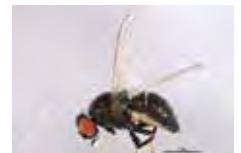
[Lateral] Chamaemyiidae BIN URI: BOLD:ACP7794