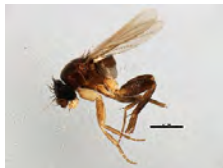
[Lateral] Phoridae BIN URI: BOLD:AAL9075