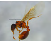
[Lateral] Myrmica BIN URI: BOLD:AAA1848