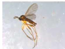
[Lateral] Sciaridae BIN URI: BOLD:AAH3918