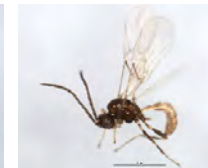
[Lateral] Hymenoptera BIN URI: BOLD:AAG1421