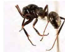
[Lateral] Formica glacialis BIN URI: BOLD:AAA1468