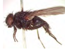
[Lateral] Muscina levida BIN URI: BOLD:AAB8817