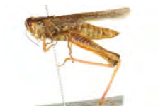
[Lateral] Melanoplus BIN URI: BOLD:AAA4555