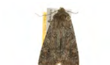
[Dorsal] Euxoa auxiliaris BIN URI: BOLD:ABZ9343