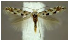
[Dorsal] Phyllonorycter BIN URI: BOLD:AAI2946