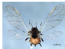
[Dorsal] Hemiptera BIN URI: BOLD:AAB7937