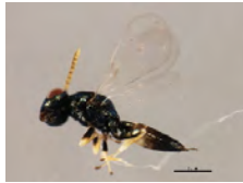
[Lateral] Pteromalus BIN URI: BOLD:AAU9358