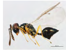
[Lateral] Pteromalidae BIN URI: BOLD:AAG8348