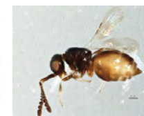
[Lateral] Hymenoptera BIN URI: BOLD:ACD1467