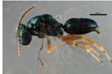
[Lateral] Pteromalidae BIN URI: BOLD:ACP8924