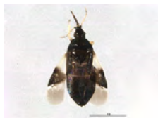
[Dorsal] Orius BIN URI: BOLD:ACI3169