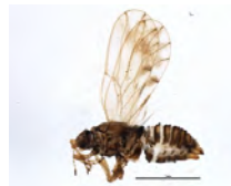
[Lateral] Psyllidae BIN URI: BOLD:ABW7690