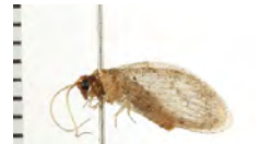
[Lateral] Hemerobius humulinus BIN URI: BOLD:AAG0892