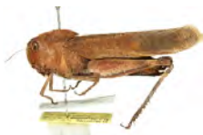
[Lateral] Arphia pseudonietana BIN URI: BOLD:ACE6932