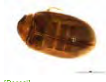
[Dorsal] Cyphon laevipennis BIN URI: BOLD:AAG3633