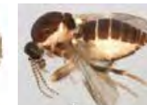
[Lateral] Ceratopogonidae BIN URI: BOLD:AA5148