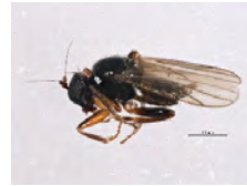
[Lateral] Hybotidae BIN URI: BOLD:AAN5501