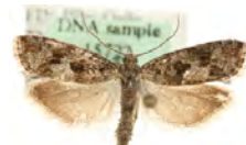
[Dorsal] Zeiraphera griseana BIN URI: BOLD:AAA7907