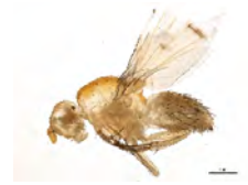
[Lateral] Homoneura BIN URI: BOLD:ACB1411