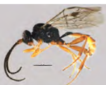
[Lateral] Ichneumonidae BIN URI: BOLD:ACI5367