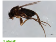
[Lateral] Phoridae BIN URI: BOLD:ABU5529