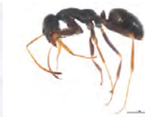
[Lateral] Formica argentea BIN URI: BOLD:AAD8688