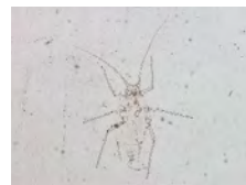
[Dorsal] Capitophorus hippophaes BIN URI: BOLD:AAI3665