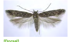
[Dorsal] Scrobipalpa atriplicella BIN URI: BOLD:AAA9251