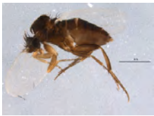
[Lateral] Phoridae BIN URI: BOLD:ABV3315