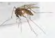
[Lateral] Culex tarsalis BIN URI: BOLD:ABY6040