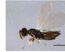
[Lateral] Eulophidae BIN URI: BOLD:ACD3586