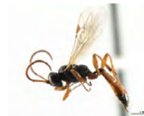
[Lateral] Diadromus subtilicornis BIN URI: BOLD:AAZ7721