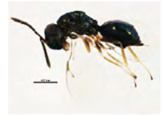
[Lateral] Pteromalidae BIN URI: BOLD:ACF7448