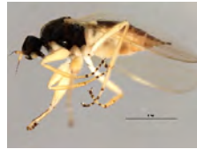
[Lateral] Platypalpus BIN URI: BOLD:AAN5504