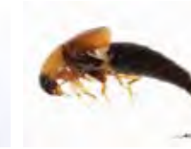
[Lateral] Tachyporus rulomus BIN URI: BOLD:AAP7029