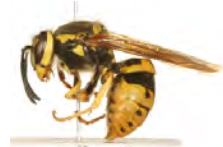
[Lateral] Vespa pennsylvanica BIN URI: BOLD:AAG8042