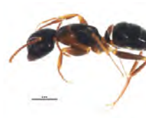
[Lateral] Camponotus americanus BIN URI: BOLD:AAD4432