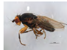
[Lateral] Spelobia ochripes BIN URI: BOLD:AAG7279