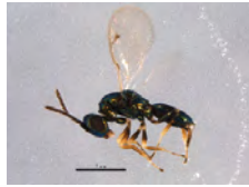
[Lateral] Pteromalus BIN URI: BOLD:AA8215