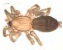
[Dorsal] Drassodes neglectus BIN URI: BOLD:AAD8681