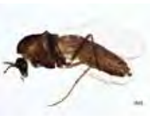
[Lateral] Chironomidae BIN URI: BOLD:ACB0946