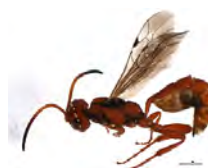
[Lateral] Ichneumoninae BIN URI: BOLD:ACP8664