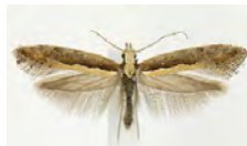
[Dorsal] Plutella xylostella BIN URI: BOLD:AAA1513