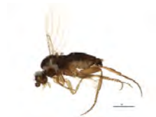
[Lateral] Phoridae BIN URI: BOLD:AAM9355