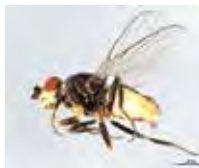
[Lateral] Chloropidae BIN URI: BOLD:AAH4148