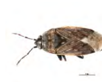
[Dorsal] Pentrechus convivus BIN URI: BOLD:AAF5428