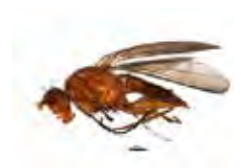
[Lateral] Heleomyzidae BIN URI: BOLD:AAG0460