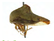
[Lateral] Telamona viridia BIN URI: BOLD:AAV0268