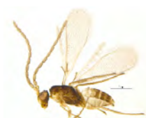
[Lateral] Gonatocerus BIN URI: BOLD:AAG1488