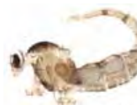
[Lateral] Cecidomyiidae BIN URI: BOLD:ACP8260