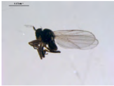
[Lateral] Crossopalpus BIN URI: BOLD:ABZ0555