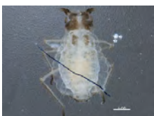
[Dorsal] Chaitophorus BIN URI: BOLD:AAH2856