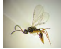
[Lateral] Belytinae sp. MAS BIN584 BIN URI: BOLD:AAJ8191