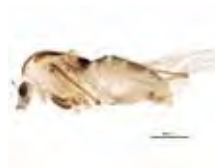
[Lateral] Orthoclaadiinae BIN URI: BOLD:ACP9563