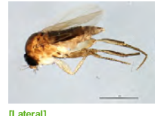
[Lateral] Phoridae BIN URI: BOLD:AAG3241