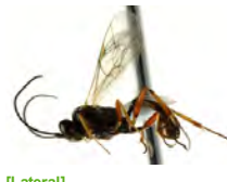
[Lateral] Camponotus flavicincta