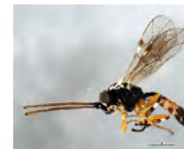
[Lateral] Hymenoptera BIN URI: BOLD:AAD4214