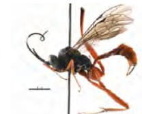
[Lateral] Ichneumonidae BIN URI: BOLD:ACG2110