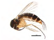
[Lateral] Mycetophilidae BIN URI: BOLD:ACP9036