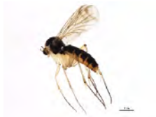
[Lateral] Mycetophilidae BIN URI: BOLD:AAL9137