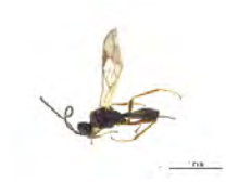
[Lateral] Hymenoptera BIN URI: BOLD:AAU8584