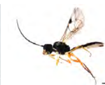
[Lateral] Acrotomus succinctus BIN URI: BOLD:AAH2187