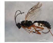
[Lateral] Cryptinae BIN URI: BOLD:ACN4204