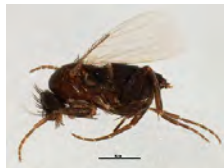
[Lateral] Phoridae BIN URI: BOLD:AAG3303