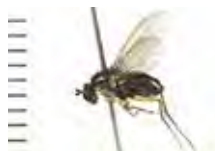
[Lateral] Dolichopodidae BIN URI: BOLD:AAG9630