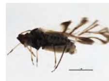
[Lateral] Chaitophorus populicola BIN URI: BOLD:AAA1279