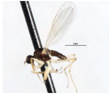
[Lateral] Platypalpus unguiculatus BIN URI: BOLD:ABA0579