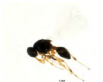
[Lateral] Platygasteridae BIN URI: BOLD:AAG7883