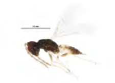
[Lateral] Hymenoptera BIN URI: BOLD:AAU8565