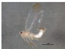
[Lateral] Typhlocyba pomaria BIN URI: BOLD:ACP8661