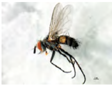
[Lateral] Tachinidae BIN URI: BOLD:AAH6458