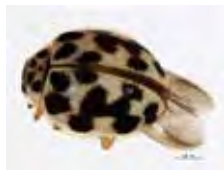
[Dorsal] Psyllobora vigintimaculata BIN URI: BOLD: AAH3320