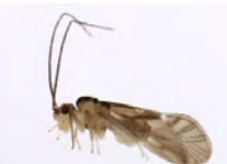
[Lateral] Psocoptera BIN URI: BOLD:AAH3228