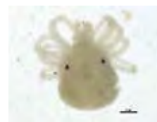
[Dorsal] Anystidae BIN URI: BOLD: ACP8046