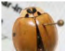
[Dorsal] Coccinellidae BIN URI: BOLD: AAB5640