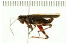
[Lateral] Melanoplus BIN URI: BOLD:ACF0478