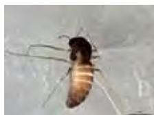
[Dorsal] Chironomidae BIN URI: BOLD: ACP4736