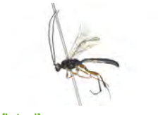
[Lateral] Ichneumonidae BIN URI: BOLD:AAG7697