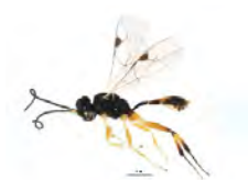
[Lateral] Ichneumonidae BIN URI: BOLD:AAU9311