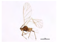
[Lateral] Rhopalosiphum nymphaeae BIN URI: BOLD:AAE3554