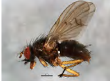
[Lateral] Muscidae BIN URI: BOLD:ACE9475