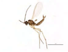
[Lateral] Sciaridae BIN URI: BOLD:AAH6447