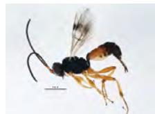
[Lateral] Ichneumonidae BIN URI: BOLD:AAW0431