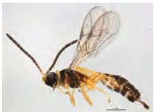
[Lateral] Hymenoptera BIN URI: BOLD:AAZ8195