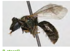
[Lateral] Lasioglossum BIN URI: BOLD:AAA3782