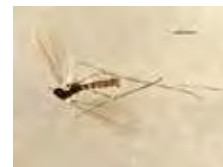
[Dorsal] Cecidomyiidae BIN URI: BOLD: AAP9022