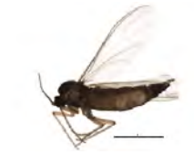
[Lateral] Sciaridae BIN URI: BOLD:AAH6770