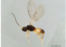
[Lateral] Braconidae BIN URI: BOLD:AAQ2892