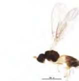
[Lateral] Dinotrema JFT01 BIN URI: BOLD:ACE5710