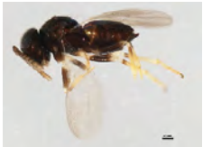
[Lateral] Hymenoptera BIN URI: BOLD:AAZ9201