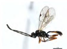
[Lateral] Cryptinae sp. MAS BIN URI: BOLD:AAE9438