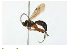
[Lateral] Pimplinae BIN URI: BOLD:AAG0387