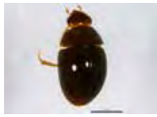
[Dorsal] Phalacridae BIN URI: BOLD: AAG4848