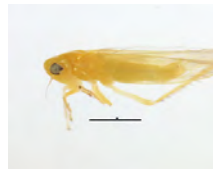
[Lateral] Empoasca decipiens BIN URI: BOLD:AAV6741