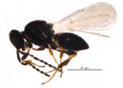
[Lateral] Synopeas BIN URI: BOLD:ACP8937