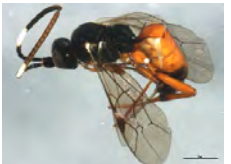
[Lateral] Oresbius taeniatus BIN URI: BOLD:AAH1683