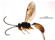
[Lateral] Cryptinae BIN URI: BOLD:ACP8184