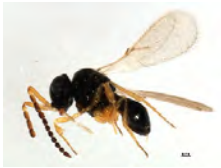
[Lateral] Telenomus BIN URI: BOLD:AA9192