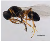
[Lateral] Hymenoptera BIN URI: BOLD:AAU8566