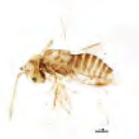
[Lateral] Aphelinidae BIN URI: BOLD:ABA5901