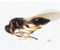
[Lateral] Hymenoptera BIN URI: BOLD:AAG8271