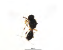
[Dorsal] Hymenoptera BIN URI: BOLD:ABZ8208