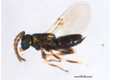
[Lateral] Copidosoma BIN URI: BOLD:AAZ0163