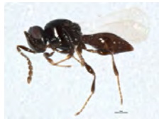
[Lateral] Hymenoptera BIN URI: BOLD:AAG7880