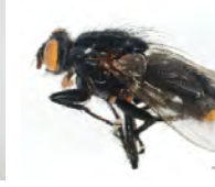
[Lateral] Boettcheria cimbicis BIN URI: BOLD:AAG6756