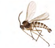
[Lateral] Sciaridae BIN URI: BOLD:ABA6407