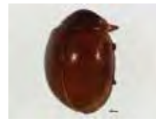
[Dorsal] Coccinellidae BIN URI: BOLD: AAP7830