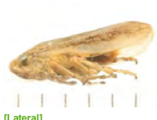
[Lateral] Philaenus spumarius BIN URI: BOLD:AAB1850