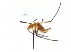
[Lateral] Uroleucon luteolum BIN URI: BOLD:AAG5616