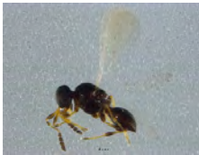
[Lateral] Synopeas BIN URI: BOLD:ABW3162