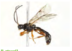
[Lateral] Exochus BIN URI: BOLD:ABV3623