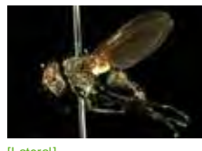
[Lateral] Diptera BIN URI: BOLD: AAG6745