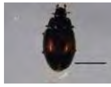
[Dorsal] Scymnus BIN URI: BOLD: ACP8868