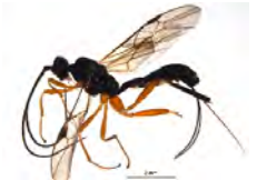
[Lateral] Meteorinae BIN URI: BOLD:ACP9133