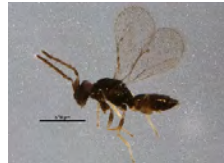
[Lateral] Tetrastichinae BIN URI: BOLD:ACP9071