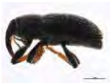
[Lateral] Tychius picrostris BIN URI: BOLD: AAP7027