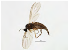
[Lateral] Lycoriella castanescens BIN URI: BOLD:ABA1215