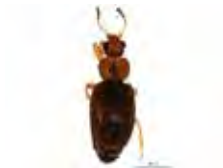
[Dorsal] Corticarina BIN URI: BOLD: AAH0256