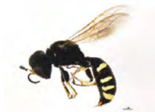
[Lateral] Hymenoptera BIN URI: BOLD:AAG3199