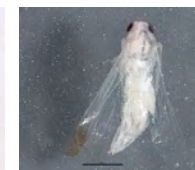
[Dorsal] Typhlocyba BIN URI: BOLD:ACJ7184