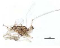
[Lateral] Eulachnus agilis BIN URI: BOLD:ACF4455