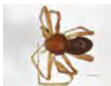
[Dorsal] Philodromus mineri BIN URI: BOLD: AAL5085