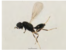
[Lateral] Telenomus BIN URI: BOLD:AA8098