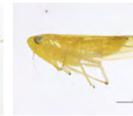
[Lateral] Empoasca BIN URI: BOLD:AAG2873