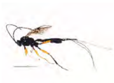
[Lateral] Banchinae BIN URI: BOLD:AAH1851