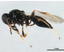
[Lateral] Platygasteridae BIN URI: BOLD:AAU8342