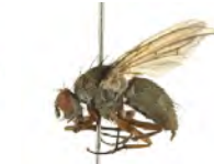
[Lateral] Muscidae BIN URI: BOLD:AAG1711