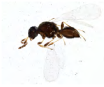
[Lateral] Synopeas BIN URI: BOLD:ACI7205