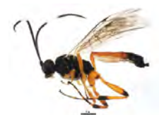
[Lateral] Ichneumoninae BIN URI: BOLD:AAG7695