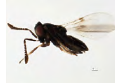
[Lateral] Hymenoptera BIN URI: BOLD:AAZ7203