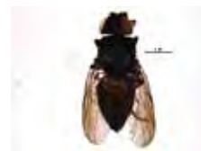
[Dorsal] Chloropidae BIN URI: BOLD: ACP8274