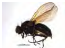
[Lateral] Hydrophoria BIN URI: BOLD: ACP7357