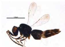
[Lateral] Megaspilidae BIN URI: BOLD:ACP9398