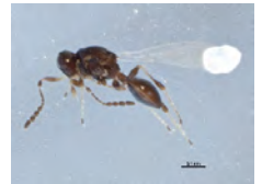
[Lateral] Platygasterinae BIN URI: BOLD:ACD3193