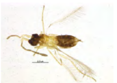
[Lateral] Anagrus BIN URI: BOLD:ABZ2703