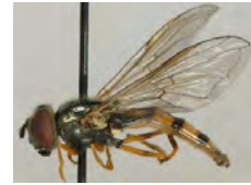
[Lateral] Platycheirus immarginatus BIN URI: BOLD:AAA9506