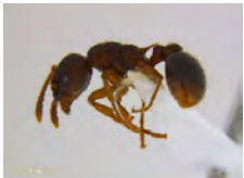
[Lateral] Myrmica AF-smi BIN URI: BOLD:AAA1840