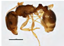
[Lateral] Tetramorium caespitum BIN URI: BOLD:AAB8259