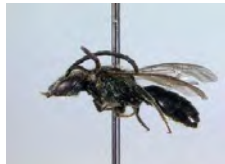
[Lateral] Lasioglossum laevisimum BIN URI: BOLD:AAA7513