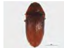
[Dorsal] Trixagus BIN URI: BOLD: ABW2869