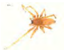
[Dorsal] Cheiracanthium mildei BIN URI: BOLD: AAB7601