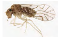
[Lateral] Psocoptera BIN URI: BOLD:ABA6550