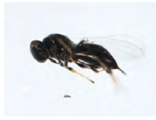
[Lateral] Synopeas BIN URI: BOLD:AAG7958