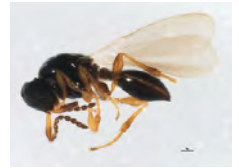
[Lateral] Platygasteridae BIN URI: BOLD:AAU8717