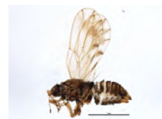
[Lateral] Psyllidae BIN URI: BOLD:ABW7690