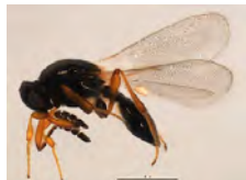
[Lateral] Amblyaspis BIN URI: BOLD:AAU8575