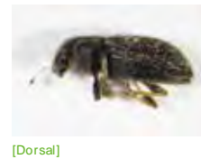
[Dorsal] Sitona hispidulus BIN URI: BOLD: AAH0130