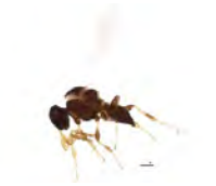
[Lateral] Synopeas BIN URI: BOLD:ABW3265