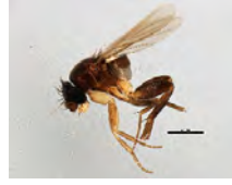
[Lateral] Phoridae BIN URI: BOLD:AAL9075