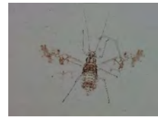
[Dorsal] Myzocallis asclepiadis BIN URI: BOLD:AAE3464