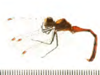
[Lateral] Sympetrum obtusum BIN URI: BOLD:AAA5224