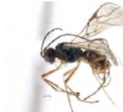
[Lateral] Braconidae BIN URI: BOLD:ABA6301