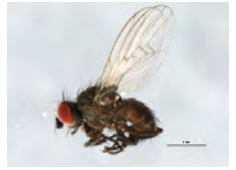
[Lateral] Schoenomyza BIN URI: BOLD:AAG1777