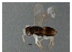
[Lateral] Aphelinus varipes BIN URI: BOLD:ABW3282