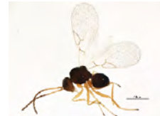
[Lateral] Alloxysta BIN URI: BOLD:ACK3704