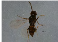
[Dorsal] Tetrastichinae BIN URI: BOLD:ACP8361