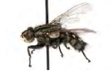
[Lateral] Diptera BIN URI: BOLD:AAG6743