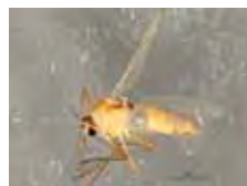
[Lateral] Chironomidae BIN URI: BOLD: AAN5342