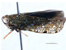
[Lateral] Orientus ishidae BIN URI: BOLD:ABX2622