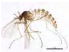
[Lateral] Cecidomyiidae BIN URI: BOLD: ABA6448