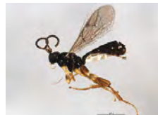
[Lateral] Hymenoptera BIN URI: BOLD:AAM7494