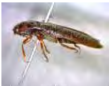
[Lateral] Enoclerus nigripes rufiventris BIN URI: BOLD: AAU6970