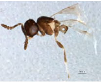
[Lateral] Telenomus BIN URI: BOLD:ABW3189