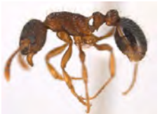
[Lateral] Myrmicinae BIN URI: BOLD:ABZ0938