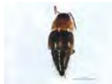
[Dorsal] Tachyporus atriceps BIN URI: BOLD: ABX2484