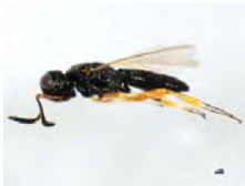
[Lateral] Platygasteridae BIN URI: BOLD:ABV2752