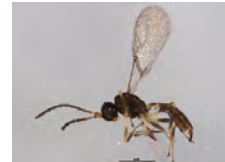
[Lateral] Hymenoptera BIN URI: BOLD:AAU8585