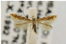
[Dorsal] Cremastobombicia solidaginis BIN URI: BOLD:AAC4262