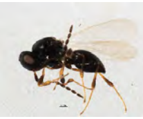
[Lateral] Synopeas BIN URI: BOLD:AAU8605