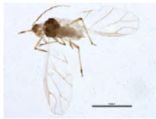
[Lateral] Schizaphis graminum BIN URI: BOLD:ACI4702