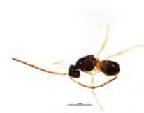
[Lateral] Cynipidae BIN URI: BOLD:ABA5904