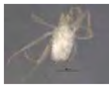
[Dorsal] Anystidae BIN URI: BOLD: ACP8731