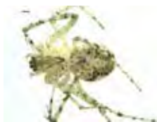
[Dorsal] Mimetus notius BIN URI: BOLD: AAE0114