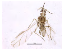
[Dorsal] Aphididae BIN URI: BOLD:ACI4644