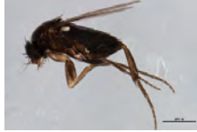
[Lateral] Phoridae BIN URI: BOLD:ABU5529