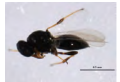
[Lateral] Synopeas BIN URI: BOLD:AAU8671