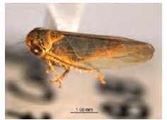
[Lateral] Grypotes puncticollis BIN URI: BOLD:ACL2777