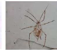
[Dorsal] Uroleucon anomalae BIN URI: BOLD:AAF8506