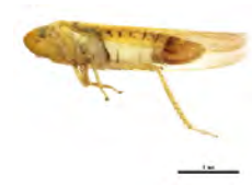
[Lateral] Forcipata loca BIN URI: BOLD:ACC8165