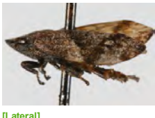
[Lateral] Cercopidae BIN URI: BOLD:AAG8827