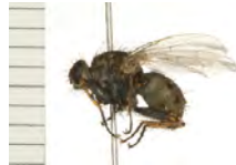
[Lateral] Coenosia tigrina BIN URI: BOLD:AAB5609