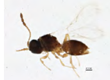
[Lateral] Hymenoptera BIN URI: BOLD:AAU8618