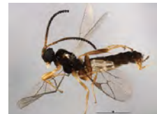
[Lateral] Hymenoptera BIN URI: BOLD:AAP6689