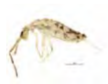
[Lateral] Entomobrya BIN URI: BOLD: ACL6239