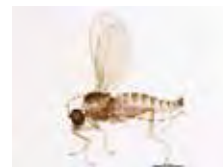
[Lateral] Cecidomyiidae BIN URI: BOLD: ABV1222