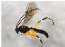
[Lateral] Hymenoptera BIN URI: BOLD:AAD5194