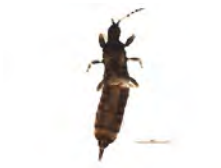
[Dorsal] Phlaeothripidae BIN URI: BOLD:AA8719