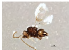
[Lateral] Megaspilidae BIN URI: BOLD:ACC7176