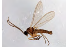
[Lateral] Sciaridae BIN URI: BOLD:AAH3939