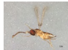
[Lateral] Anagrus BIN URI: BOLD:AAU9004