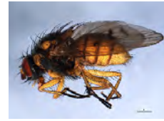
[Lateral] Muscidae BIN URI: BOLD:AAG1717