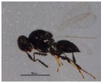
[Lateral] Platygasteridae BIN URI: BOLD:ACP7995