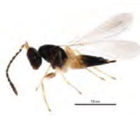
[Lateral] Gonatocerus morrilli BIN URI: BOLD:AAU9165