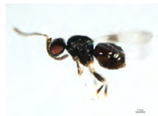
[Lateral] Hymenoptera BIN URI: BOLD:ABV2750