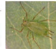
[Dorsal] Macrosiphum euphorbiae BIN URI: BOLD:AAA6213