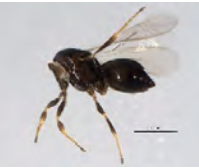
[Lateral] Telenomus BIN URI: BOLD:AAU8578