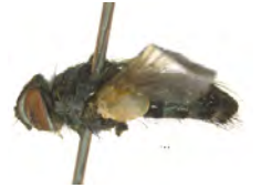
[Lateral] Oswaldia assimilis BIN URI: BOLD:AAZ4669