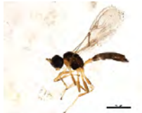
[Lateral] Aphidius BIN URI: BOLD:ACF4786