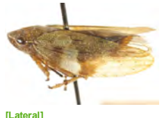
[Lateral] Aphrophora alni BIN URI: BOLD:AAZ2091