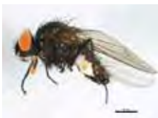
[Lateral] Delia platyura BIN URI: BOLD: AAG2511