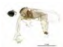
[Lateral] Cecidomyiidae BIN URI: BOLD: AAZ5600