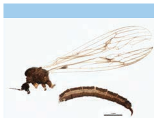
[Lateral] Trichocera BIN URI: BOLD:ACF7745