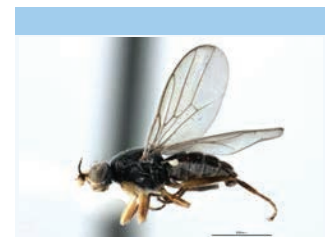
[Lateral] Echiptera californica BIN URI: BOLD:AAH4164