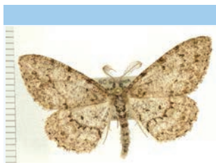
[Dorsal] Protobernia porcelaria BIN URI: BOLD:AAA2077