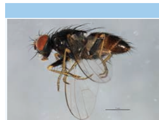
[Lateral] Lispocephala erythrocerata BIN URI: BOLD:AAG1704