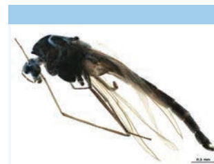
[Lateral] Orthocladiinae BIN URI: BOLD:ACU9084