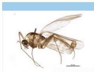
[Lateral] Chironomidae BIN URI: BOLD:ABA6465