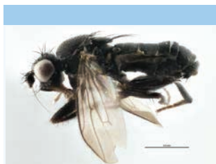
[Lateral] Apteromyia claviventris BIN URI: BOLD:AAG7283