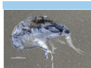
[Lateral] Entomobryidae BIN URI: BOLD:ACF6367