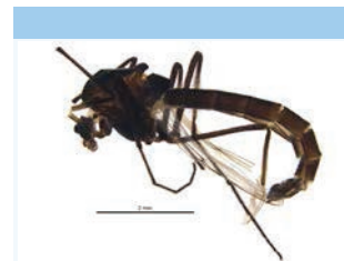
[Lateral] Phoridae BIN URI: BOLD:AAG3326