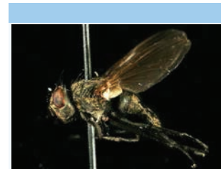
[Lateral] Diptera BIN URI: BOLD:AAG6745