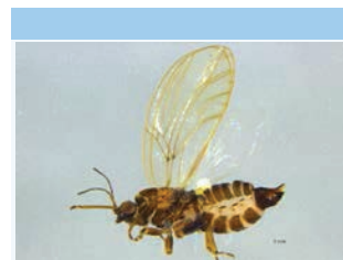
[Lateral] Psyllidae BIN URI: BOLD:ACC5187