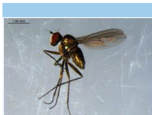
[Lateral] Campsicnemus sp. SEB1 BIN URI: BOLD:AAG9637