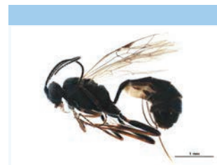
[Lateral] Campopleginae BIN URI: BOLD:ACU4400