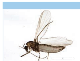
[Lateral] Chironomidae BIN URI: BOLD:ACK4694