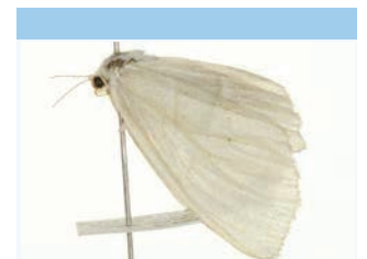
[Lateral] Campaea perlata BIN URI: BOLD:AAA2078