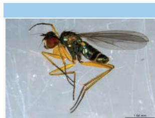
[Lateral] Campsicnemus alexanderi BIN URI: BOLD:AAG9638