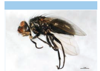
[Lateral] Pollenia rudis BIN URI: BOLD:AAH3035