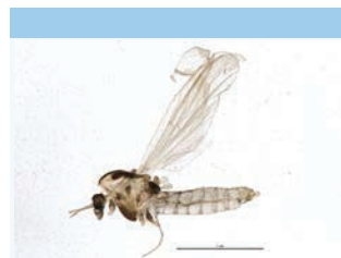
[Lateral] Chironomidae BIN URI: BOLD:ACF6271