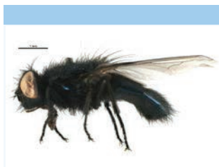
[Lateral] Protophormia terraenovae BIN URI: BOLD:AAC9614