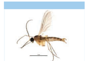
[Lateral] Sciariidae BIN URI: BOLD:ABA0929