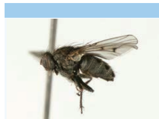
[Lateral] Lispocephala alma BIN URI: BOLD:AAE3275