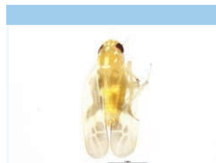
[Dorsal] Empoasca BIN URI: BOLD:AAV0166