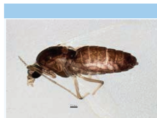
[Lateral] Chironomidae BIN URI: BOLD:ACP4736