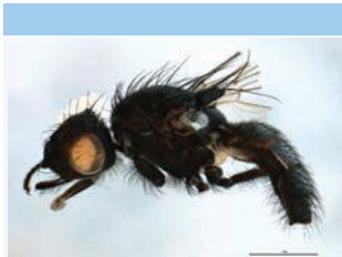
[Lateral] Egle BIN URI: BOLD:AAI6224