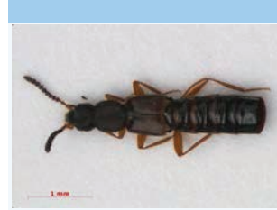
[Dorsal] Dinaraea aequata BIN URI: BOLD:AAM0420