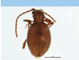
[Dorsal] Ptinus BIN URI: BOLD:ACF8154