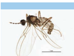
[Lateral] Cecidomyiidae BIN URI: BOLD:ABX8104