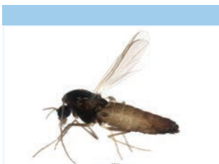
[Lateral] Limnophyes BIN URI: BOLD:AAN5339