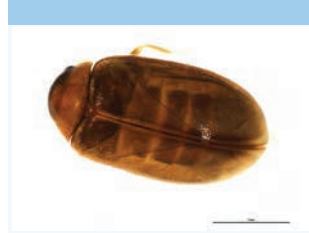
[Dorsal] Cyphon laevipennis BIN URI: BOLD:AAG3633