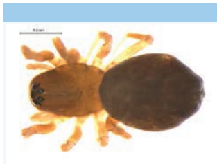
[Dorsal] Tapinocyba simplex BIN URI: BOLD:AAD3796

The images of the species collected in your Malaise trap are shown below. A single representative from each species was selected to be photographed; in some cases, only a damaged specimen was available.