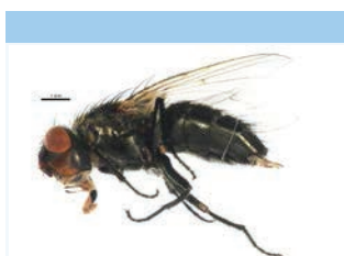
[Lateral] Pollenia rudis BIN URI: BOLD:AAP2825