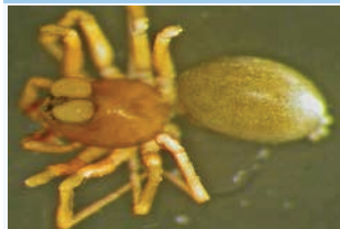
[Dorsal] Thyreosthenius biovatus BIN URI: BOLD:AA7604