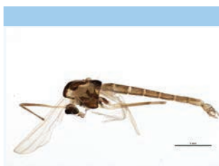
[Lateral] Chironomidae BIN URI: BOLD:AAQ0602