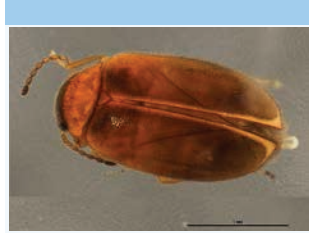
[Dorsal] Cyphon BIN URI: BOLD:AAU7169