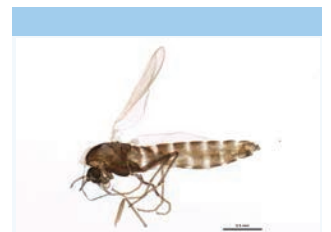
[Lateral] Chironomidae BIN URI: BOLD:AAN5356