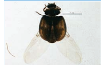
[Dorsal] Scymnus suturalis BIN URI: BOLD:AAP8242