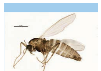
[Lateral] Chironomidae BIN URI: BOLD:AAI4195