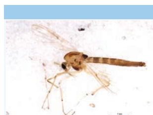
[Lateral] Chironomus maturus BIN URI: BOLD:AAB4657