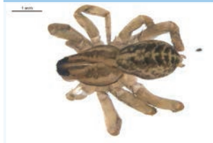
[Dorsal] Piratula cantralli BIN URI: BOLD:ABZ5613