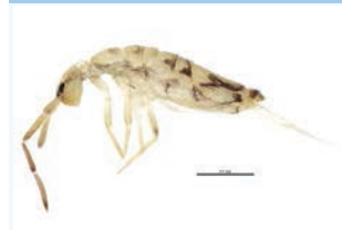
[Lateral] Entomobrya BIN URI: BOLD:ACL6239