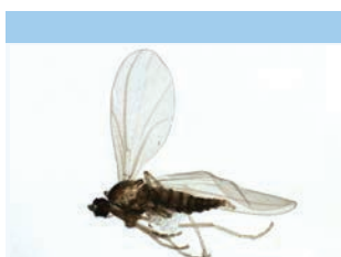
[Lateral] Micromyiinae BIN URI: BOLD:ACL2290