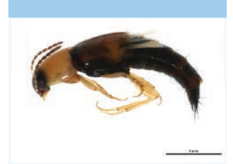
[Lateral] Tachyporus chrysomelinus BIN URI: BOLD:AAN9511