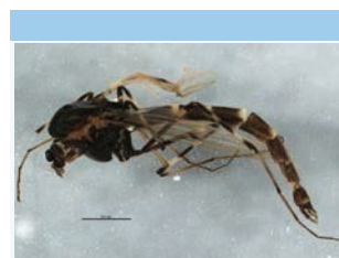
[Lateral] Chironomidae BIN URI: BOLD:AAQ3439