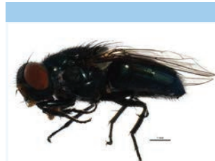
[Lateral] Phormia regina BIN URI: BOLD:AAB9140