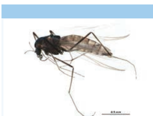
[Lateral] Chironomidae BIN URI: BOLD:ACJ4457