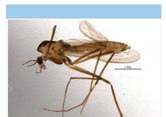
[Lateral] Chironomidae BIN URI: BOLD:ACF8488