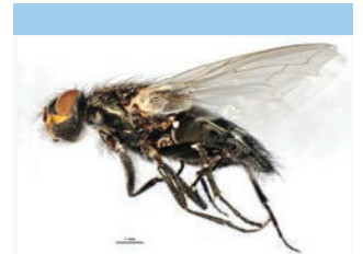
[Lateral] Pollenia vagabunda BIN URI: BOLD:AAH3040