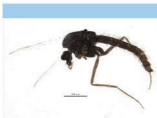
[Lateral] Metricnemus BIN URI: BOLD:ACJ5126