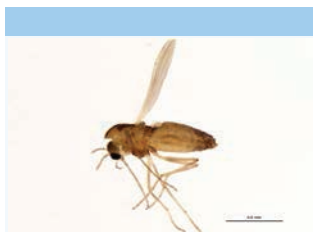
[Lateral] Limnophyes BIN URI: BOLD:ABU5525