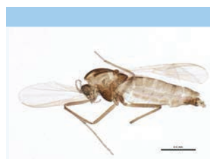
[Lateral] Gymnometricnemus brumalis BIN URI: BOLD:AAP6873