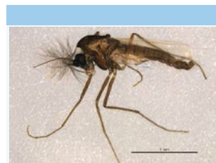
[Lateral] Orthoclaadiinae BIN URI: BOLD:ACL2257