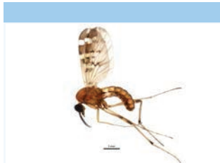
[Lateral] Anisopodidae BIN URI: BOLD:AAG2000