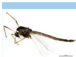
[Lateral] Chironomidae BIN URI: BOLD:AAM6284