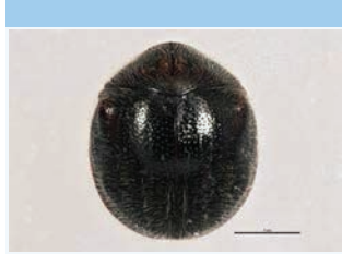
[Lateral] Caenocara BIN URI: BOLD:ACF8151