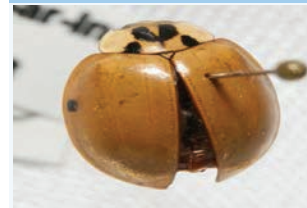
[Dorsal] Coccinellidae BIN URI: BOLD:AAB5640