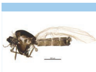
[Lateral] Chironomidae BIN URI: BOLD:ACJ5397