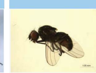
[Lateral] Lasiomma nr. picipes BIN URI: BOLD:AAL7525