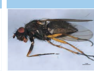
[Lateral] Hylemya sp. Schuehli 28.iv.01 BIN URI: BOLD:AAP2967