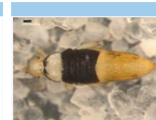
[Dorsal] Entomobryidae BIN URI: BOLD:AAI2660