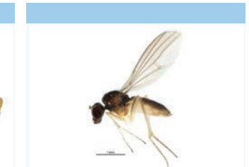
[Lateral] Dolichopodidae BIN URI: BOLD:AAG9713