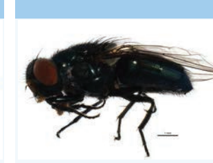
[Lateral] Phormia regina BIN URI: BOLD:AAB9140