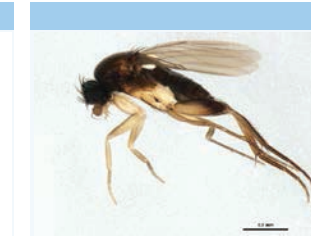
[Lateral] Phoridae BIN URI: BOLD:AAI8693