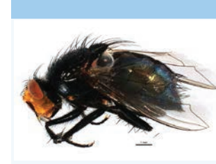
[Lateral] Cynomya mortuorum BIN URI: BOLD:AAB0868