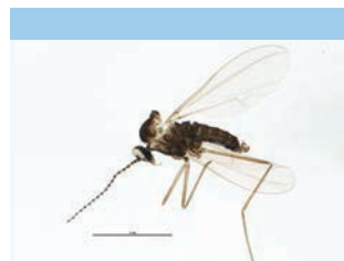
[Lateral] Cecidomyiidae BIN URI: BOLD:ACF6376