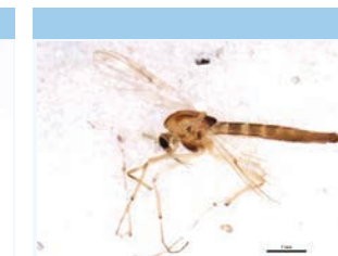
[Lateral] Chironomus maturus BIN URI: BOLD:AAB4657