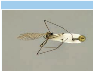
[Lateral] Symplecta BIN URI: BOLD:AAF9014