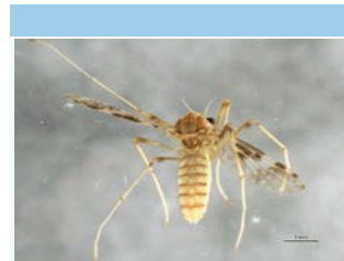
[Lateral] Psectrotanypus sp. ES01 BIN URI: BOLD:AAG0314