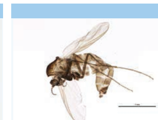
[Lateral] Bryophaenodadius sp. 8ES BIN URI: BOLD:AAG1021