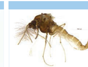
[Lateral] Chironomidae BIN URI: BOLD:ACP6694