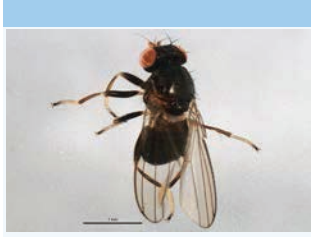
[Dorsal] Aulacigaster BIN URI: BOLD:ABV3853