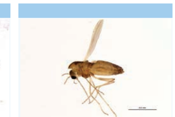
[Lateral] Limnophyes BIN URI: BOLD:ABU5525