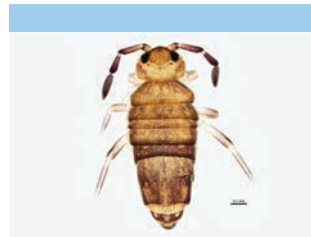
[Dorsal] Lepidocyrtus BIN URI: BOLD:ACM2009