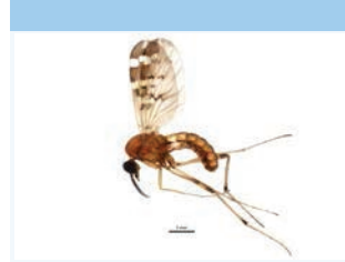
[Lateral] Anisopodidae BIN URI: BOLD:AAG2000