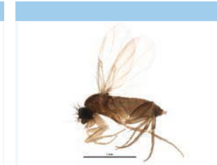
[Lateral] Phoridae BIN URI: BOLD:AAG3274