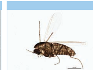
[Lateral] Smittia BIN URI: BOLD:ACA2638