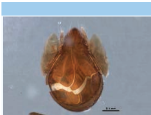
[Dorsal] Parakalummidae BIN URI: BOLD:ACI7088

The images of the species collected in your Malaise trap are shown below. A single representative from each species was selected to be photographed; in some cases, only a damaged specimen was available.