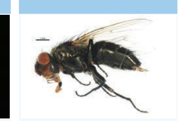
[Lateral] Pollenia rudis BIN URI: BOLD:AAP2825