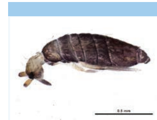
[Lateral] Entomobrya sp. BIN URI: BOLD:AAA7249