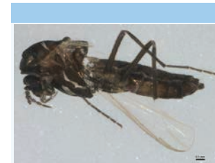
[Lateral] Smittia BIN URI: BOLD:AAI5355