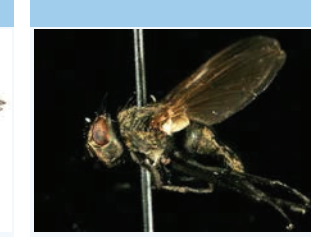
[Lateral] Diptera BIN URI: BOLD:AAG6745