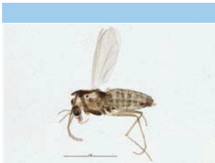
[Lateral] Limnophyes BIN URI: BOLD:ABW2734