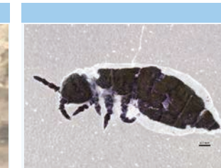
[Lateral] Poduromorpha BIN URI: BOLD:AAA4811