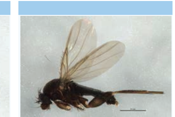
[Lateral] Phoridae BIN URI: BOLD:ABA1225