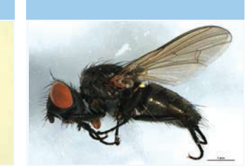
[Lateral] Anthomyiidae BIN URI: BOLD:ABW1310