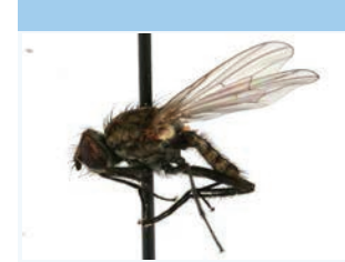
[Lateral] Diptera BIN URI: BOLD:AAA3453