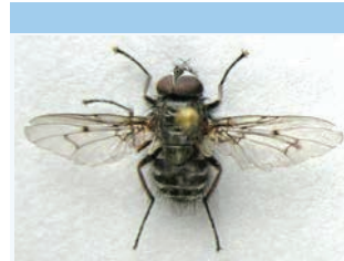
[Dorsal] Diptera BIN URI: BOLD:AAG1742