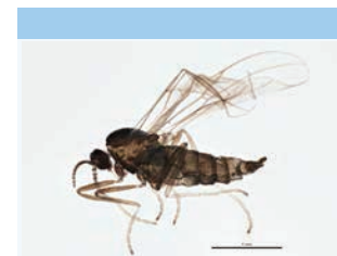
[Lateral] Cecidomyiidae BIN URI: BOLD:ABA1223