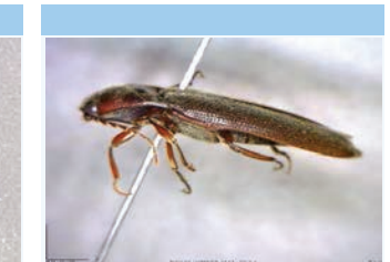
[Lateral] Enoclerus nigripes ru ventris BIN URI: BOLD:AAU6970