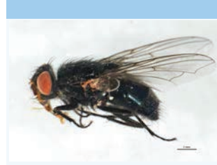
[Lateral] Calliphora livida BIN URI: BOLD:ABY7153