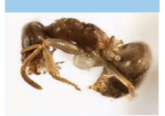
[Lateral] Lasius neoniger BIN URI: BOLD:AAB9126