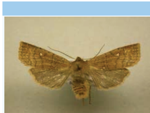
[Dorsal] Eupsilia vinulenta BIN URI: BOLD:AAB4640