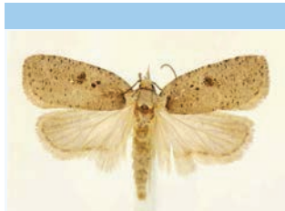
[Dorsal] Agonopterix argillacea BIN URI: BOLD:ACF4387