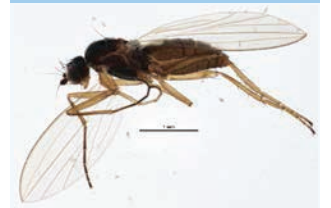
[Lateral] Lonchoptera bifurcata BIN URI: BOLD:AAG9974