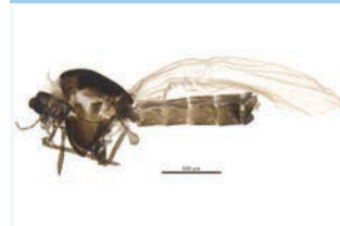
[Lateral] Chironomidae BIN URI: BOLD:ACU5397