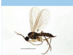
[Lateral] Bradysia di ormis BIN URI: BOLD:AAV1295