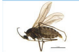
[Lateral] Cecidomyiidae BIN URI: BOLD:ACJ4884