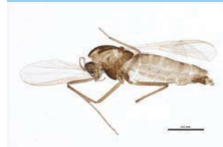
[Lateral] Gymnometrioctonus brumalis BIN URI: BOLD:AAP6873