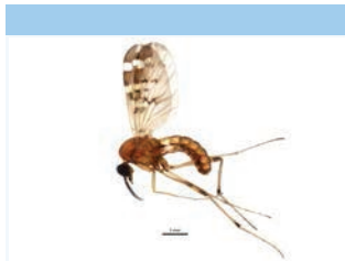
[Lateral] Anisopodidae BIN URI: BOLD:AAG2000

The images of the species collected in your Malaise trap are shown below. A single representative from each species was selected to be photographed; in some cases, only a damaged specimen was available.