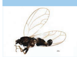
[Lateral] Psyllidae BIN URI: BOLD:ACF6530