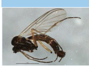
[Lateral] Mycetophilidae BIN URI: BOLD:ABW1532