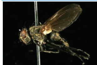
[Lateral] Diptera BIN URI: BOLD:AAG6745