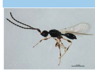
[Lateral] Trichopria BIN URI: BOLD:ABA5937