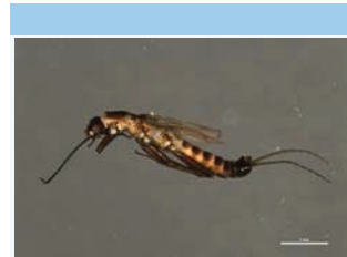
[Lateral] Allocapnia minima BIN URI: BOLD:AAB2625