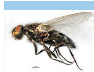
[Lateral] Pollenia vagabunda BIN URI: BOLD:AAH3040