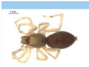
[Dorsal] Cubiona pallidula BIN URI: BOLD:AAI4087

The images of the species collected in your Malaise trap are shown below. A single representative from each species was selected to be photographed; in some cases, only a damaged specimen was available.