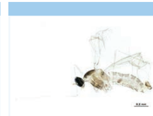
[Lateral] Cecidomyiidae BIN URI: BOLD:ACK9889