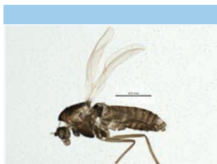
[Lateral] Chironomidae BIN URI: BOLD:ABU5526