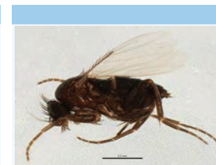
[Lateral] Phoridae BIN URI: BOLD:AAG3303