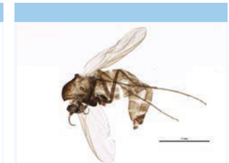
[Lateral] Bryophaenocladus sp. 8ES BIN URI: BOLD:AAG1021