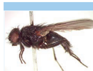
[Lateral] Muscina levida BIN URI: BOLD:AAB8817