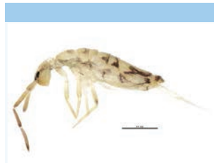
[Lateral] Entomobrya BIN URI: BOLD:AQL6239