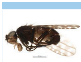
[Lateral] Ephyridae BIN URI: BOLD:AAU6743