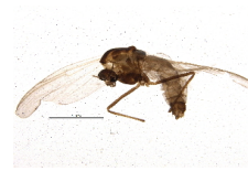
BIOUG04327-D11 [Lateral] Orthocladius BIN URI: BOLD:ACD2908