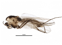
BIOUG25572-C01 [Lateral] Orthocladius BIN URI: BOLD:ABX3879