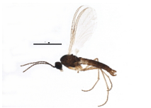
BIOUG06877-G02 [Lateral] Lycoriella flavipeda BIN URI: BOLD:AAL7869