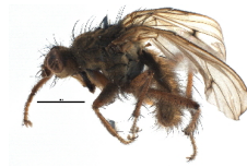
BIOUG08898-E03 [Lateral] Scathophaga furcata BIN URI: BOLD:ACX4405