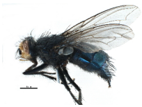
BIOUG15573-F10 [Lateral] Cynomya cadaverina BIN URI: BOLD:AAB0868