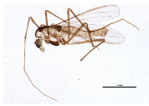
BIOUG01684-F12 [Lateral] Micropsectra polita BIN URI: BOLD:AAC4403