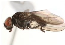
BIOUG16516-F08 [Lateral] Azelia cilipes BIN URI: BOLD:ACT6447