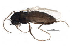
BIOUG21770-A06 [Lateral] Smittia sp. 14ES BIN URI: BOLD:ACW5117