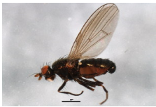
BIOUG01459-C06 [Lateral] Lauxaniidae BIN URI: BOLD:AAP6482