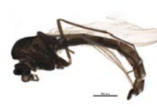
BIOUG16142-G03 [Lateral] Orthoclaadiinae BIN URI: BOLD: ACC4669