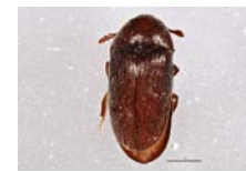
BIOUG02832-H01 [Dorsal] Trixagus BIN URI: BOLD: AAU6966