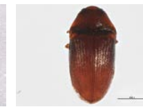
BIOUG01649-A09 [Dorsal] Trixagus BIN URI: BOLD: ABW2869