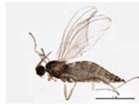
BIOUG05503-B09 [Lateral] Cecidomyiidae BIN URI: BOLD: AAN5268