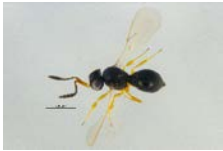
BIOUG02984-E07 [Lateral] Telenomus podisi BIN URI: BOLD:AA9192