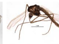
BIOUG08822-A07 [Lateral] Heterotrissocladius BIN URI: BOLD: ACY8937