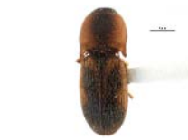
CCDB-22965-F06 [Dorsal] Aeolus BIN URI: BOLD: ABA4842