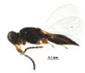
BIOUG31034-G05 [Lateral] Platygastriidae BIN URI: BOLD:ADE3729