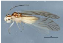
08TTML-2699 [Lateral] Valenzuela flavidus BIN URI: BOLD:AAN8447