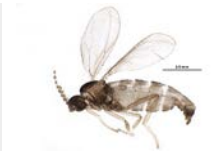
BIOUG22417-E04 [Lateral] Cecidomyiidae BIN URI: BOLD: ACV4544