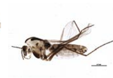
BIOUG05514-B08 [Lateral] Orthoclaadiinae BIN URI: BOLD: ACU7906