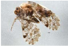
BIOUG01240-B05 [Lateral] Trichadenotecnum alexanderae complex BIN URI: BOLD:ACE6318