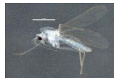
BIOUG08482-E10 [Lateral] Tanytarsus BIN URI: BOLD: AAG5463