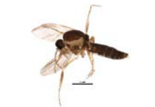
BIOUG01423-F06 [Lateral] Forcipomyia bipunctata BIN URI: BOLD: AAN5148