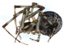
TDWG-1019 [Lateral] Parasteatoda tepidarium BIN URI: BOLD: AAC0175