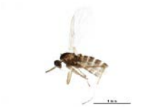
BIOUG06928-F02 [Lateral] Cecidomyiidae BIN URI: BOLD: AAA1259