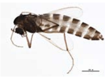
BIOUG05503-E10 [Lateral] Smittia sp. 22ES BIN URI: BOLD: AAN5358