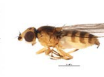
BIOUG01543-D12 [Lateral] Incertella BIN URI: BOLD: AAN5660