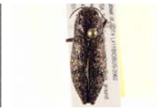
BIOUG02030-H08 [Dorsal] Dicerca lurida BIN URI: BOLD: AAF5689