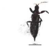
BIOUG21411-B02 [Dorsal] Phlaeothripidae BIN URI: BOLD:ACU9371