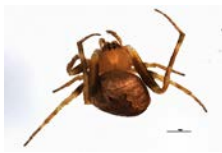
BIOUG01959-F10 [Dorsal] Eustala BIN URI: BOLD: AAN5451