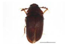
BIOUG05507-E08 [Dorsal] Trixagus carnicollis BIN URI: BOLD: AAN6148