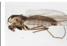
BIOUG05572-G05 [Lateral] Heterotrissocladius changi BIN URI: BOLD: AAX0836