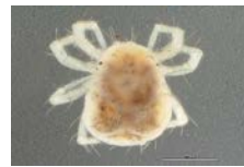
BIOUG02050-G01 [Dorsal] Anystidae BIN URI: BOLD: ACA6346