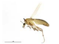
10JSROW-1409 [Lateral] Orthoclaadiinae BIN URI: BOLD: AAN5342