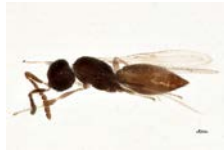
BIOUG02619-F11 [Lateral] Telenomus BIN URI: BOLD:ABA6265