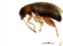
BIOUG00993-B09 [Lateral] Longitarsus scutellaris BIN URI: BOLD: AAN6151