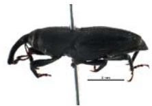
BIOUG08060-F08 [Lateral] Sphenophorus BIN URI: BOLD: AAZ2346