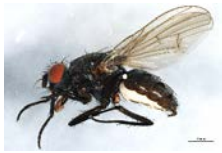
BIOUG01428-B12 [Lateral] Anthomyiidae BIN URI: BOLD: AAG1708