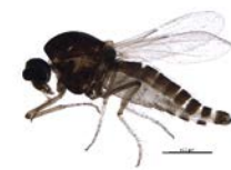
BIOUG08804-E06 [Lateral] Ceratopogonidae BIN URI: BOLD: ACK2453