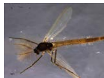
Finnmark727 [Dorsal] Paracladopelma winnelli BIN URI: BOLD: AAK4963