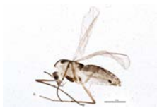
BIOUG05514-D06 [Lateral] Paraphaenocladus impensus BIN URI: BOLD: AAG4197