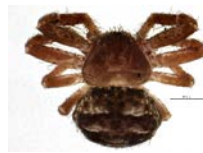
BIOUG03561-E04 [Dorsal] Bassariana utahensis BIN URI: BOLD: AAF0365