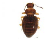
BIOUG05507-H02 [Dorsal] Corticina BIN URI: BOLD: AAH0256