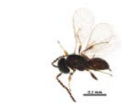
BIOUG16223-C04 [Lateral] Telenomus BIN URI: BOLD:AAU8457