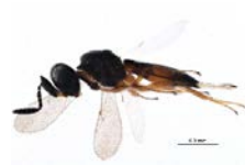
BIOUG16166-C03 [Lateral] Scelioninae BIN URI: BOLD:ACL1176