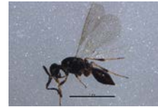
BIOUG07190-F11 [Lateral] Platygastriidae BIN URI: BOLD:ACI3553