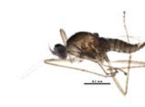
BIOUG25531-D04 [Lateral] Cecidomyiidae BIN URI: BOLD: ACX8294