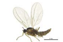
BIOUG25572-F02 [Lateral] Cecidomyiidae BIN URI: BOLD: ACX8665