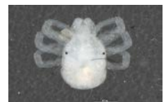
BIOUG03583-H07 [Dorsal] Anystidae BIN URI: BOLD: ACX4720