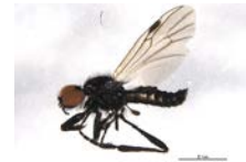
BIOUG04101-F01 [Lateral] Bibio longipes BIN URI: BOLD: ACT0146