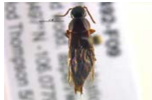
BIOUG04492-F09 [Dorsal] Quedius criddlei BIN URI: BOLD: ACA7311