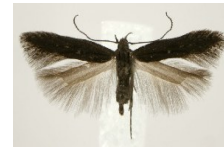
DNA-ATBI-3247 [Dorsal] Syncopacma [skewed] BIN URI: BOLD:AAF9988