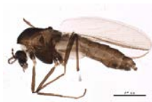
BIOUG16790-H03 [Lateral] Smittia sp. ES12 BIN URI: BOLD: AAB0377