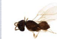
BIOUG01665-C10 [Lateral] Telenomus BIN URI: BOLD:ABA5898