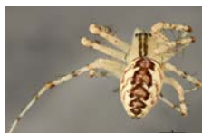
TDWG-1037 [Dorsal] Ptyohyphantes costatus BIN URI: BOLD: AAC6457