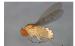
10BBCDIP-1496 [Lateral] Drosophila recens BIN URI: BOLD: ACF0720