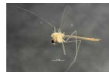
BIOUG01389-E07 [Lateral] Tanytarsus mendax BIN URI: BOLD: ACX2014