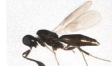
BIOUG03998-G04 [Lateral] Telenomus BIN URI: BOLD:ACC8435