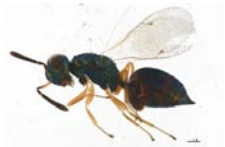
BIOUG07288-A02 [Lateral] Pteromalidae BIN URI: BOLD:ACI8854