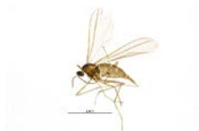
BIOUG02714-G06 [Lateral] Cecidomyiidae BIN URI: BOLD: ABX0280