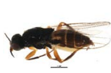
BIOUG01426-C08 [Lateral] Elachiptera BIN URI: BOLD: AAH4208