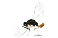
BIOUG25608-C05 [Lateral] Torymidae BIN URI: BOLD:ACY2130