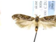
BIRD24832 [Dorsal] Gnorimoschema gallaeasterella BIN URI: BOLD:AAC5670