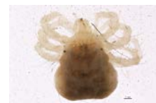
BIOUG04017-D01 [Dorsal] Anystidae BIN URI: BOLD: AAM7964