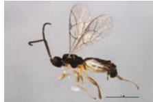
ASGLE-0216 [Lateral] Hymenoptera BIN URI: BOLD:AAU8582