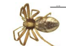
CCDB-05302-A02 [Dorsal] Philodromus rufus vibrans BIN URI: BOLD: AAB2768