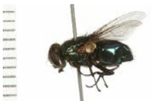
08BBDIP-1038 [Lateral] Phormia regina BIN URI: BOLD: AAB9140