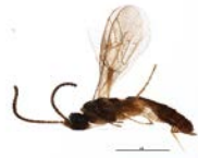
BIOUG00836-A10 [Lateral] Stenomacrus BIN URI: BOLD:ACN3086