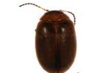
BIOUG00971-B09 [Dorsal] Cyphon variabilis BIN URI: BOLD: ACX4619