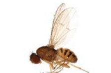
BIOUG01352-B02 [Lateral] Drosophila neotestacea BIN URI: BOLD: AAC7070