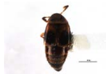
CCDB-22987-G10 [Dorsal] Lordithon fungicola BIN URI: BOLD: AAG4307