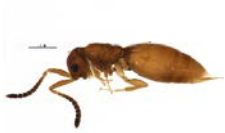
BIOUG07437-E05 [Lateral] Megaspilidae BIN URI: BOLD:ACJ3945