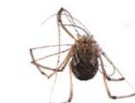
TDWG-0953 [Dorsal] Phalangium opilio BIN URI: BOLD: AAI4346