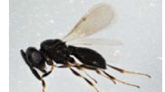
BIOUG03412-B05 [Lateral] Platygastriidae BIN URI: BOLD:ACC0983