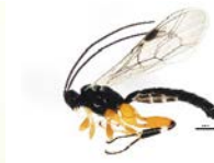
BIOUG00801-E07 [Lateral] Pimpla sp. BIN URI: BOLD:AAD5193