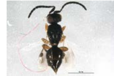
BIOUG08683-E05 [Dorsal] Dendrocerus BIN URI: BOLD:AAL1185