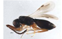
BIOUG11095-F01 [Lateral] Megaspilidae BIN URI: BOLD:ACF6761