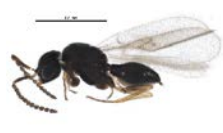
BIOUG25654-C04 [Lateral] Telenomus BIN URI: BOLD:AAG7892