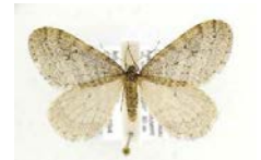
CNLEP00082494 [Dorsal] Operophtera bruceata BIN URI: BOLD:AAA2999