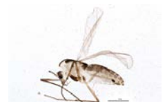
BIOUG05514-D06 [Lateral] Paraphaenocladus impensus BIN URI: BOLD: AAC4197