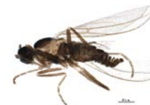
BIOUG16123-D12 [Lateral] Campsicnemus alexanderi BIN URI: BOLD: ACP9392