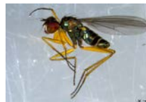
10PROBE-09248 [Lateral] Campsicnemus alexanderi BIN URI: BOLD: AAG9638