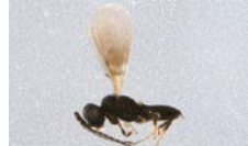
BIOUG03645-E02 [Lateral] Telenomus BIN URI: BOLD:AAV1142