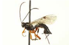
CNCHYM 013205 [Lateral] Itopectis quadricingulata BIN URI: BOLD:AAB1283