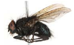
BIOUG06465-D01 [Lateral] Calliphora alaskensis BIN URI: BOLD: AAB6579