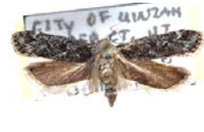
CCDB-24283-G09 [Dorsal] Anacampsis niveopulvella BIN URI: BOLD:AAC2309