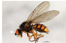
08TTML-2157 [Lateral] Pegomya BIN URI: BOLD: AAG2464