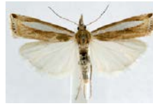
jflandry1226 [Dorsal] Crambus praefectellus BIN URI: BOLD:AAA3654