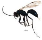
BIOUG01281-F03 [Lateral] Auplopus nigrellus BIN URI: BOLD:AA7538