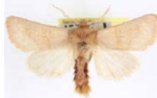
CNCLEP00084084.1 [Dorsal] Nephelodes minians BIN URI: BOLD:AAA5081