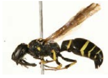
09BBEHY-0601 [Lateral] Ancistrocerus adiabatus BIN URI: BOLD:AAC5428