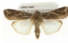
CMAZ-0061 [Dorsal] Spodoptera frugiperda sp. 2 BIN URI: BOLD:AAA4532