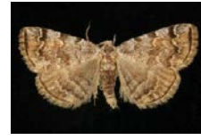
CGWC-3689 [Dorsal] Idia americalis BIN URI: BOLD:AAA2087