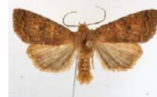
05-NCCC-454 [Dorsal] Sunira bicolorago BIN URI: BOLD:AAA4426