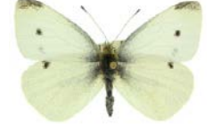
11ANIC-06928 [Dorsal] Pieris rapae BIN URI: BOLD:AAA2224