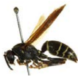
BIOUG01023-G08 [Lateral] Polistes fuscatus BIN URI: BOLD:AAA6508