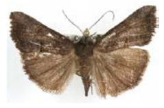
RBMIS-1101 [Dorsal] Hypena scabra BIN URI: BOLD:AAA4222