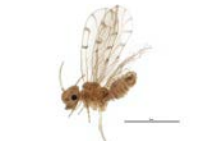
BIOUG00771-D02 [Lateral] Ectopsocus meridionalis BIN URI: BOLD:AAM8931