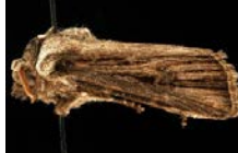
CGWC-0116 [Lateral] Agrotis venerabilis BIN URI: BOLD:ABZ1938