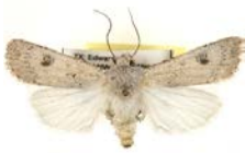
BIOUG26826-E01 [Dorsal] Agrotis BIN URI: BOLD:ACF0067