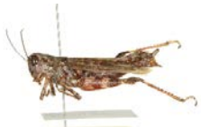
BIOUG01801-F11 [Lateral] Melanoplus punctulatus BIN URI: BOLD:ACF0478