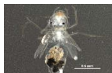
BIOUG15745-D04 [Dorsal] Lachesilla quercus BIN URI: BOLD:ACN0918