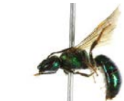
BIOUG01081-E03 [Lateral] Augochlora pura BIN URI: BOLD:AAD6445