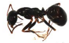
09BBEFO-0388 [Lateral] Formica glacialis BIN URI: BOLD:AAA1468