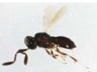
BIOUG01605-B02 [Lateral] Trimorus BIN URI: BOLD:AAU9229