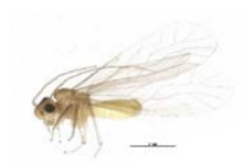
BIOUG04117-D05 [Lateral] Valenzuela burmeisteri BIN URI: BOLD:AAO4092