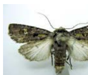
DH003832 [Dorsal] Lacinipolia renigera BIN URI: BOLD:AAA2636