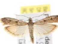
CNCLEP00101517 [Dorsal] Phycitodes mucidellus BIN URI: BOLD:AAA7815