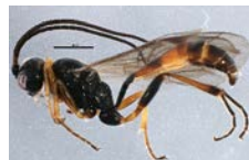
BIOUG15812-F08 [Lateral] Mesoleptus BIN URI: BOLD:ACE6694