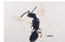
BIOUG11898-F04 [Dorsal] Pteromalidae BIN URI: BOLD:ACJ1470