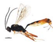
BIOUG00861-F11 [Lateral] Cymodusa distincta BIN URI: BOLD:ABZ4363