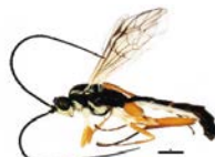
BIOUG01283-E11 [Lateral] Lissonota coracina BIN URI: BOLD:AAG7794