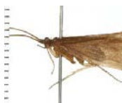
TRIC 0253.02 [Lateral] Ironoquia punctatissima BIN URI: BOLD:AAB2190

Copyright © 2014 BOLD Systems. All rights reserved.