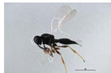
ASGLE-0378 [Lateral] Platygasteridae BIN URI: BOLD:AAU8342