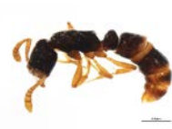
09GUANTS-161 [Lateral] Ponera BIN URI: BOLD:ACU4160