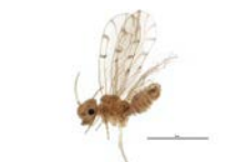
BIOUG00771-D02 [Lateral] Ectopsocus meridionalis BIN URI: BOLD:AAM8931