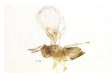
BIOUG02984-C11 [Lateral] Trichogramma platneri BIN URI: BOLD:AAE0242