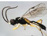
ASGLE-0540 [Lateral] Hymenoptera BIN URI: BOLD:ACF3297