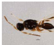
BIOUG01757-A06 [Lateral] Leptacis BIN URI: BOLD:ABZ8208