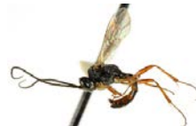
CNCHYM 05306 [Lateral] Campopetis flavicincta BIN URI: BOLD:AAZ8146