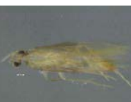
BIOUG03566-A06 [Lateral] Oxyethira pallida BIN URI: BOLD:AAF2521