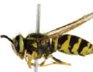
BIOUG01081-H11 [Lateral] Vespa maculifrons BIN URI: BOLD:AAD5593