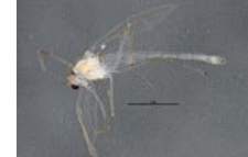
BIOUG03474-A04 [Lateral] Tanytarsus BIN URI: BOLD:ACC6674