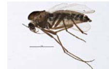
BIOUG03286-E02 [Lateral] Metriocnemus BIN URI: BOLD:ACX6686