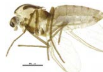
BIOUG07092-B12 [Lateral] Parametriocnemus BIN URI: BOLD:ACB1688