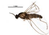
BIOUG31174-F09 [Lateral] Cecidomyiidae BIN URI: BOLD:ADE0447