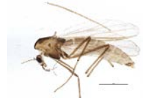
BIOUG05830-E12 [Lateral] Microspectra subletteorum BIN URI: BOLD:AAF7088