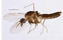
BIOUG03578-H10 [Lateral] Forcipomyia BIN URI: BOLD:ACB3306