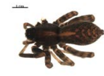
BIOUG00516-E10 [Dorsal] Pardosa moesta BIN URI: BOLD:AAB0863