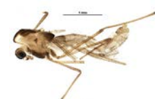
BIOUG22117-E04 [Lateral] Microspectra BIN URI: BOLD:ACC3825