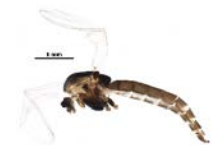
BIOUG31175-A03 [Lateral] Orthoclaudiinae BIN URI: BOLD:ADE3642