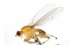
10BBCDIP-0118 [Lateral] Suillia convergens BIN URI: BOLD:ACX4624