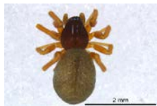
BIOUG01027-F04 [Dorsal] Walckenaeria directa BIN URI: BOLD:AAH8313