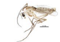
BIOUG22291-C11 [Lateral] Parametriocnemus BIN URI: BOLD:AAN5348