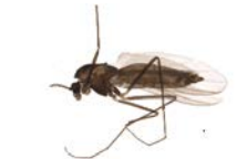
BIOUG04076-H07 [Lateral] Chaetocladius BIN URI: BOLD:AAN5376