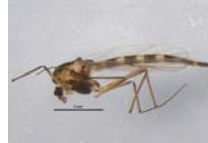
BIOUG05515-B03 [Lateral] Chironomus maturus BIN URI: BOLD:AAB4657