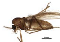
BIOUG06415-C11 [Lateral] Parochlus kiefferi BIN URI: BOLD:AAC1427