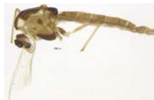
BIOUG03356-A11 [Lateral] Orthoclaudiinae BIN URI: BOLD:ACC6768