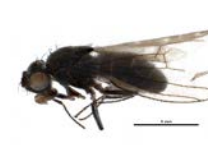
BIOUG22026-C12 [Lateral] Scatophila cribrata BIN URI: BOLD:ACG1385