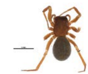
PF14-12-04 [Dorsal] Sciastes truncatus BIN URI: BOLD:AAE9280