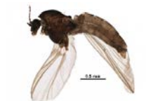
BIOUG31174-A09 [Lateral] Chaetocladius BIN URI: BOLD:ADE4704