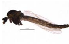
BIOUG16914-H08 [Lateral] Diamesinae BIN URI: BOLD:ACR4508