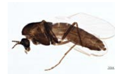
BIOUG03137-E01 [Lateral] Smittia BIN URI: BOLD:ACB0946