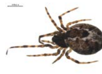
BIOUG01892-F05 [Dorsal] Ohlertidion ohlerti BIN URI: BOLD:AAF1548