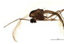
BIOUG04468-A04 [Lateral] Diplocladius BIN URI: BOLD:ACD2920