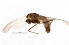
BIOUG04327-D11 [Lateral] Orthocladius BIN URI: BOLD:ACD2908