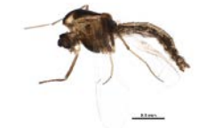
BIOUG13059-B09 [Lateral] Eukiefferiella claripennis BIN URI: BOLD:AAE4568