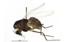
BIOUG02190-H01 [Lateral] Rheocricotopus robacki BIN URI: BOLD:AAM6249