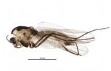
BIOUG25572-C01 [Lateral] Orthocladius BIN URI: BOLD:ABX3879