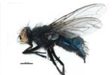
BIOUG15573-F10 [Lateral] Cynomyia cadaverina BIN URI: BOLD:AAB0868