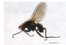
BIOUG04202-C11 [Lateral] Delia BIN URI: BOLD:ACC9953