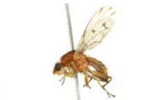
10BBCDIP-2166 [Lateral] Suillia nemorum BIN URI: BOLD:ACX5303