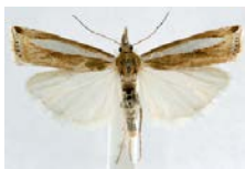
jflandry1226 [Dorsal] Crambus praefectellus BIN URI: BOLD:AAA3654