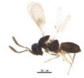
BIOUG14476-A06 [Lateral] Platygastriidae BIN URI: BOLD:AAU9340