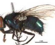
BIOUG02722-C04 [Lateral] Lucilia silvarum BIN URI: BOLD:AAG6746