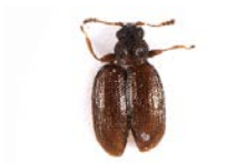
MP00173 [Dorsal] Corticara gibbosa BIN URI: BOLD:AAI8935