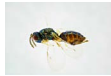
BC-ZSM-HYM-20720-B11 [Lateral] Pteromalidae BIN URI: BOLD:ACI9027