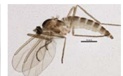
BIOUG05625-G04 [Lateral] Cecidomyiidae BIN URI: BOLD:AAP9021