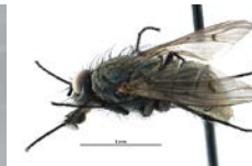
CCDB-23518-G08 [Lateral] Helina aldrichi BIN URI: BOLD:AAC2498