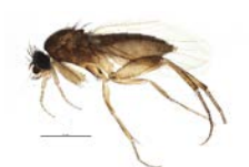
BIOUG04290-A04 [Lateral] Megaselia rufipes BIN URI: BOLD:AAG3274