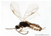
BIOUG07537-A09 [Lateral] Blacinae BIN URI: BOLD:AAU8584