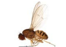
BIOUG01352-B02 [Lateral] Drosophila neotestacea BIN URI: BOLD:AAC7070