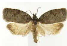
CNCLPE00040530 [Dorsal] Apotomis BIN URI: BOLD:AAI4355