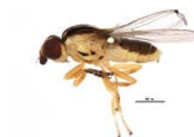
BIOUG01400-C01 [Lateral] Thaumatomyia BIN URI: BOLD:AAH4135