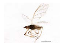
BIOUG01643-A11 [Lateral] Nasonovia BIN URI: BOLD:ACE7723