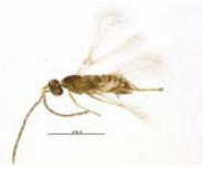
BIOUG03580-F03 [Lateral] Mymaridae BIN URI: BOLD:ACC4183