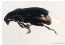
BIOUG00828-C08 [Lateral] Phyllotreta albionica BIN URI: BOLD:AAH0255