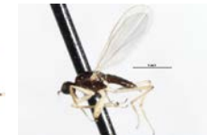
CNC DIPTERA 105481 [Lateral] Platypalpus unguiculatus [skewed] BIN URI: BOLD:ABA0579