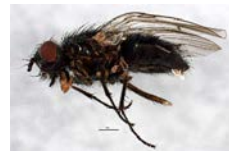
BIOUG01645-C06 [Lateral] Phaonia BIN URI: BOLD:ABU9891