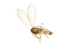
BIOUG02724-F07 [Lateral] Psychodidae BIN URI: BOLD:ABZ0621