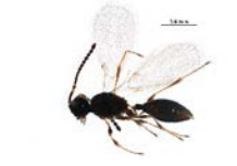
BIOUG25607-A02 [Lateral] Diapriidae BIN URI: BOLD:ABA8019