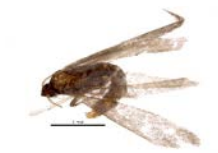
BIOUG31058-G03 [Lateral] Gnorimoschema BIN URI: BOLD:ADE1196