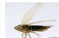
10BBCHEM-0559 [Lateral] Dikraneura BIN URI: BOLD:AAV0227