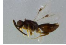
BIOUG08663-D05 [Lateral] Megaspilidae BIN URI: BOLD:ACN0444