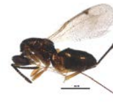
BIOUG25593-A10 [Lateral] Torymus chrysochlorus BIN URI: BOLD:AA81822