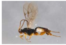
BIOUG04189-A11 [Lateral] Orthocentrus BIN URI: BOLD:ACM2706