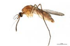
BIOUG01392-B07 [Lateral] Culex territans BIN URI: BOLD:AAB6943