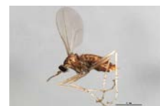
BIOUG01553-A09 [Lateral] Cecidomyiidae BIN URI: BOLD:AAM6127