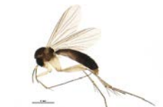
BIOUG01522-D01 [Lateral] Mycetophilidae BIN URI: BOLD:AAP2525