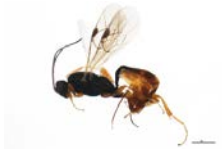
10PROBE-29375 [Lateral] Probes BIN URI: BOLD:ACF2205