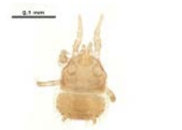
BIOUG30422-B05 [Dorsal] Asca BIN URI: BOLD:ADD1281