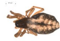
09PROBE-1978-437 [Dorsal] Grammonota gentilis BIN URI: BOLD:AAA9476