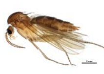
BIOUG05324-C03 [Lateral] Mycetophila BIN URI: BOLD:AAG4872