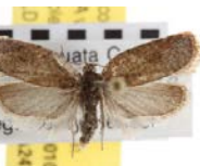
CNCLPE00101768 [Dorsal] Acleris minuta BIN URI: BOLD:AAE3758