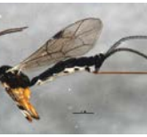
10BBCHY-0923 [Lateral] Scambus BIN URI: BOLD:ACE6645