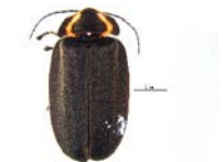
BIOUG02737-C11 [Dorsal] Elychnia BIN URI: BOLD:AAF4976