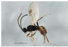
BIOUG03770-D07 [Lateral] Blacus stelfoxi BIN URI: BOLD:AAZ9744