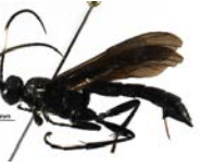
BIOUG31064-F12 [Lateral] Coelichneumon BIN URI: BOLD:ADE1592