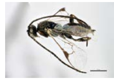
BIOUG08647-G07 [Lateral] Apanteles ensiger BIN URI: BOLD:ACE6783