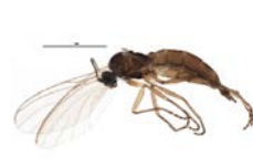
BIOUG07887-E12 [Lateral] Scatopsiara atomaria BIN URI: BOLD:AAH3920