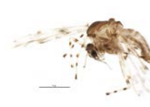
BIOUG20653-H08 [Lateral] Ablabesmyia americana BIN URI: BOLD:AAC8567