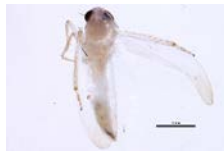
BIOUG08659-F07 [Dorsal] Typhlocybae BIN URI: BOLD:ACP8819