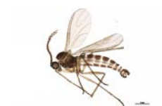
BIOUG01659-D12 [Lateral] Pseudolycoriella BIN URI: BOLD:ABA6407