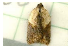
RWWA-2066 [Dorsal] Acleris fragariana BIN URI: BOLD:AAH4536