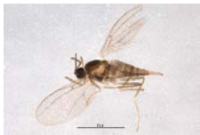
BIOUG06432-D08 [Lateral] Cecidomyiidae BIN URI: BOLD:ACD1662