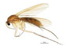
BIOUG01338-E07 [Lateral] Mycetophila fungorum BIN URI: BOLD:ACF2821