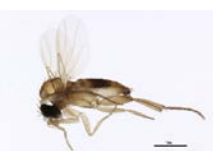
BIOUG01300-E09 [Lateral] Megaselia BIN URI: BOLD:AAP4685