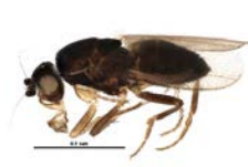
BIOUG25626-B08 [Lateral] Pullimosina heteroneura BIN URI: BOLD:ACG0715