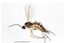
BIOUG05504-G10 [Lateral] Bradysia trivittata BIN URI: BOLD:ABA6488