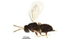
BIOUG16416-H10 [Lateral] Eulophidae BIN URI: BOLD:ACB7962