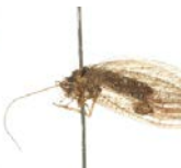
08BBNEU-018 [Lateral] Hemerobius BIN URI: BOLD:AAG0891