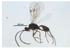
BIOUG16070-A01 [Lateral] Euphorinae BIN URI: BOLD:ACP8405