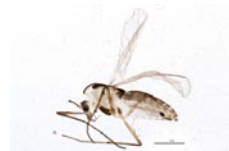
BIOUG05514-D06 [Lateral] Paraphaenocladus impensus BIN URI: BOLD:AAC4197