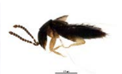
BIOUG00993-A10 [Lateral] Staphylinidae BIN URI: BOLD:ABW2844 [skewed]