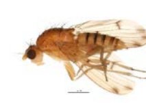
BIOUG01408-D04 [Lateral] Heleomyzidae BIN URI: BOLD:AAE1978