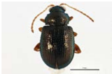
BIOUG05551-A11 [Dorsal] Crepidodera heikertingeri BIN URI: BOLD:AAG4462