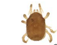
BIOUG01238-E04 [Dorsal] Cheiroseius BIN URI: BOLD:AAV0589