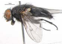
BIOUG05549-H10 [Lateral] Muscina pascuorum BIN URI: BOLD:AAG1714