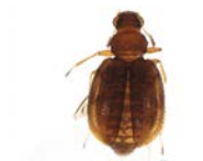
BIOUG05509-H09 [Dorsal] Melanophthalma inermis BIN URI: BOLD:AAN6154