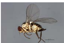
08TTML-0977 [Lateral] Liriomyza brassicae BIN URI: BOLD:AAF6806