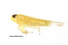
BIOUG00936-B03 [Lateral] Hemiptera BIN URI: BOLD:ABA8103