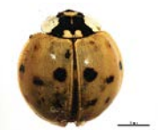
BIOUG02913-E01 [Dorsal] Harmonia axyridis BIN URI: BOLD:AAB5640