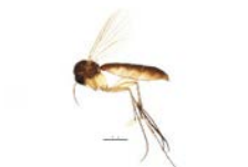
BIOUG01931-B06 [Lateral] Exechia BIN URI: BOLD:ACX9220