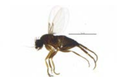
BIOUG03369-B03 [Lateral] Phoridae BIN URI: BOLD:AAG3311