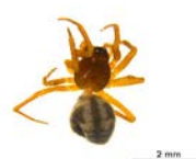
BIOUG01027-D12 [Dorsal] Grammonota pictilis BIN URI: BOLD:AAD1498