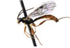
CNCHYM 014860 [Lateral] Syrphoctonus signatus BIN URI: BOLD:AAH2172