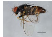
08TTL-1053 [Lateral] Lispocephala erythroera BIN URI: BOLD:AAG1704