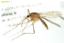
BIOUG01818-A04 [Lateral] Culiseta inornata BIN URI: BOLD:AAC9132