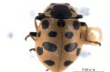
CNC COLEO 00154327 [Dorsal] Hippodamia tredecimpunctata tibialis BIN URI: BOLD:AAX1229