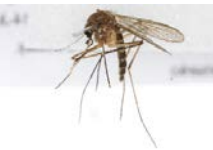
09BBDIP-1583 [Lateral] Aedes vexans BIN URI: BOLD:AAA7067