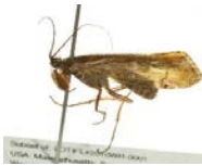
TDWG-0261 [Lateral] Limnephilus submonilifer BIN URI: BOLD:AAA3080