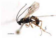
07PROBE-20519 [Lateral] Mesochorus sp. MAS BIN269 BIN URI: BOLD:AAG9511