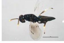
ASGLE-0552 [Lateral] Hymenoptera BIN URI: BOLD:AAU8478