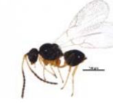
BIOUG16938-A03 [Lateral] Charipinae BIN URI: BOLD:ACR3976