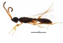
BIOUG01327-D08 [Lateral] Diapriidae BIN URI: BOLD:AAU9389