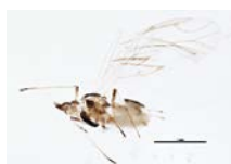
BIOUG05599-E07 [Lateral] Capitophorus eleagni BIN URI: BOLD:AAE3015