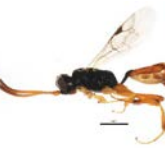
BIOUG01037-C10 [Lateral] Ichneumoninae BIN URI: BOLD:AAU8234