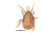
BIOUG31058-E11 [Dorsal] Mesostigmata BIN URI: BOLD:ADE0452