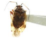
CNC#HEM032700-8 [Dorsal] Lygus lineolaris BIN URI: BOLD:AAA5803