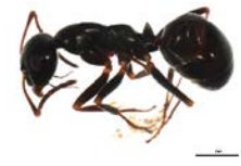
09BBEFO-0388 [Lateral] Formica glacialis BIN URI: BOLD:AAA1468