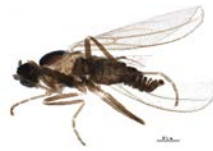
BIOUG16123-D12 [Lateral] Cecidomyiidae BIN URI: BOLD:ACP9392