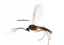
BIOUG06877-G02 [Lateral] Lycoriella flavipeda BIN URI: BOLD:AAL7869