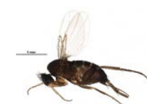
BIOUG24409-F09 [Lateral] Megaselia BIN URI: BOLD:ADA3720