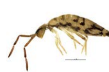
BIOUG03583-D10 [Lateral] Entomobrya nivalis BIN URI: BOLD:AAA8924