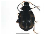
BIOUG05520-C10 [Dorsal] Phyllotreta striolata BIN URI: BOLD:AAL5267