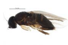
BIOUG21089-A07 [Lateral] Megaselia lucifrons BIN URI: BOLD:AAL9075