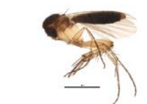
BIOUG01400-B09 [Lateral] Mycetophilidae BIN URI: BOLD:AAG4893