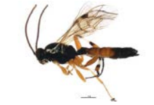
BIOUG00910-F11 [Lateral] Ichneumonidae BIN URI: BOLD:AAD4214