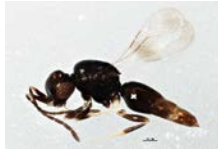
BIOUG03697-G06 [Lateral] Megaspilidae BIN URI: BOLD:ACB0899