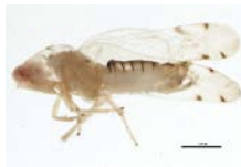
BIOUG01516-C05 [Lateral] Ribautiana BIN URI: BOLD:AA8410