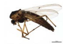
10PHMAL-1224 [Lateral] Chironomus melanescens BIN URI: BOLD:AAI4303