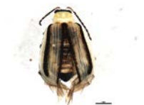
10BBCOL-0074 [Dorsal] Acalymma vittatum BIN URI: BOLD:AAF4335