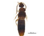
BIOUG05567-B08 [Dorsal] Amischa BIN URI: BOLD:ABA5313