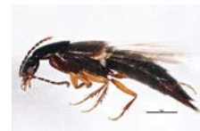
BIOUG05690-G06 [Lateral] Philonthus flavibasis BIN URI: BOLD:AAH0106