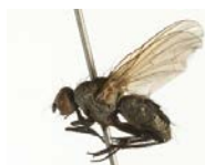
08TTML-0519 [Lateral] Botanophila profuga BIN URI: BOLD:ACP6334