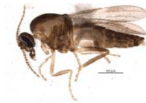
BIOUG05992-C03 [Lateral] Ceratopogonidae BIN URI: BOLD:ACE1732