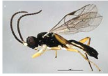
ASGLE-0540 [Lateral] Hymenoptera BIN URI: BOLD:ACF3297