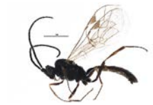
BIOUG07192-F05 [Lateral] Plectiscidea BIN URI: BOLD:AAF4291