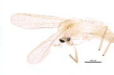
BIOUG22329-B05 [Lateral] Tanytarsus wirthi BIN URI: BOLD:AAD2144