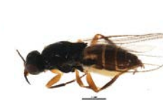
BIOUG01426-C08 [Lateral] Elachiptera BIN URI: BOLD:AAH4208