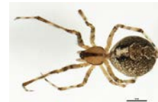
09ONTGAB-053 [Dorsal] Theridion murarium BIN URI: BOLD:AAC6350