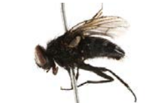
BIOUG03418-E02 [Lateral] Muscina sp. 1 AKR BIN URI: BOLD:AAB8818