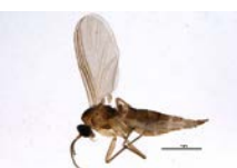
BIOUG03131-G12 [Lateral] Bradysia trivittata BIN URI: BOLD:ACB1143