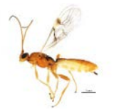
BIOUG01291-E04 [Lateral] Aleiodes BIN URI: BOLD:ABA6045