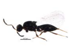
BIOUG31059-D05 [Lateral] Platygastriidae BIN URI: BOLD:ADE3936