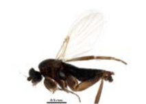
BIOUG21982-F10 [Lateral] Megaselia BIN URI: BOLD:ACG4438