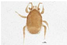
BIOUG05609-E12 [Dorsal] Cheiroseius BIN URI: BOLD:AAN6642