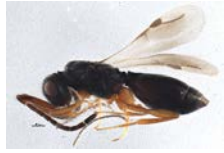
BIOUG11095-F01 [Lateral] Megaspilidae BIN URI: BOLD:ACF6761