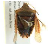
BIOUG01150-C09 [Dorsal] Euschistus servus BIN URI: BOLD:AAE0845