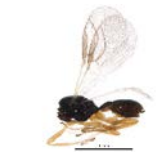
BIOUG31059-B03 [Lateral] Braconidae BIN URI: BOLD:ADE0503