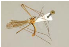
CMNH575788 [Lateral] Dicranomyia moniliformis BIN URI: BOLD:AAI1345