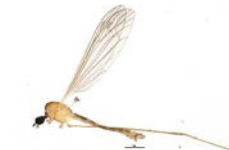
BIOUG00938-E11 [Lateral] Dicranomyia frontalis BIN URI: BOLD:ABA5203