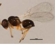
ASGLE-0338 [Lateral] Charipinae BIN URI: BOLD:AAU8573