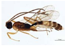
BIOUG03336-F06 [Lateral] Megastylus BIN URI: BOLD:ACE4233