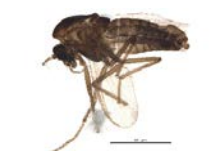
BIOUG08660-C05 [Lateral] Smittia edwardsi BIN URI: BOLD:AAF4817