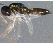
BIOUG11254-H01 [Lateral] Pteromalidae BIN URI: BOLD:ACM1360