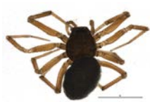
BIOUG05648-B04 [Dorsal] Collinsia plumosa BIN URI: BOLD:AAM9146