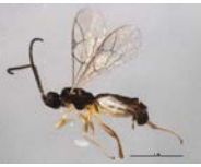
ASGLE-0216 [Lateral] Hymenoptera BIN URI: BOLD:AAU8582