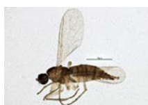
BIOUG02981-F02 [Lateral] Corynoptera cursor BIN URI: BOLD:AAP6465