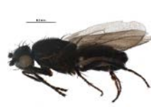
BIOUG25607-G02 [Lateral] Rachispoda BIN URI: BOLD:AAG7277