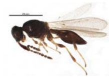
BIOUG10805-B02 [Lateral] Platygastriidae BIN URI: BOLD:ACL7995