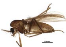
BIOUG06415-C11 [Lateral] Parochlus kiefferi BIN URI: BOLD:AAC1427