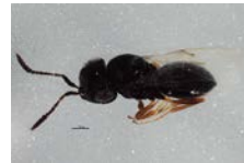
BIOUG02686-F11 [Lateral] Trissolcus BIN URI: BOLD:ABY3523