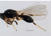
ASGLE-0366 [Lateral] Hymenoptera BIN URI: BOLD:AAU8564