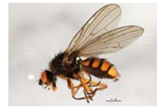
08TTML-2157 [Lateral] Pegomya BIN URI: BOLD:AAG2464