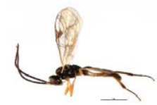
07PROBE-21202 [Lateral] Cryptinae BIN URI: BOLD:AAH1497