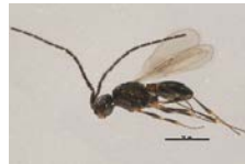
10BBCHY-2912 [Lateral] Trimorus BIN URI: BOLD:AAU9001