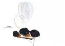
BIOUG22018-G02 [Lateral] Charipinae BIN URI: BOLD:ACU6255