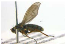
BIOUG04625-G03 [Lateral] Dolichopodidae BIN URI: BOLD:ACF8666