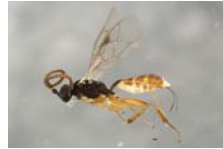
10BBCHY-2270 [Lateral] Cryptinae BIN URI: BOLD:AAH8142