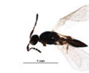
BIOUG31099-B07 [Lateral] Platygastriidae BIN URI: BOLD:ADE3861