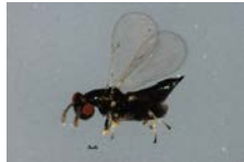
08BBHYM-1434 [Lateral] Tetrastichinae BIN URI: BOLD:AAG7984