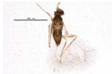
BIOUG16049-G11 [Dorsal] Myrmidae BIN URI: BOLD:ACP9287