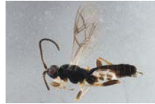
BIOUG16153-B11 [Lateral] Orthocentrinae BIN URI: BOLD:ACP7752