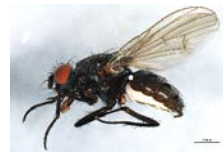
BIOUG01428-B12 [Lateral] Anthomyiidae BIN URI: BOLD:AAG1708