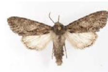
CGWC-3751 [Dorsal] Fishia discors BIN URI: BOLD:AAB3715