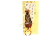
BIOUG10948-D10 [Dorsal] Forficula auricularia-B BIN URI: BOLD:AAE0456