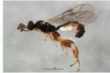
10BBCHY-1379 [Lateral] Stenomacrus BIN URI: BOLD:AAH1710