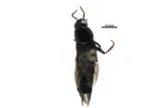
BIOUG26579-E06 [Dorsal] Coleoptera BIN URI: BOLD:AAZ0388