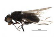
BIOUG22026-C12 [Lateral] Scatophila cribrata BIN URI: BOLD:ACG1385