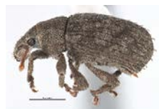
CCDB-22984-D05 [Lateral] Trachyploeus bifoveolatus BIN URI: BOLD:AAH0270