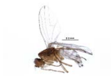
BIOUG06710-C11 [Lateral] Drosophilidae BIN URI: BOLD:ACI7818