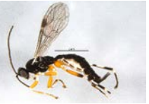
BIOUG03546-G01 [Lateral] Pimplinae BIN URI: BOLD:AAQ2915