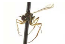
CNC DIPTERA 163202 [Lateral] Neoparentia caudata BIN URI: BOLD:ABY3182