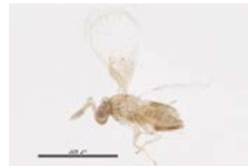
BIOUG05770-H11 [Lateral] Trichogrammatidae BIN URI: BOLD:ACC6467