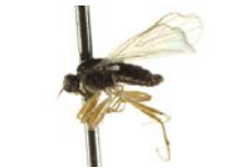
CNC DIPTERA 163535 [Lateral] Platypalpus sp. 19 BIN URI: BOLD:ABY3127