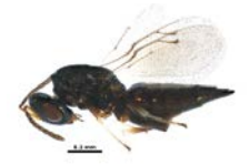
BIOUG31098-D05 [Lateral] Pteromalidae BIN URI: BOLD:ADE1931