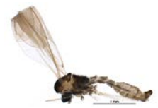
BIOUG25524-G07 [Lateral] Cecidomyiidae BIN URI: BOLD:AAP9022