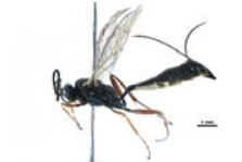
BIOUG25610-B04 [Lateral] Campopleginae BIN URI: BOLD:ACY2985