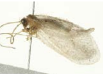
BIOUG00762-D07 [Lateral] Hemerobius discretus BIN URI: BOLD:ABZ0149