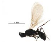
BIOUG25618-B07 [Lateral] Diapriidae BIN URI: BOLD:ACK2397