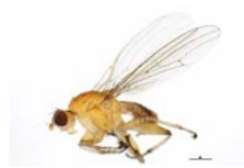
10BBCDIP-0118 [Lateral] Suillia convergens BIN URI: BOLD:ACX4624