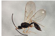
BIOUG05954-H09 [Lateral] Diapriidae BIN URI: BOLD:ACM0869