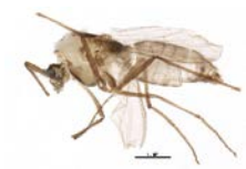
BIOUG01675-D03 [Lateral] Orthocladus smolandicus BIN URI: BOLD:ABA6506