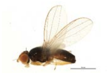
BIOUG03658-H07 [Lateral] Leiomyza curvinervis BIN URI: BOLD:AAX5462