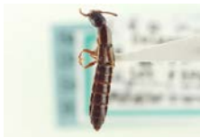
CNC COLEO 00251951 [Dorsal] Xantholinus linearis BIN URI: BOLD:AAG4333