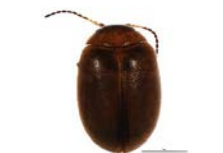
BIOUG00971-B09 [Dorsal] Cyphon variabilis BIN URI: BOLD:ACX4619