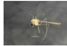
BIOUG01389-E07 [Lateral] Tanytarsus mendax BIN URI: BOLD:ACX2014