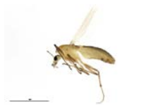
10JSROW-1409 [Lateral] Orthoclaadiinae BIN URI: BOLD:AAN5342