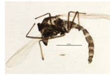
BIOUG05543-E09 [Lateral] Microtendipes pedellus grp. BIN URI: BOLD:AAM6248