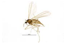
BIOUG02714-G06 [Lateral] Cecidomyiidae BIN URI: BOLD:ABX0280