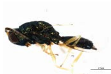
10BBHYM-0315 [Lateral] Pteromalidae BIN URI: BOLD:AAH7709