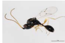
09BBHYM-707 [Lateral] Anacharis BIN URI: BOLD:AAG8258