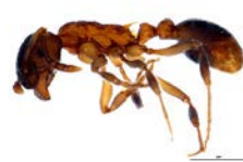
10BBCFO-0042 [Lateral] Myrmica incompleta BIN URI: BOLD:AAA1858