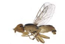
BIOUG08370-G11 [Lateral] Meromyza BIN URI: BOLD:ACJ8319