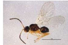
BIOUG06226-A11 [Lateral] Figitidae BIN URI: BOLD:AAJ4100