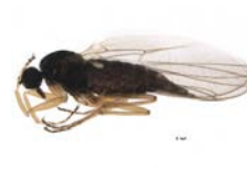
BIOUG04096-E03 [Lateral] Platypalpus lateralis BIN URI: BOLD:ACD2976