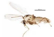
BIOUG06146-B11 [Lateral] Orthoclaadiinae BIN URI: BOLD:ABA6447