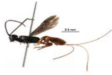
BIOUG31142-A10 [Lateral] Ichneumonidae BIN URI: BOLD:ADE2800