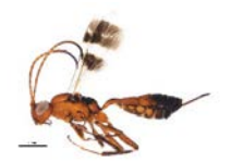
BIOUG00861-F07 [Lateral] Gelis sp. BIN URI: BOLD:AAA6280