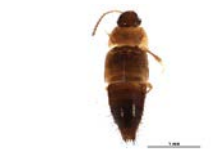
BIOUG25606-G12 [Dorsal] Tachyporus BIN URI: BOLD:AAM9619