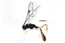
BIOUG00859-B07 [Lateral] Meloboris BIN URI: BOLD:AAU8441