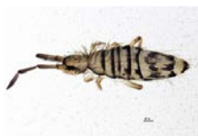
BIOUG03932-C02 [Dorsal] Entomobrya multifasciata BIN URI: BOLD:AAAT242