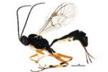
BIOUG01291-E11 [Lateral] Diadegma nr. Fenestratale BIN URI: BOLD:AAG7740