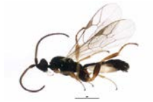
BIOUG00991-F10 [Lateral] Hymenoptera BIN URI: BOLD:AAC3876