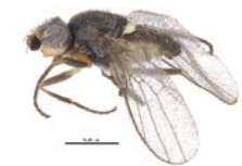
CCDB-23514-B02 [Lateral] Apallates neocoxendix BIN URI: BOLD:AAH4148