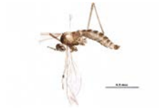
BIOUG22053-D10 [Lateral] Cecidomyiidae BIN URI: BOLD:ACP9278