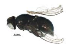
BIOUG31098-G08 [Lateral] Agromyzidae BIN URI: BOLD:ADE4555