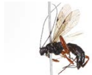
BIOUG04179-F04 [Lateral] Pimplinae BIN URI: BOLD:ACB1611