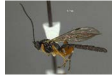
WSSF328 [Lateral] Pimpla hesperus BIN URI: BOLD:AAP6739