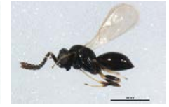
BIOUG01330-A06 [Lateral] Platygastridae BIN URI: BOLD:ABW3291