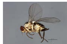
08TTML-0977 [Lateral] Liriomyza brassicae BIN URI: BOLD: AAF6806