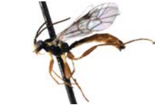
CNCHYM 014860 [Lateral] Syrphoctonus signatus BIN URI: BOLD:AAH2172