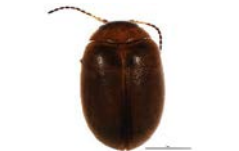
BIOUG00971-B09 [Dorsal] Cyphon variabilis BIN URI: BOLD: ACX4619