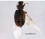
BIOUG04819-G11 [Dorsal] Enicmus mimus BIN URI: BOLD: AAN5905