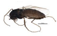
BIOUG21770-A06 [Lateral] Smittia sp. 14ES BIN URI: BOLD: ACW5117