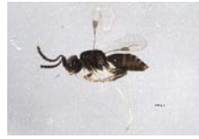
BIOUG08597-F06 [Lateral] Dendrocerus BIN URI: BOLD:ACJ6543