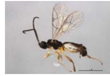
ASGLE-0216 [Lateral] Hymenoptera BIN URI: BOLD:AAU8582