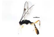
BIOUG00859-B07 [Lateral] Meloboris BIN URI: BOLD:AAU8441