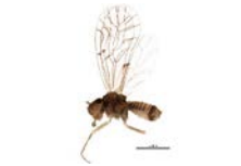
BIOUG01594-F11 [Lateral] Lachesilla pedicularia BIN URI: BOLD:AAF1729