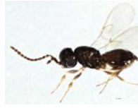
BIOUG04550-F06 [Lateral] Telenomus BIN URI: BOLD:AAU9454