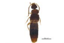
BIOUG05567-B08 [Dorsal] Amischa BIN URI: BOLD: ABA5313