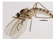
BIOUG05625-G04 [Lateral] Cecidomyiidae BIN URI: BOLD: AAP9021