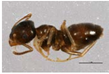
BIOUG03139-A03 [Lateral] Lasius BIN URI: BOLD:ACA9217