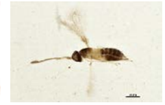
BIOUG03220-F11 [Lateral] Anagrus BIN URI: BOLD:AAZ1968