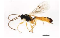
BIOUG00988-H07 [Lateral] Ichneumonidae BIN URI: BOLD:AAU8613