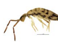
BIOUG03583-D10 [Lateral] Entomobrya nivalis BIN URI: BOLD: AAA8924