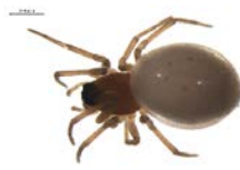
BIOUG01894-A08 [Dorsal] Ceraticelus crassiceps BIN URI: BOLD: AAC1589