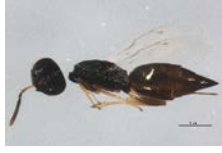
BIOUG01141-C09 [Lateral] Dibrachys BIN URI: BOLD:AAZ3284