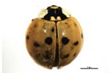
BIOUG02913-E01 [Dorsal] Harmonia axyridis BIN URI: BOLD: AAB5640