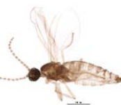
08WOLVES-01258 [Lateral] Cecidomyiidae BIN URI: BOLD: AAU6757