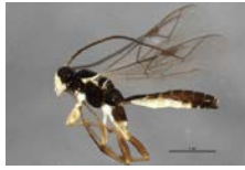
10BBCHY-0408 [Lateral] Orthocentrinae BIN URI: BOLD:AAG0976