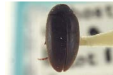
CNC COLEO 00152912 [Dorsal] Eucinetus terminalis BIN URI: BOLD: AAN6196