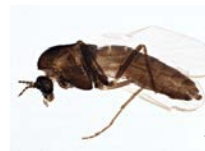
BIOUG03137-E01 [Lateral] Smittia BIN URI: BOLD: ACB0946