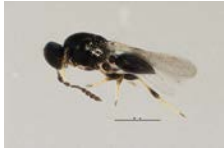
ASGLE-0326 [Lateral] Synopeas BIN URI: BOLD:AAU8571