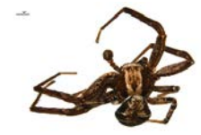
BIOUG07169-F11 [Dorsal] Xysticus ferox BIN URI: BOLD: AAD1987