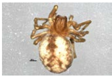
BIOUG06347-F11 [Dorsal] Dictyna brevitarso BIN URI: BOLD: AAN2653