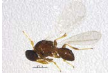
BIOUG05001-F09 [Lateral] Synopeas BIN URI: BOLD:AAU9074