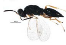
BIOUG22027-E09 [Lateral] Pteromalidae BIN URI: BOLD:ADB4085