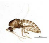
BIOUG01623-D05 [Lateral] Smittia sp. 8ES BIN URI: BOLD: ACP4736