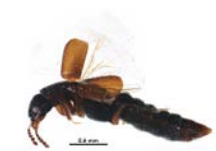
BIOUG01082-E01 [Lateral] Bledius BIN URI: BOLD: ADE2155