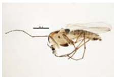
BIOUG05581-F11 [Lateral] Psectrocladius barbimanus BIN URI: BOLD: AAD0484