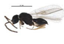
BIOUG25654-C04 [Lateral] Telenomus BIN URI: BOLD:AAG7892