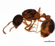
09GUANTS-098 [Lateral] Myrmica AF-smi BIN URI: BOLD:AAA1840