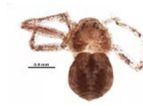
BIOUG31083-B07 [Dorsal] Philodromus vulgaris BIN URI: BOLD: ADE3960