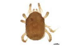
BIOUG01238-E04 [Dorsal] Cheiroseius BIN URI: BOLD: AAV0589