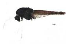
BIOUG20691-C11 [Lateral] Smittia sp. 14ES BIN URI: BOLD: AAM7064