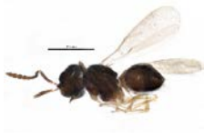
BIOUG17680-H02 [Lateral] Platygastridae BIN URI: BOLD:ACS1949