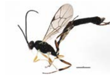
BIOUG00868-A01 [Lateral] Diadegma BIN URI: BOLD:AAB8765