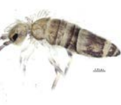
BIOUG03678-D11 [Lateral] Entomobrya assuta BIN URI: BOLD: ACM2009