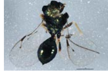
BIOUG13028-A06 [Dorsal] Pteromalidae BIN URI: BOLD:ACJ1468