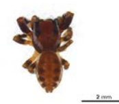
BIOUG01027-E12 [Dorsal] Pelegrina proterva BIN URI: BOLD: AAB2927