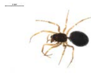
BIOUG02782-G05 [Dorsal] Erigone aletris BIN URI: BOLD: AAD1746