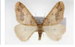
CSU-CPG-LEP001582 [Dorsal] Erannia tiliaria BIN URI: BOLD:AAC6725