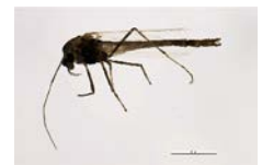
HLC-26990 [Lateral] Orthocladus sp. TE13 BIN URI: BOLD: AAC0069