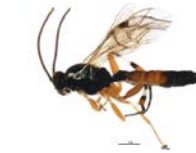
BIOUG00910-F11 [Lateral] Ichneumonidae BIN URI: BOLD:AAD4214