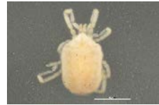
BIOUG02050-H09 [Dorsal] Erythraeidae BIN URI: BOLD: AAN6614