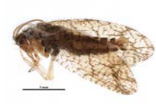
BIOUG25615-G11 [Lateral] Micromus angulatus BIN URI: BOLD:ACZ4162