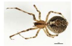
09ONTGAB-053 [Dorsal] Theridion murarium BIN URI: BOLD: AAC6350