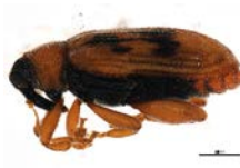
10BBCOL-0006 [Lateral] Orchestes alni BIN URI: BOLD: AAM7726