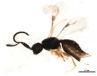
10BBHYM-0489 [Lateral] Megaspilidae BIN URI: BOLD:ABY3391