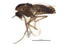
BIOUG08660-C05 [Lateral] Smittia edwardsi BIN URI: BOLD: AAF4817