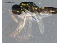
BIOUG11254-H01 [Lateral] Pteromalidae BIN URI: BOLD:ACM1360