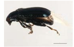
BIOUG00828-C08 [Lateral] Phyllotreta albionica BIN URI: BOLD: AAH0255