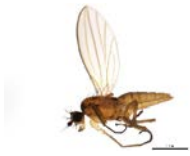
10BBDIP-0993 [Lateral] Lonchoptera bifurcata BIN URI: BOLD: AAG9974