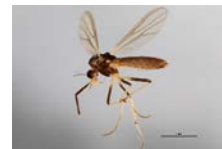
08TTML-2077 [Lateral] Paratendipes BIN URI: BOLD:ADE0124