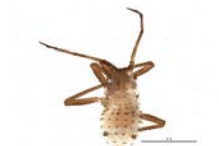
BIOUG04220-G12 [Dorsal] Euceraphis betulae BIN URI: BOLD: AA14926