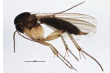
BIOUG03731-E10 [Lateral] Mycetophilidae BIN URI: BOLD: AAP9072