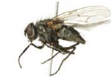
10BBCDIP-2971 [Lateral] Helina annosa BIN URI: BOLD: AAK4683