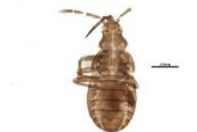
BIOUG06864-D09 [Dorsal] Anthocoris antevolens BIN URI: BOLD: ACU7840