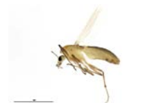
10JSROW-1409 [Lateral] Orthocladiinae BIN URI: BOLD:AA5342