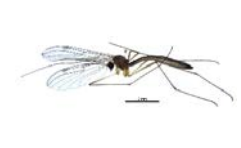
BIOUG06187-C08 [Lateral] Boitophiliidae BIN URI: BOLD:AAM9012