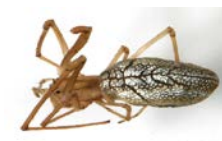
09ONTGAB-070 [Lateral] Tetragnatha laboriosa BIN URI: BOLD:AAA6381