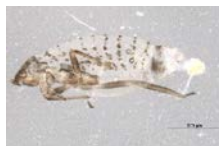
BIOUG08657-B12 [Lateral] Callipterinella BIN URI: BOLD: ACB2802