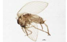
BIOUG05505-G01 [Lateral] Psychoda cinerea BIN URI: BOLD: ACF6513