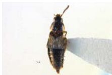
BIOUG09884-D01 [Dorsal] Lordithon thoracicus BIN URI: BOLD:ACL7992