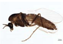
BIOUG03137-E01 [Lateral] Smittia BIN URI: BOLD:ACB0946