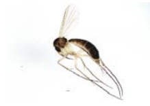
BIOUG04553-F02 [Lateral] Exechia BIN URI: BOLD: ACD9501