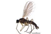
BIOUG11561-A06 [Lateral] Pseudolycoriella brunnea BIN URI: BOLD: ACX5278