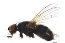
BIOUG16073-F09 [Lateral] Graphogaster BIN URI: BOLD: ACP7602