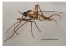
10BBCDDIP-3341 [Lateral] Cecidomyiidae BIN URI: BOLD:AAV5761