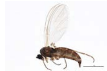
BIOUG02650-G08 [Lateral] Scatopsiara atomaria BIN URI: BOLD: AAN6431