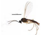
BIOUG06877-G02 [Lateral] Lycoriella flavipeda BIN URI: BOLD: AAL7869