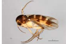
08TTML-2100 [Lateral] Mycetophila strigatoides BIN URI: BOLD: AAG4922