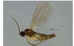
BIOUG04060-F02 [Lateral] Sciaridae BIN URI: BOLD: ACB0536