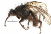
BIOUG08898-E03 [Lateral] Scathophaga furcata BIN URI: BOLD: ACX4405