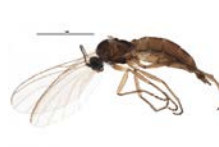
BIOUG07887-E12 [Lateral] Scatopsiara atomaria BIN URI: BOLD: AAH3920