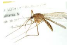
BIOUG01818-A04 [Lateral] Culiseta inornata BIN URI: BOLD:AAC9132