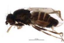
BIOUG01360-C08 [Lateral] Spelobia BIN URI: BOLD: AAG7308