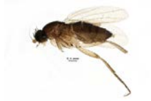
BIOUG12503-D11 [Lateral] Megaselia BIN URI: BOLD: ACN5785