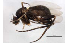
BIOUG01459-D09 [Lateral] Conicera BIN URI: BOLD: AAG3236