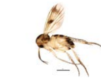
BIOUG01402-G02 [Lateral] Mycetophilidae BIN URI: BOLD: AAG4931