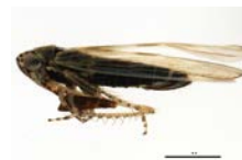
BIOUG00937-B09 [Lateral] Macrosteles quadrilineatus BIN URI: BOLD: AAA9422