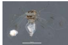
BIOUG07277-A08 [Dorsal] Aleyrodes BIN URI: BOLD: ABW2915