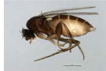
MTDIC-0025 [Lateral] Megaselia BIN URI: BOLD: AAG3234