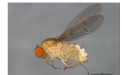
10BBCDIP-1496 [Lateral] Drosophila recens BIN URI: BOLD:ACF0720