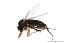
10PHMAL-0997 [Lateral] Megaselia diversa BIN URI: BOLD: ACR4654