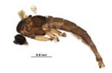
BIOUG21964-D10 [Lateral] Corynoptera BIN URI: BOLD: AAP8773