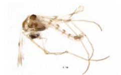
BIOUG04208-A11 [Lateral] Tanypodinae BIN URI: BOLD:ACC5968