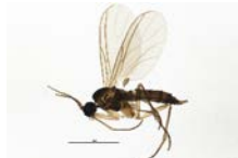
BIOUG02936-E01 [Lateral] Bradysia impatiens BIN URI: BOLD: AAV1295