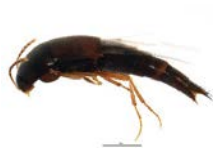
BIOUG00971-E06 [Lateral] Sepedophilus marshami BIN URI: BOLD:AA9241