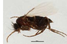
BIOUG01920-C07 [Lateral] Megaselia BIN URI: BOLD: AAG3303