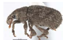
CCDB-22984-D05 [Lateral] Trachyploeus bifoveolatus BIN URI: BOLD:AAH0270