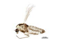
BIOUG20601-A05 [Lateral] Limnophyes sp. 14ES BIN URI: BOLD:ABU5525