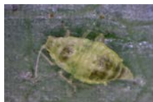
BIOUG07986-E06 [Dorsal] Betulaphis pelei BIN URI: BOLD: AA14153