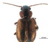
CCDB-23051-G02 [Dorsal] Dicheirotrichus cognatus BIN URI: BOLD:AAV5222