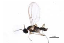
BIOUG16098-A11 [Lateral] Cecidomyiidae BIN URI: BOLD:ACP9720