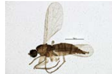
BIOUG02981-F02 [Lateral] Corynoptera cursor BIN URI: BOLD: AAP6465