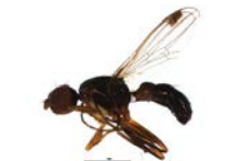
BIOUG01349-F06 [Lateral] Sepsis BIN URI: BOLD: AAC2855