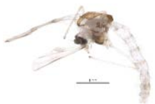
BIOUG25583-B05 [Lateral] Chironomidae BIN URI: BOLD:ACX8236