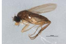
BIOUG01666-A06 [Lateral] Phoridae BIN URI: BOLD: ACF3749