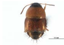
CCDB-22987-A11 [Dorsal] Tachyporus flavipennis BIN URI: BOLD:AAP7029