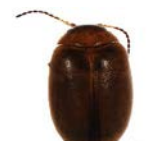
BIOUG00971-B09 [Dorsal] Cyphon variabilis BIN URI: BOLD:ACX4619