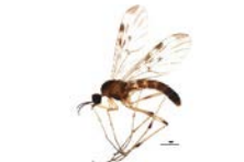
BIOUG01402-E12 [Lateral] Anisopodidae BIN URI: BOLD:AAG1996