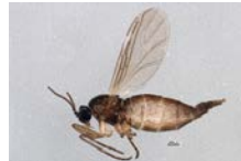
BIOUG02308-D01 [Lateral] Bradysia BIN URI: BOLD: ABX3194