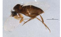
BIOUG04444-F02 [Lateral] Megaselia BIN URI: BOLD: ABV3315