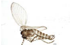
BIOUG04254-B06 [Lateral] Psychoda phalaenoides BIN URI: BOLD: AAF9317