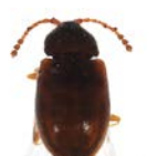
10PCCOL-0120 [Dorsal] Atomaria BIN URI: BOLD:AAP7043