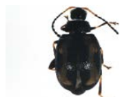
BIOUG05520-C10 [Dorsal] Phyllotreta striolata BIN URI: BOLD:AAL5267