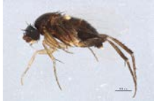
BIOUG10518-D10 [Lateral] Megaselia BIN URI: BOLD: ACD0632