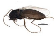
BIOUG21770-A06 [Lateral] Smittia sp. 14ES BIN URI: BOLD:ACW5117