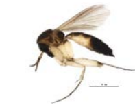
BIOUG01337-B11 [Lateral] Cordyla BIN URI: BOLD: ABU5545