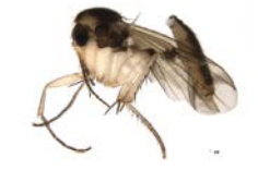
BIOUG04080-B06 [Lateral] Mycetophila gernerensis BIN URI: BOLD: ACD1714