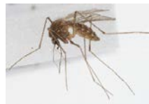
09BBDIP-1582 [Lateral] Culex tarsalis BIN URI: BOLD:ABY6040