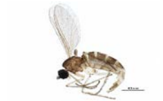
BIOUG14353-E05 [Lateral] Corynoptera perpusilla BIN URI: BOLD: AAN6447