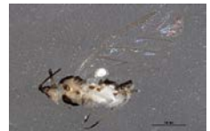
BIOUG03541-G02 [Lateral] Hyperomyzus lactucae BIN URI: BOLD: AAB8566