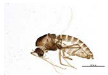
BIOUG01623-D05 [Lateral] Smittia sp. 8ES BIN URI: BOLD:ACP4736