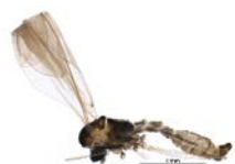
BIOUG25524-G07 [Lateral] Cecidomyiidae BIN URI: BOLD:AAP9022