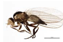
BIOUG04140-D12 [Lateral] Agromyzidae BIN URI: BOLD:AAU9505