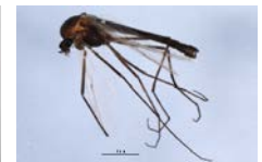
10BBCDIP-0399 [Lateral] Pagastia BIN URI: BOLD:AAP6893