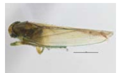
CNC#HEM305487 [Lateral] Empoasca luda BIN URI: BOLD: ACN9975