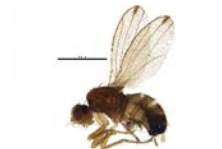
BIOUG06388-G04 [Lateral] Drosophila BIN URI: BOLD:AAG8495